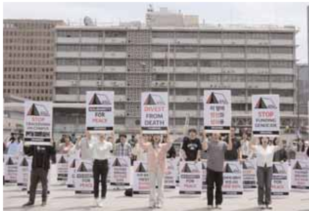
University students supporting Palestinian people stage a rally to demand a stop to the crackdown on demonstrators at rallies for Palestinians on the campus of U.S. universities, near the U.S. Embassy in Seoul, South Korea, Friday.

launched punishing assaults. Over a million Palestinians have fled to Rafah to escape fighting elsewhere, with many packed into UN-run shelters or squalid tent camps. The city on the border with Egypt is also a crucial hub for bringing in food, medicine, fuel and other goods. The UN's Office for the Coordination of Humanitarian Affairs, known as OCHA, says about 110,000 people have fled Rafah and that food and fuel supplies in the city are critically low. Georgios Petropoulos, an OCHA official working in Rafah, said the two main crossings near the city remain closed, cutting off supplies and preventing medical evacuations and the movement of humanitarian staff. "Even if there were assurances to us being able to pass through a corridor, the proximity so close to a military involved in fighting is just not acceptable for something that has to be a humanitarian zone," he said. The UN's World Food