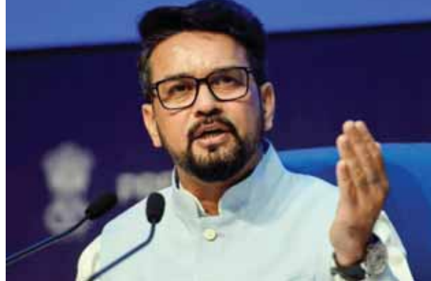
The Congress indulges in politics of appeasement and seeks Pakistan's support to get votes, he alleged.

PTI ■ SHIMLA Congress leaders live in India but speak the language of Pakistan, Union Minister Anurag Thakur said on Friday and alleged that the grand old party seeks Pakistan's support to get votes. "Leaders of opposition parties, especially the Congress, repeatedly make statements supporting Pakistan, crushing Sanatam Dharma and insulting the Hindu community, besides pleading for more resources for people with more wives and children," Thakur told reporters in Sujanpur.