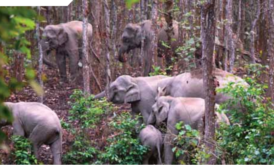
A herd of elephants grazes near a village at Boko, in Kamrup district of Assam