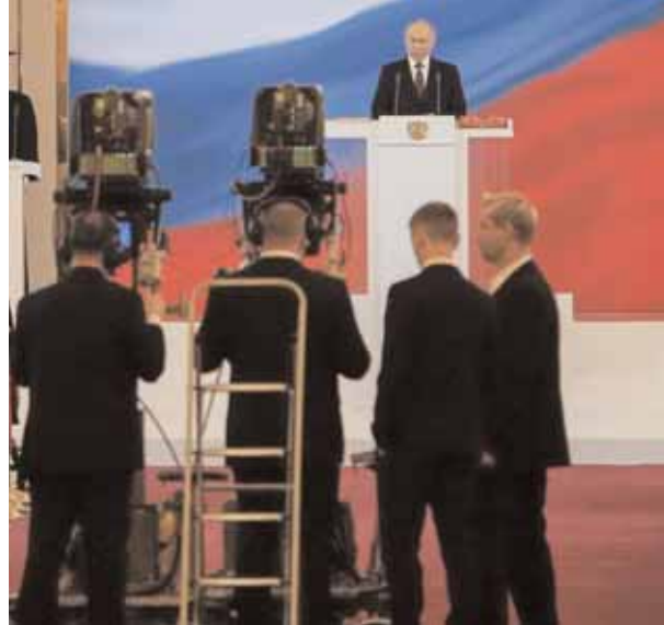
Vladimir Putin takes oath as Russian president during an inauguration ceremony in the Grand Kremlin Palace in Moscow, Russia.

Under the constitutional changes approved in 2020, the lower house approves the candidacy of the prime minister, who then submits Cabinet members for approval. The changes were ostensibly meant to grant parliament broader