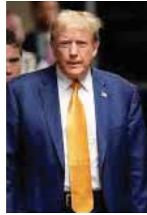
Trump, the presumptive Republican presidential nominee, drew what his team called a "mega crowd" to a Saturday evening rally in the southern New Jersey resort town of Wildwood, 150 miles (241

Blasting the Democratic president "a total moron," Trump before a crowd of tens of thousands repeatedly characterized the cases against him as politically motivated and timed to harm his ability to campaign. "He's a fool. He's not a smart man," Trump said of Biden. "I talk about him differently now because now the gloves are off."