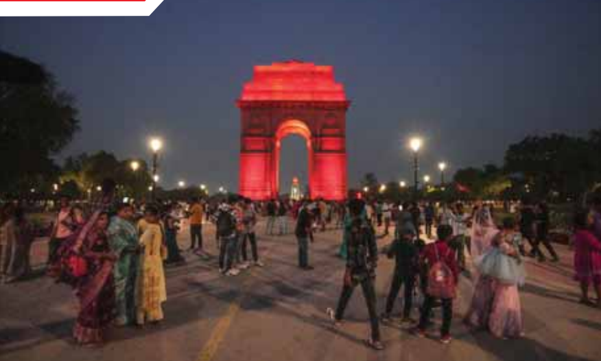
India Gate lit in red to raise awareness on World Thalassemia Day, in New Delhi