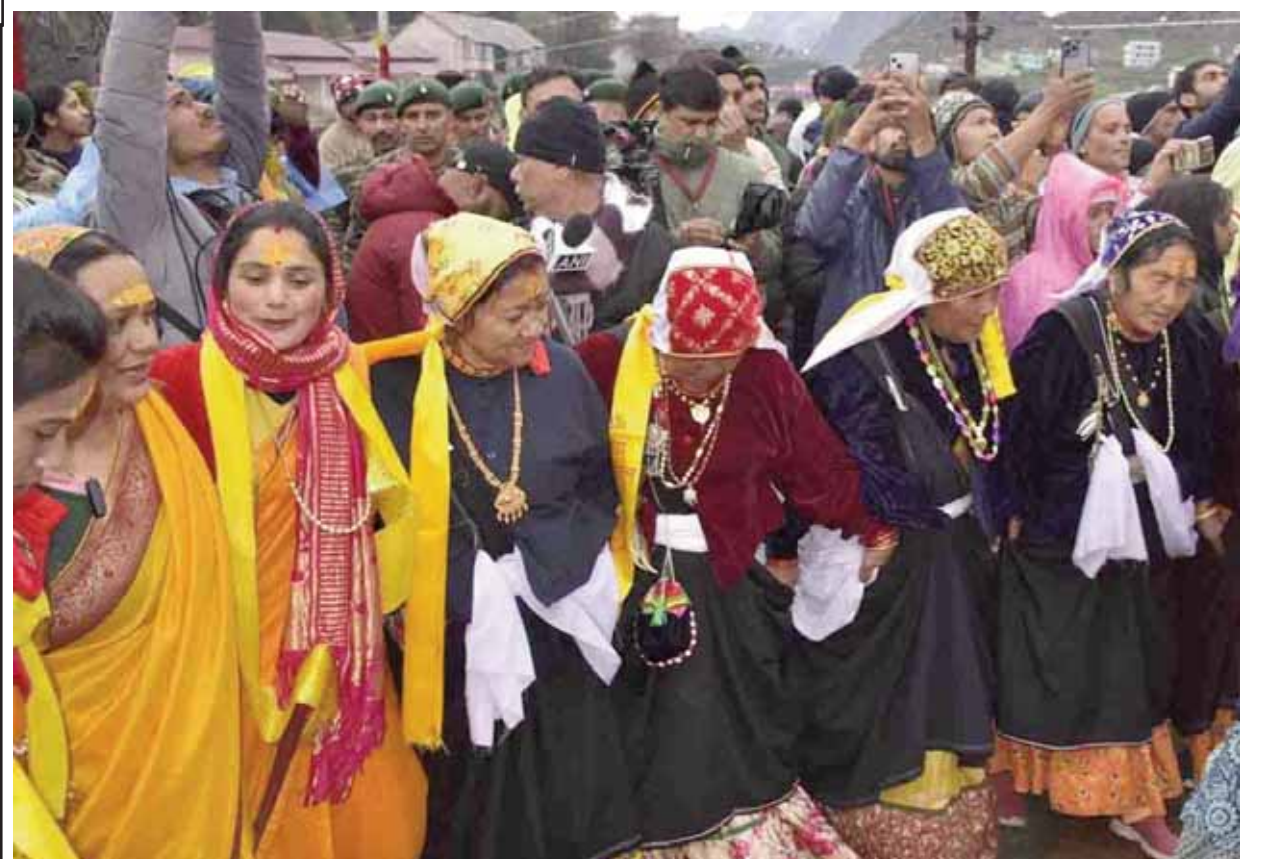
Local women dance to a devotional folk song in Badrinath to celebrate reopening of the temple on Sunday

Ukhimath, 14.5 millimetres in Agastyamuni, 11 millimetres in Nainbagh and trace rain in Mussoorie. The maximum and minimum temperatures in various places on Sunday were 36 degrees Celsius and 21.8 degrees Celsius respectively in Dehradun, 36.3 degrees Celsius and 21.5 degrees Celsius in Pantnagar, 22.6 degrees Celsius and 11.5 degrees Celsius in Mukteshwar and 24.9 degrees Celsius and 11.5 degrees Celsius in New Tehri.