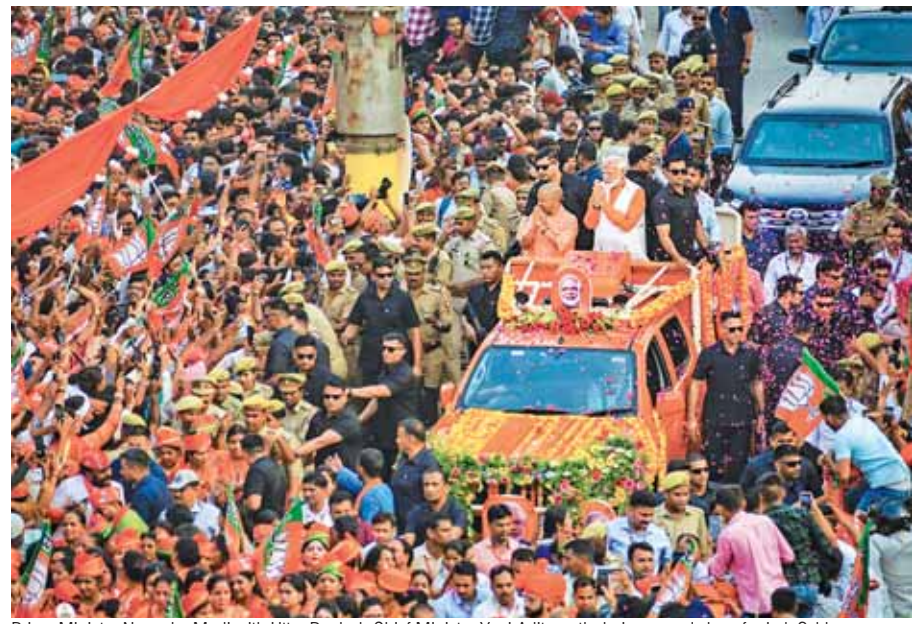
Prime Minister Narendra Modi with Uttar Pradesh Chief Minister Yogi Adityanath during a road show for Lok Sabha elections, in Varanasi, on Monday