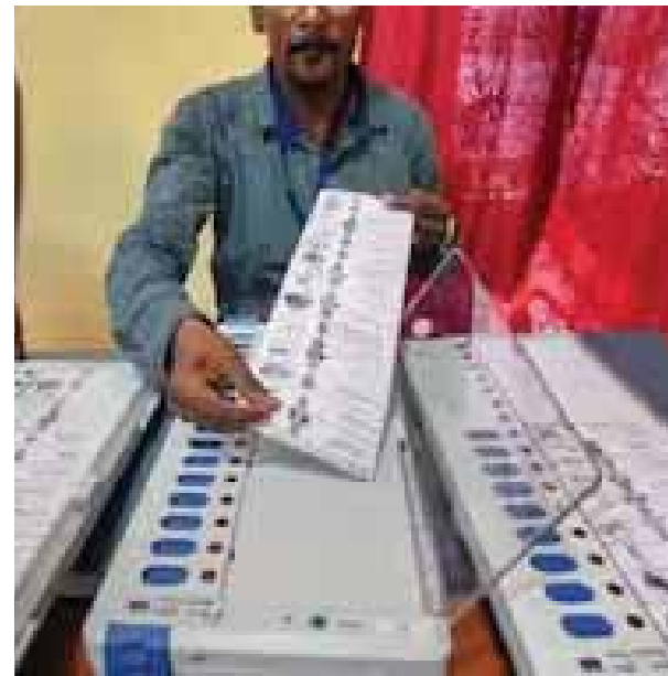
It said EVMs do not allow voters to verify that their votes have been accurately recorded. "Furthermore, given their

Seeking physical counting, the plea said the counting of all VVPAT slips can be done "accurately with a fraction of the employees and at a fraction of cost and within five to eight hours." It said the VVPAT paper is of the same size as the thermal print out received when a credit or debit card is swiped on making a payment. "The counting of the slips after they have been sorted candidate-wise, is in fact easier than counting normal paper because the VVPAT paper slip is slightly curled on account of being thermally printed from a roll. The curling makes the picking up of the paper slip from the surface of a table easy." "Each slip can be counted while being picked to make bundles of 25 slips as mandated under instructions given in the ECI's Manual on EVM and VVPAT, 2023," the plea said.