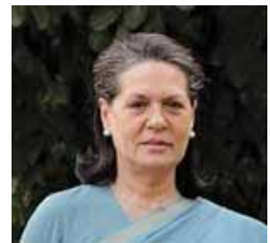
woman from a poor family," she said in her message, an appeal to people voting in the ongoing fourth round of the seven-phase general elections to support the Congress. Sonia Gandhi said the Congress' "guarantees" have already changed the lives of crores of families in Karnataka and Telangana, where it has also implemented the scheme. The Congress is in power in these two southern states. "Be it MGNREGA, Right to Information, Right to Education or through schemes like Food Security, the Congress party has empowered millions of Indians. The 'Mahalakshmi' is the latest guarantee to take our work forward," Sonia Gandhi said.

Congress Parliamentary party chairperson Sonia Gandhi on Monday assured people that the "guarantees" listed by the party in its Lok Sabha poll manifesto will change their circumstances in this "difficult time". In a video message, which was shared by the Congress on social media, she said women of the country are facing tough times in the wake of a "severe crisis" and the party's 'Mahalakshmi scheme' for them will help change their lives. "My dear sisters, women have made a huge contribution, from the freedom struggle to the creation of modern India. However, today our women are facing a crisis amid severe inflation. To do justice to their hard work and penance, the Congress has come up with a revolutionary guarantee," Sonia Gandhi said. "The Congress 'Mahalakshmi' scheme guarantees that we will give Rs 1 lakh every year to a