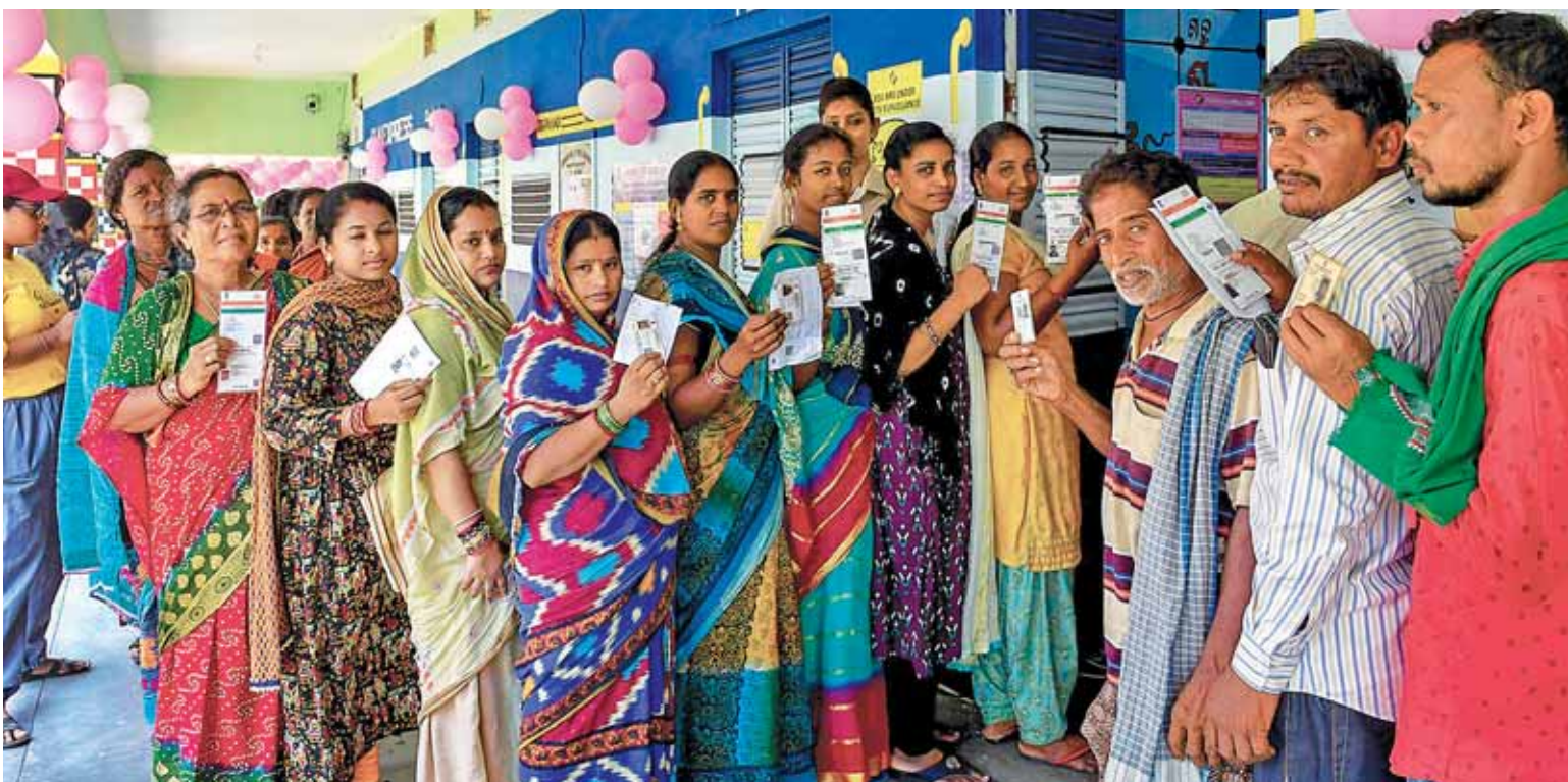
Voters display identity cards while standing in queue to cast their votes during the phase IV of general elections, in Berhampur, Odisha, on Monday

The intense voters' awareness programmes for increasing the turnout remained futile as the phase four general elections on Monday saw the average plummeting to over 63 per cent till 8.30 pm on Monday. The voter turnout in the first three phases was 66.14 per cent, 66.71 per cent and 65.68 per cent, respectively. Interestingly the good news came in from Jammu and Kashmir which saw voting after abrogation of Article 370. Srinagar recorded 36.88 per cent voter average. This figure is higher than Srinagar's turnout in 2019 when it saw a turnout of 14.43 per cent. The figures for 2014, 2009, 2004 and 1999 are 25.86 per cent, 25.55 per cent, 18.57 per cent and 11.93 per cent respectively. Elections were held in 96 constituencies spread over 10 States and UTs amid incidents of violence between Trinamool Congress and BJP workers in West Bengal, while YSRCP and TDP cadres came to blows at multiple locations in Andhra Pradesh as well as reports of poll boycott in some Uttar Pradesh villages. Besides, there were also reports of EVMs malfunctioning at some booths in West Bengal and Odisha. This schedule was a critical round for the Congress and not much for the BJP. According to the Election Commission, polling was held smoothly and peacefully. With