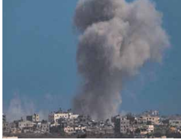
Smoke rises following an Israeli bombardment in the Gaza Strip as seen from southern Israel, Monday.

35,000 people in Gaza, mostly women and children, according to Gaza’s Health Ministry, which doesn’t distinguish between civilians and combatants. The small student protest Sunday at Duke’s graduation in Durham, North Carolina, was emblematic of campus events across the US Sunday after weeks of student protests resulted in nearly 2,900 arrests at 57 colleges and universities. Students at campuses across the US responded this spring by setting up encampments and calling for their schools to cut ties with Israel and businesses that support it. Students and others on campuses whom law enforcement authorities have identified as outside agitators have taken part in the protests from Columbia University in New York City to UCLA. Police escorted graduates’ families past a few dozen pro-Palestinian protesters who tried to block access to Sunday