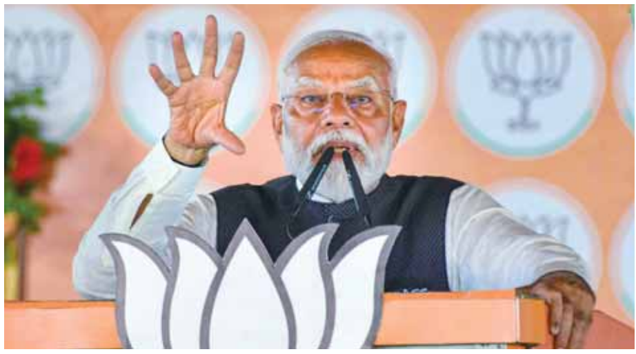
the bloc's plan to have a different PM, every year, for five years, succeeds. However, they are a motley group that is bound to fail," he said. "The current elections are for having a government that will give a further boost to the standing and clout enjoyed by the country," the PM said. Modi also said the money recovered in raids against politicians "belonged to the country's poor." "I will tell you why they are

wearing bangles. "If Pakistan does not wear bangles, we will make the country wear these. I knew they did not have foodgrains. Now, I come to know they do not even have adequate supply of bangles," the PM said. "But, we must look carefully at the opposition which seems to be full of cowards and timid people, who give a clean chit to Pakistan on terrorism, raise doubts on surgical strikes... their Left allies even want our nuclear arsenal to be dismantled," he said. Modi maintained that the INDIA bloc had worked out a formula, which would allow five of its leaders, if the coalition came to power, to enjoy a year of premiership each. "Just imagine what type of a mess we would get to see if