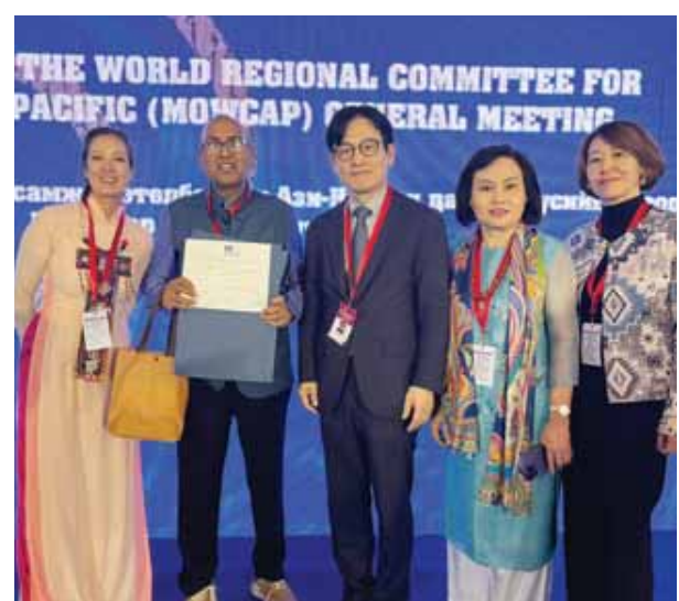
the Regional Register since its inception in 2008. "Their inclusion in the register highlights their transcendent influence, which extends beyond borders and generations, shaping the moral fabric and artistic expressions of diverse cultures." "This achievement highlights the timeless value and influence of these literary works, which have deeply impacted Indian

India's literary masterpieces 'Ramcharitmanas', 'Panchatantra', and 'Sahdayaloka-Locana' have earned a prestigious place in UNESCO's Memory of the World Asia-Pacific Regional Register, a significant acknowledgment of their cultural and historical importance. Authored by Kashmiri poet Acharya Anandvardhan, Pandit Vishnu Sharma, and Hindu saint and poet Goswami Tulsidas respectively, these trio iconic Indian literary works have left an enduring impact on readers and artists in India as well as worldwide. In what is a proud moment for India, their inclusion in prestigious UNESCO register also adds a feather in the cap of the Indira Gandhi National Centre for the Arts (IGNCA) which had played a crucial role in securing their inclusion at the 10th meeting of the Memory of the World Committee for Asia and the Pacific (MOWCAP) in Ulaanbaatar. Significantly, this is the IGNCA's first achievement at