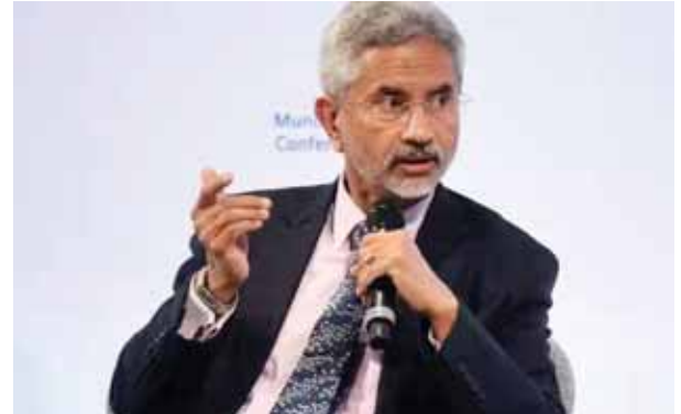
casualties on both sides. Since then India-China relations have been in an "abnormal state", with both sides amassing its troops along the LAC. The External Affairs Minister said people are saying Chinese are building villages on the border, but it is in a place called Longju (along Line of Actual Control in Arunachal Pradesh), which the Chinese attacked and occupied in 1959. "If you look at the Google map, please look at that village and triangulate it with what Nehru said to the

External Affairs Minister S Jaishankar on Monday said the Congress holds Prime Minister Narendra Modi accountable for the mistakes made by first prime minister Jawaharlal Nehru when making comments on China while believing the party has no culpability for the past acts. On Chinese belligerence in Ladakh and Arunachal Pradesh, Jaishankar said Indian land was taken by China between 1958 and 1962, and some of it before 1958 as well. Attacking Rahul Gandhi, Jaishankar said it is "very very sad" to "gun down your own forces". "When you keep saying land taken by China, it was lost in 1962. I see efforts made to mislead the country," he said in response to a question at a news conference here. China and India have been witnessing an unease in ties, especially after the Galwan Valley incident of June 2020 when Chinese and Indian soldiers clashed, resulting in