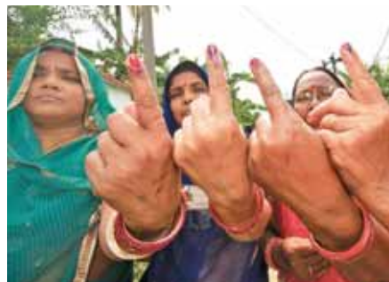
PIONEER NEWS SERVICE ■ PATNA