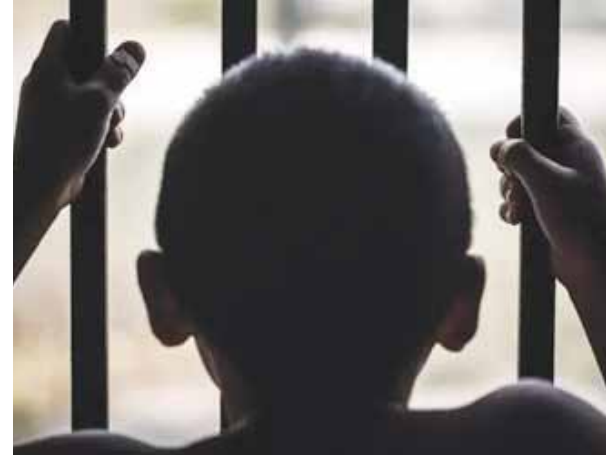
high numbers of detained children despite no visits from JJBs. In Bihar, where 34 per cent of prisons responded, 1,518 children were transferred out of adult jails. Instances were noted of more children being identified by JJBs than those transferred. Madhya Pradesh

not all those who were juveniles at the time of their alleged offence, including those identified by prison visitors, families or through self-identification," it said. Several states failed to adequately respond to enquiries, with notable non-compliance from Madhya Pradesh, West Bengal, Nagaland and the Union Territory of Ladakh. Among the states that responded, the study said the figures reveal alarming patterns. With a response rate -- jails that provided data -- of 71 per cent, Uttar Pradesh reported that 2,914 children were transferred from prisons to juvenile homes. However, the data indicates discrepancies, with some prisons showing