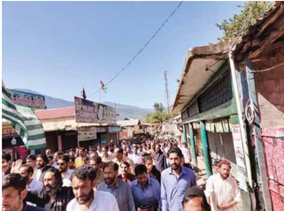
The situation remained tense as strike in PoK entered fourth day

left for Muzaffarabad, the capital of Pakistan-occupied Kashmir, on Monday as the wheel-jam strike entered its fourth day. The movement announced its march on Muzaffarabad after the talks between the JAAC core committee and Chief Secretary of the region Dawood Bareach ended in a stalemate. A protest leader from Rawalakot accused the government of resorting to evasive tactics. Protestors have already staged sit-ins, closing Kohala-Muzaffarabad Road at several locations, the Dawn newspaper reported. The road stretches 40 kilometres and links Kohala town with Muzaffarabad in PoK. Heavy contingents of police have been posted at roundabouts and sensitive locations. Markets, trade centres and educational institutes remain closed, while transport is suspended, reports said. The so-called government called in the Rangers after clashes between the police and protesters erupted in Mirpur during demonstrations on Saturday. Expressing deep concern over