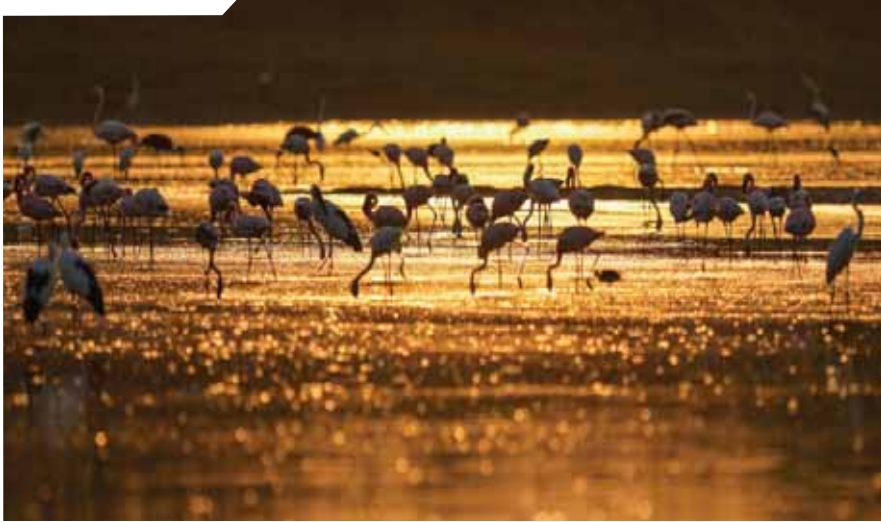
Flamingoes at the Thol Bird Sanctuary in Mehsana district