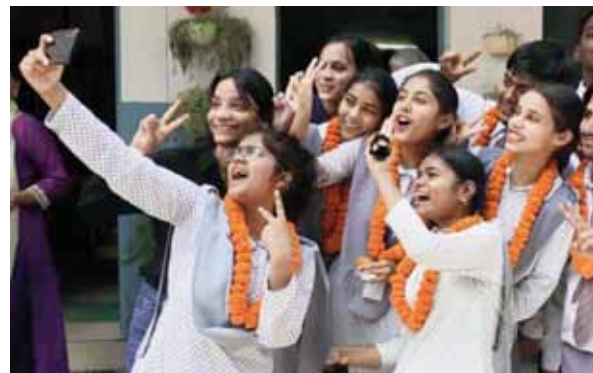
School students pose for a selfie in Dehradun after declaration of CBSE results on Monday.

and 134 students passed the class X and XII examinations respectively.