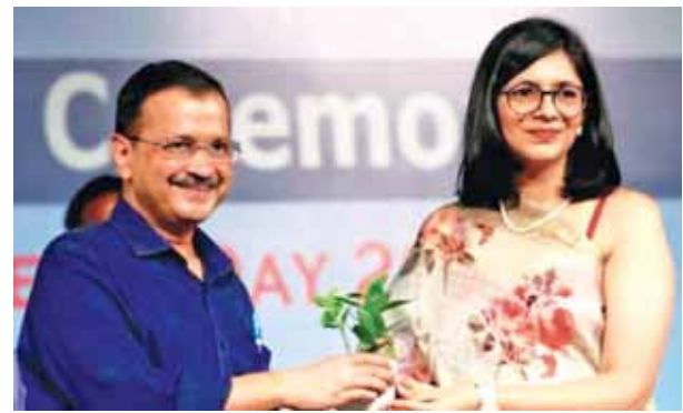
Delhi Chief Minister Arvind Kejriwal with Rajya Sabha MP Swati Maliwal