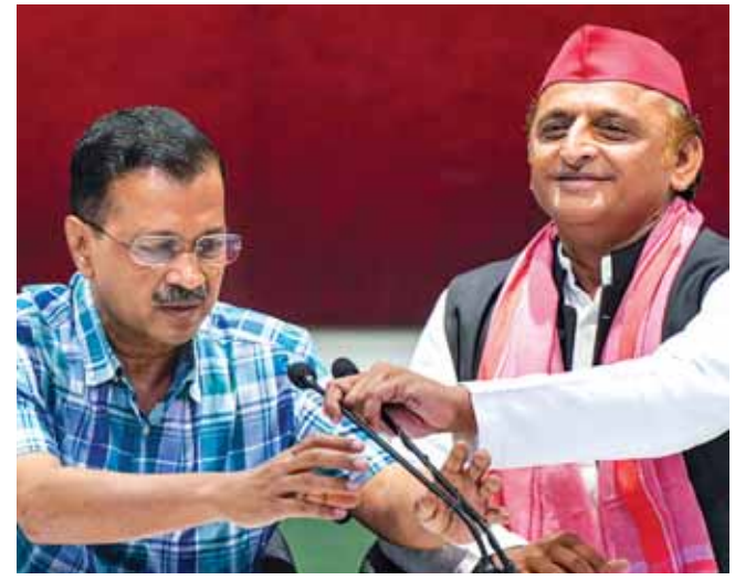
LUCKNOW PIONEER NEWS SERVICE

Minister said, "Your enthusiasm shows that you have made it difficult for the INDIA alliance to win even a single seat in Uttar Pradesh." Attacking SP chief Akhilesh Yadav, Modi said, "SP's shehzade also makes fun of Kashi. They are crossing every limit to please their vote bank. I am surprised that it is the 21st century and they are roaming around with the flag of triple talaq." Accusing the leaders of the INDIA Bloc of advocating reservation on the basis of religion, Modi said, "They advocate reservation on the basis of religion. They want to take away the right of reservation of the SCs, STs and OBCs by changing the Constitution of the country."