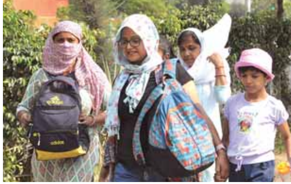
People use scarves to shield themselves from the hot summer.

If you're residing in northwest India, brace yourself for intense heatwaves ahead. Days after predicting thunderstorms and rain spells in the region, the India Meteorological Department (IMD) on Thursday issued warnings of impending heatwave conditions, notably in Punjab, Haryana, Rajasthan, and Delhi. By Saturday, in fact, temperatures in the national Capital could soar to 45 degrees Celsius, exacerbating the already intense heat conditions. For the next five days, the Northwest region is expected to bear the brunt of heatwaves, owing to westerly and northwesterly winds, said the IMD, flagging heightened health concerns, particularly for vulnerable populations such as infants, the elderly, and those with underlying