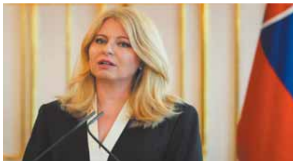
Slovakia's incumbent President Zuzana Caputova speaks during joint press statements with President elect Peter Pellegrini at the presidential palace in Bratislava, Slovakia, on Thursday. Slovak Prime Minister Robert Fico was in serious but stable condition Thursday, a hospital official said, after the populist leader was shot multiple times in an assassination attempt.

Slovak authorities charged a man Thursday with attempting to assassinate populist Prime Minister Robert Fico, saying the suspect acted alone in a politically motivated attack that laid bare the extreme polarization that has gripped the small central European country. Fico, 59, was in serious but stable condition a day after being shot multiple times in the stomach, a hospital official said. President-elect Peter Pellegrini said he spoke to Fico at the hospital but confirmed his condition "remains very serious." The attempted assassination has shocked the nation and reverberated across the continent weeks ahead of European elections. While President Zuzana Caputova called on everyone to take the opportunity to dial back the vitriol that has characterized the political debate, some government ministers took aim at Slovakia's media for contributing to the fractious atmosphere. Interior Minister Matus Sutaj Estok asked jour-