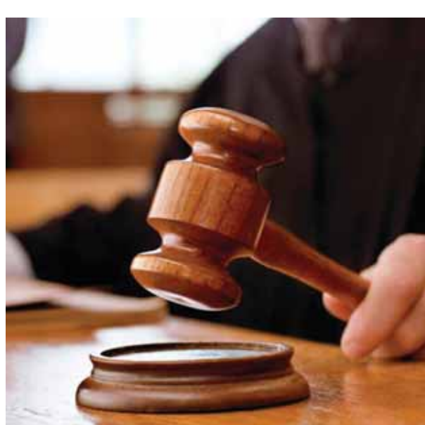
not brook interference on any count," the top court said in its judgement.

The civic body had approached the top court challenging the judgement of a division bench of the Kolkata High Court which had quashed acquisition of a property at Narkeldanga North Road in the city for constructing a park. The high court had held that the civic body had no power under a specific provision to go for compulsory acquisition. "We are of the considered opinion that the High Court was fully justified in allowing the writ petition and rejecting the case of the appellant-Corporation acquiring land under Section 352 of the Act. The impugned judgment does