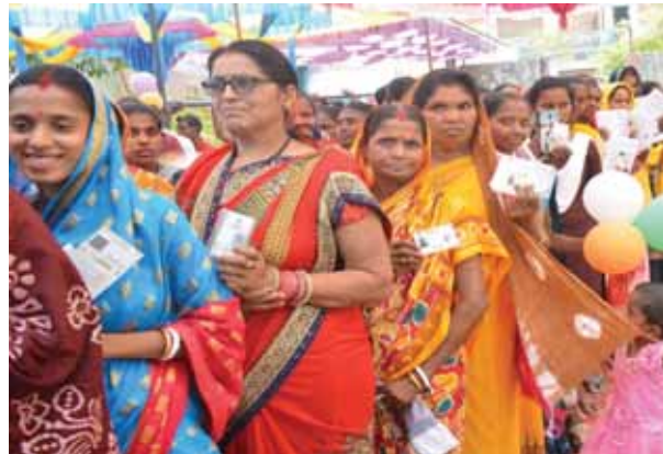
The EC said there is enhanced focus on to inform, motivate and facilitate voters in the remaining three phases of the parliamentary polls and state chief electoral officers have been asked to step up measures.

In the first phase of the ongoing general elections, a 66.14 per cent turnout was recorded. In the 2019 polls, the turnout