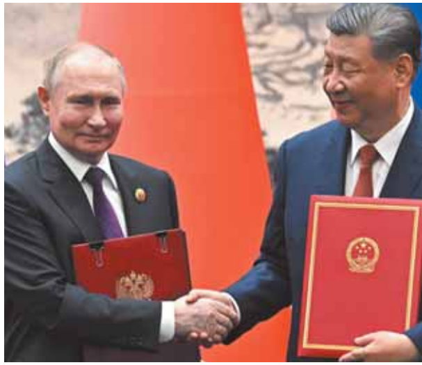
Chinese President Xi Jinping, right, and Russian President Vladimir Putin attend a signing ceremony in Beijing, China, on Thursday.

Chinese President Xi Jinping on Thursday hinted at a political settlement to end the Ukraine war, saying he expects peace and stability will return to the European continent, shortly after his talks with Russian counterpart Vladimir Putin as the two leaders vowed to counter any attempt by the US to hinder their strategic ties. Putin received a grand welcome upon his arrival here earlier in the day on his first foreign visit after winning the fifth term in office in March for wide-ranging talks with Xi to reset the burgeoning China-Russia strategic ties for future. "China hopes that peace and stability will return to the European continent at an early date, and stands ready to play a constructive role to this end," Xi said at a joint press conference with Putin after their talks. A joint statement issued after Putin-Xi talks said that both sides believe that for "a sustainable settlement of the Ukrainian crisis, it is necessary to eliminate its root causes." In a veiled criticism of the US, which is pressuring Beijing to end its strategic ties with Russia, the joint statement said relations between China and Russia do not target any third countries, therefore they will counter any attempts to hinder such cooperation. "The two sides note that the relationship between Russia and China has progressed to a more advanced interstate cooperation compared to the mili-