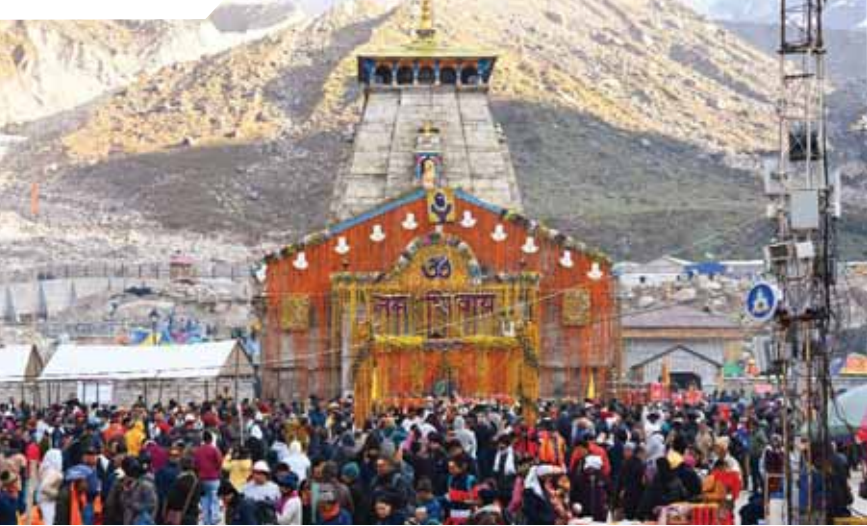
Devotees at the Kedarnath temple during the 'Char Dham Yatra,' in Rudrapur