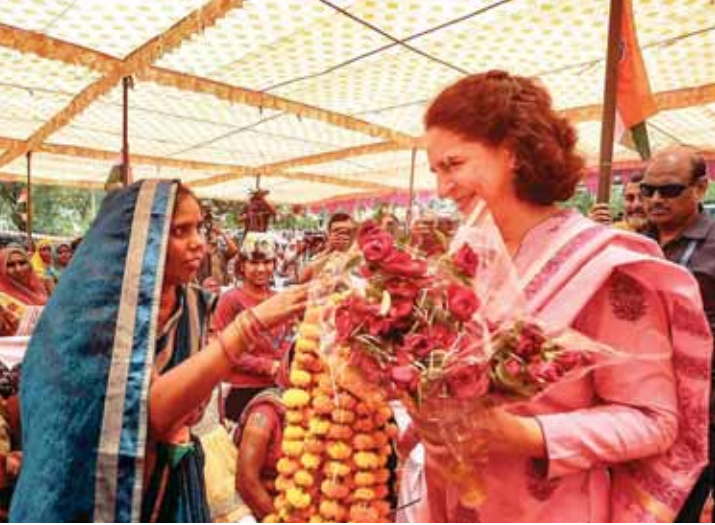
RAEBARELI PIONEER NEWS SERVICE

Congress leader Priyanka Gandhi Vadra, who has been canvassing continuously every day in Amethi and Rae Bareilly simultaneously, is highlighting the strong bond of the Gandhi family with both constituencies since the days of former Prime Ministers Indira Gandhi and Rajiv Gandhi. This effort comes as her sibling Rahul Gandhi contests in Amethi, having taken over from his mother, Sonia Gandhi. Priyanka said the grand old party follows the ideals of Mahatma Gandhi who uttered "Hey Ram" before dying and Prime Minister Narendra Modi is wrong in accusing it of being anti-religion. She alleged that while the saffron party claims to be a "champion of Hindu religion," the condition of the State-run cowsheds in Uttar Pradesh remains pitiable. She accused the Modi Government of trying to take