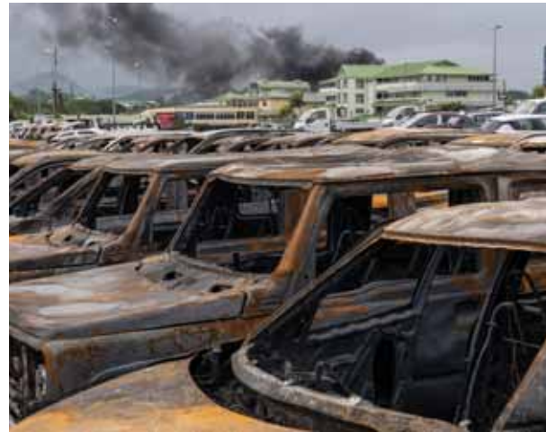
Burnt cars are lined up after unrest in Noumea, New Caledonia, Wednesday. France has imposed a state of emergency in the French Pacific territory of New Caledonia

Violence raged across New Caledonia for the third consecutive day on Thursday, hours after France imposed a state of emergency in the French Pacific territory, boosting security forces' powers to quell deadly unrest in the archipelago that has long sought independence. French authorities in New Caledonia and the interior ministry in Paris reported that five people, including two police officers, have been killed in the violence after protests earlier this week over voting reforms pushed by President Emmanuel Macron's government turned deadly. At least 60 members of the security forces were injured and 214 people were arrested in the Thursday's clashes with police, arson and looting, according to the territory's top French official, High Commissioner Louis Le Franc. "Everything is being done to restore order and calm that Caledonians deserve," French Prime Minister Gabriel Attal said