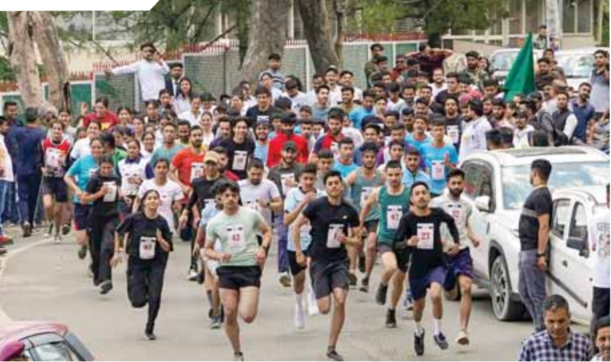
Participants at the 'Run For Vote' marathon for the Lok Sabha election awareness, in Shimla