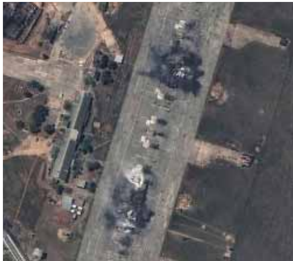
This image shows an overview of destroyed SU 27 fighter aircraft in revetment at Belbek air base in Crimea on Thursday.

meters from the border, President Volodymyr Zelenskyy told reporters on Friday. Separately, in his strongest remarks yet on Ukraine's upcoming peace conferences slated for next month, Putin said it was a vain attempt to enforce terms of a peaceful settlement on Russia. Putin emphasized that Russia wasn't invited to the Swiss-hosted meeting. He said that Russia was ready for talks but shrugged off Ukrainian Zelenskyy's peace formula as wishful thinking. He said that prospective peace talks could be based on a draft deal that was negotiated by Russia and Ukraine during their Istanbul talks in 2022. Meanwhile, the drone raids on Crimea marked Kyiv's attempt to strike back during Moscow's offensive in northeastern Ukraine, which has added to the pressure on outnumbered and outgunned Ukrainian forces, which are waiting for delayed deliveries of crucial weapons and ammunition from Western partners. A Ukrainian intelligence official confirmed to The Associated Press that Ukraine's Security Service and Military Intelligence conducted a joint operation to strike Russia's military infrastructure sites in Novorossiysk, on the Black