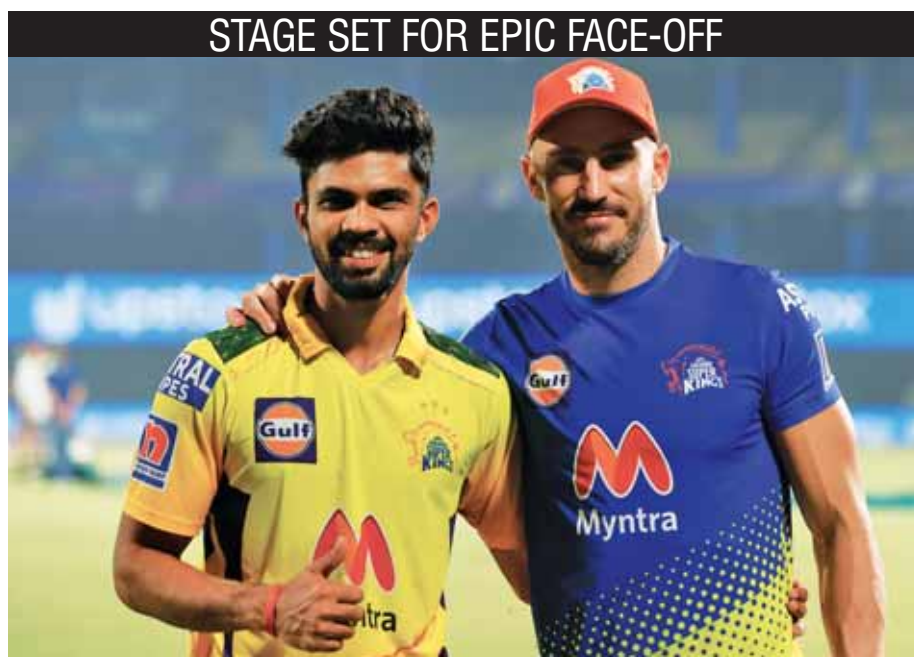
STAGE SET FOR EPIC FACE-OFF

du Plessis is back among runs, having capped single digit scores in his last two outings. In the middle order, Rajat Patidar and Cameron Green have both showcased compelling form. Mahipal Lomror and Dinesh Karthik would be looking to make the most out of the Chinnaswamy track, which is typically a good batting wicket. As for RCB's bowling, Yash Dayal has been their star, bagging the most wickets this season. Lockie Ferguson, Mohammed Siraj, Green, and Swapnil Singh face a formidable task ahead. Will Jacks, who has impressed with the bat, is a part-time spin bowling option. But it will be interesting to see if he is utilised on this track. For CSK, Ruturaj Gaikwad has been the team's top run-scorer this season and is expected to