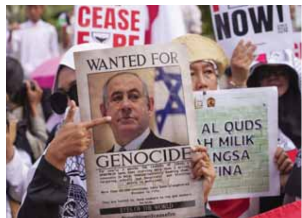
A protester holds a poster of Israeli Prime Minister Benjamin Netanyahu during a rally commemorating the 76th anniversary of the mass expulsion of the Palestinians from what is now Israel in 1948, often called the "Nakba" or Arabic for catastrophe, outside the U.S. Embassy in Jakarta, Indonesia on Friday.

Israel strongly denied charges of genocide on Friday, telling the United Nations' top court it was doing everything it could to protect the civilian population during its military operation in Gaza. The International Court of Justice wrapped up a third round of hearings on emergency measures requested by South Africa, which says Israel's military incursion in the southern city of Rafah threatens the "very survival of Palestinians in Gaza" and has asked the court to order a cease-fire. Tamar Kaplan-Tourgeon, one of Israel's legal team, defended the country's conduct, saying it had allowed in fuel and medication to the beleaguered enclave. "Israel takes extraordinary measures in order to minimize the harm to civilians in Gaza," she told The Hague-based court. A protester shouting "Liars" briefly interrupted Kaplan-