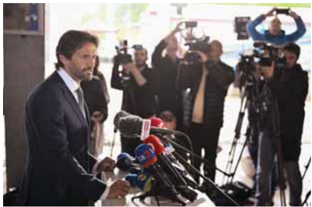
Deputy Prime Minister and Defence Minister of Slovakia Robert Kalinak speaks during a media briefing outside the F. D. Roosevelt University Hospital, where Slovak Prime Minister Robert Fico, who was shot and injured on May 15, is treated, in Banska Bystrica, central Slovakia, Friday.