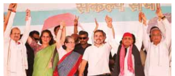
Congress leader and party candidate from Rae Bareilly constituency Rahul Gandhi with party leaders Sonia Gandhi and Priyanka Gandhi, Samajwadi Party (SP) chief and party candidate from Kanpur constituency Akhilesh Yadav, former Chhattisgarh Chief Minister Bhupesh Baghel and others during a public meeting for the Lok Sabha elections, in Rae Bareilly district, on Friday