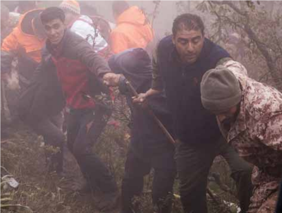
rescue team members work at the scene of a crash of a helicopter carrying Iranian President Ebrahim Raisi in Varzaghan in northwestern Iran, Monday

previously associated with Iran's shah or those in his government. Mokhber oversaw a bonyad known in English as the Execution of Imam Khomeini's Order, or EIKO, referring to the late Supreme Leader Ayatollah Ruhollah Khomeini. The US Treasury said the organisation oversaw billions of dollars in assets as "a business juggernaut under the direct supervision of Supreme Leader Ali Khamenei that has a stake in nearly every sector of the Iranian economy, including energy, telecommunications, and financial services." "EIKO has systematically violated the rights of dissidents by confiscating land and property from opponents of the regime, including political opponents, religious minorities, and exiled Iranians," the Treasury said in 2021 in sanctioning Mokhber. The European Union also had sanctioned Mokhber for a time with others over concerns then about Iran's nuclear programme. As the head of EIKO, Mokhber oversaw an effort to make a COVID-19 vaccine during the height of the pandemic, pledging to make tens of millions of