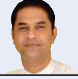
RAJYOGI BRAHMAKUMAR NIKUNJ JI

Independence is not possible without education in emotional self-control