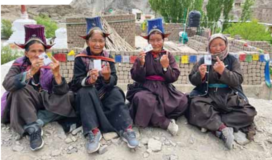
People show their inked finger after casting their vote during the fifth phase of Lok Sabha elections, in Ladakh