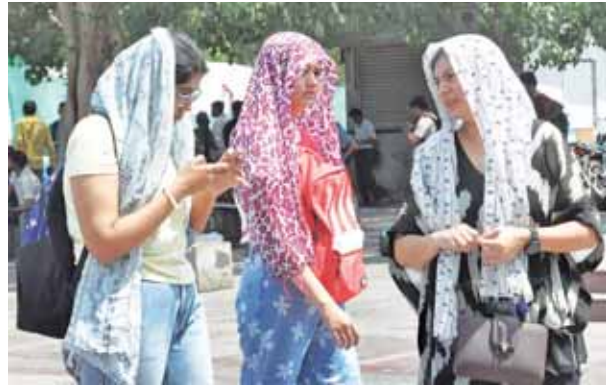
Women cover themselves with dupattas to beat blistering heat on Monday in New Delhi

There seems to be no respite from the sweltering heat for the residents of Northwest India, including Delhi, with the India Meteorological Department (IMD) issuing a stark warning on Monday of impending heatwave to severe heatwave conditions over the next five days in the region. As temperatures increased to alarming 48-degree Celsius mark in Delhi's Najafgarh and red alerts issued for the national Capital and extensive regions of northwest India, the severity of the situation cannot be overstated. This has also pushed the country's peak power demand to hover near the projected 235 GW level in