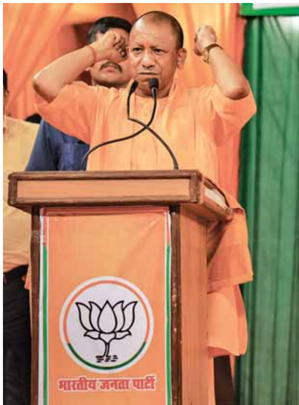
UP Chief Minister Yogi Adityanath addresses a campaign meeting in support of BJP candidate for East Delhi seat Harsh Malhotra for Lok Sabha polls, in New Delhi, on Monday

elections. This comes after Srinagar recorded 38.49 per cent polling during the fourth phase. Baramulla is one of the three seats in the Kashmir division of J&K other than Srinagar and Anantnag-Rajouri-where the BJP has not fielded any candidates. In 2019, the constituency recorded a turnout of 34.6 per cent, whereas in 1989, it was at a mere 5.48 per cent, the commission said. As per the EC's voter turnout App, Ladakh recorded at 67.15 per cent, Jharkhand at 63.00 per cent and Bihar 52.60 per cent, Jammu and Kashmir 54.67 per cent, Odisha 60.72 per cent, Uttar Pradesh 57.79 per cent. In Maharashtra, the Dindori seat recorded highest voter turnout of 57.06 per cent, Bhiwandi recorded 49.43 per cent, Dhule 48.81 per cent, Dindori 57.06 per cent, Kalyan 41.70 per cent, Mumbai South 46.91 per cent, Mumbai North Central 47.46 per cent, Mumbai North East 48.67 per cent, Mumbai North West 49.79 per cent, Mumbai South 44.63 per cent, Mumbai South Central 48.26 per cent, Nashik 51.16 per cent, Palghar 54.32 per cent, Thane 48.04 per cent and Kalyan 41.70 per cent. In 14 Lok Sabha seats of Uttar Pradesh, Amethi and Raebareli, two well-known constituencies in the State recorded voter turnout