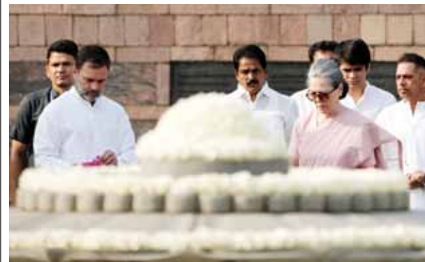
Congress leaders Sonia Gandhi and Rahul Gandhi pay tributes to former Prime Minister Rajiv Gandhi on his death anniversary at Veer Bhumi, in New Delhi, on Tuesday