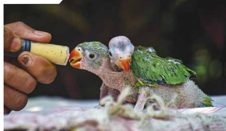
A man feeds a parrot's chick that fell off a tree, in Guwahati