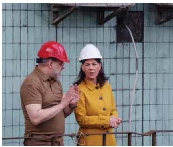
Germany's Foreign Minister Annalena Baerbock speaks to Ukrainian Energy Minister Herman Halushchenko during official visit to a thermal power plant which was destroyed by a Russian rocket attack in Ukraine, Tuesday.

AP ■ KYIV Germany's foreign minister arrived in Kyiv on Tuesday in the latest public display of support for Ukraine by its Western partners, although deliveries of promised weapons and ammunition from NATO countries like Germany have been slow and have left Ukraine vulnerable to a recent Russian push along parts of the front line. Annalena Baerbock renewed Berlin's calls for partners to send more air defense systems, as Russia pounds Ukraine with missiles, glide bombs and rockets. Germany is the second-biggest supplier of military aid to Ukraine after the United States. Ukraine's depleted troops are trying to hold off a fierce Russian offensive along the eastern border in one of the most critical phases of the war, which is stretching into its third year. Germany recently pledged a third US-made Patriot battery for Ukraine, but Kyiv officials say they are still facing an alarming shortfall of air defenses against the Russian onslaught. The Kremlin's forces have used their advantage in the skies to debilitate Ukraine's power grid, hoping to sap Ukrainian morale