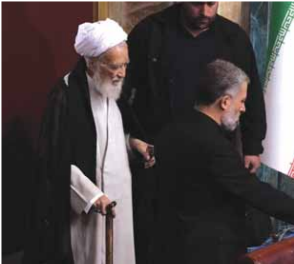
Ayatollah Mohammad Ali Mowahedi Kermani arrives to attend the first session of Assembly of Experts after an election that decided the new assembly, in Tehran, Iran, Tuesday. Under Iranian constitution the 86-member all-cleric assembly has the right to monitor the performance of supreme leader, and choosing or dismissing him. Mowahedi Kermani was picked Tuesday as head of the assembly.