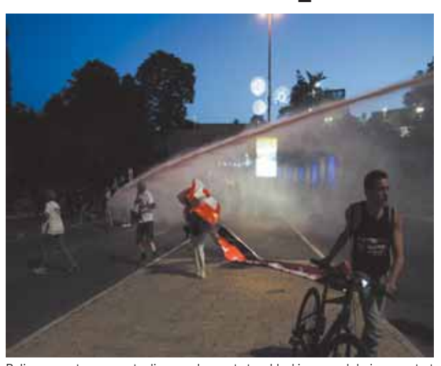
Police use water cannon to disperse demonstrators blocking a road during a protest against Israeli Prime Minister Benjamin Netanyahu's government, and calling for the release of hostages held in the Gaza Strip by the Hamas militant group, outside the Knesset, Israel's parliament in Jerusalem on Monday.

Israel sought Tuesday to contain the fallout from a request by the chief prosecutor of the world's top war crimes court for arrest warrants for Israeli and Hamas leaders, a move supported by three European countries, including key ally France. Belgium, Slovenia and France each said Monday they backed the decision by International Criminal Court prosecutor Karim Khan, who accused Israeli Prime Minister Benjamin Netanyahu, his Defence Minister Yoav Gallant, and three Hamas leaders — Yahya Sinwar, Mohammed Deif and Ismail Haniyeh — of war crimes and crimes against humanity in the Gaza Strip and Israel. While no one faces imminent arrest, the announcement deepens Israel's global isolation at a time when it is facing