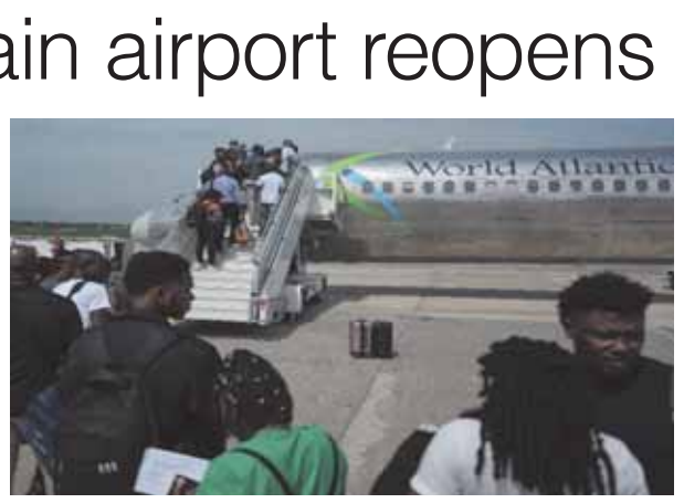
Port-au-Prince controlled by gangs that have opened fire on cars and buses passing through. The U.S. government had evacuated hundreds of citizens by helicopter out of a hilly neighborhood in Port-au-Prince, as did nonprofit organizations, as gangs laid siege to parts of the capital. The attacks began on Feb. 29, with gunmen seizing control of police stations, opening fire on the Port-au-Prince airport and storming Haiti's two biggest prisons, freeing more than 4,000 inmates. Gangs since then have directed their attacks on previously peaceful communities, leaving thousands homeless. More than 2,500 people have been killed or injured in Haiti from January to March, a more than 50% increase compared to the same period last year, according to the United Nations. At the Couronne Bar near the sole airport gate operating on Monday, 43-year-old manager Klav-Dja Raphael welcomed her first clients. But her smile belied her fear. "We are scared because they can still attack us here," she said. "We must come in. It's our job, but we're afraid."

Port-au-Prince controlled by gangs that have opened fire on cars and buses passing through. The U.S. government had evacuated hundreds of citizens by helicopter out of a hilly neighborhood in Port-au-Prince, as did nonprofit organizations, as gangs laid siege to parts of the capital. The attacks began on Feb. 29, with gunmen seizing control of police stations, opening fire on the Port-au-Prince airport and storming Haiti's two biggest prisons, freeing more than 4,000 inmates. Gangs since then have directed their attacks on previously