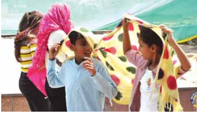
Delhiites use scarves to shield themselves from the hot summer

The prevailing heatwave conditions and high humidity levels in the national Capital, giving a feel of temperatures hovering over 50 degrees Celsius, have not only pushed the peak power demand to an all-time high of 7,717 MW on Tuesday afternoon, but have also forced political parties to hold rallies in the evening to avoid the heat.