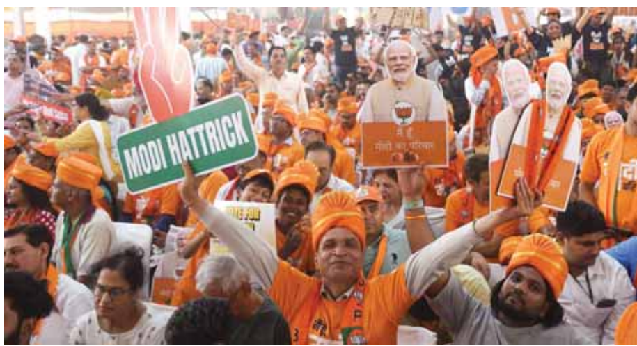
Delihites throng Dwarka sector 14 to welcome Prime Minister Narendra Modi on Wednesday

Modi denounced the communal and casteist agendas of the INDIA Bloc, accusing them of prioritising vote-bank politics over the welfare of the nation. He criticised their divisive tactics and highlighted instances of communal violence and corruption under their rule. "The country also understands