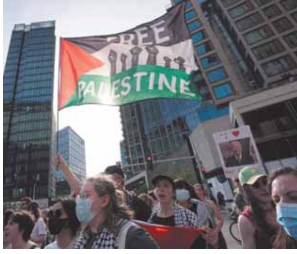
Demonstrators display Palestinian flags and chant slogans while marching Tuesday in Boston.

With their formal recognition, planned for May 28, the three countries will join some 140 — more than two-thirds of the United Nations — that