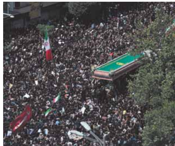
Iransians follow a truck carrying coffins of the late President Ebrahim Raisi and his companions who were killed in a helicopter crash on Sunday in a mountainous region of the country's northwest, during a funeral ceremony for them in Tehran, Iran, Wednesday.

Iran's Shiite theocracy views mass demonstrations as crucial evidence of its legitimacy and the people's support. Still, Wednesday's funeral service for President Ebrahim Raisi and others saw a turnout that onlookers described as noticeably lower than the 2020 procession honouring Revolutionary Guard general Qassem Soleimani, who was killed in a US drone strike in Baghdad. Many of the participants said they came to Tehran for the ceremony from other cities and towns across the Islamic Republic, an indication of how those in Iran's capital viewed Raisi, who won the presidency in a record low turnout and later oversaw repeated crackdowns on all dissent — including in the