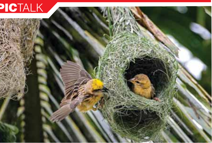
Weaver birds build a nest on a tree, in Nadia.