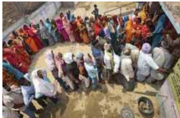
vote in West Bengal.

Similarly, in Jharkhand, the male turnout was registered at 58.08 per cent, while the female turnout was 68.65 per cent. A maximum of 38.22 per cent of voters registered in the third gender category turned out to