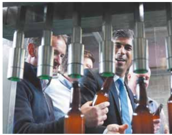
Britain's Prime Minister Rishi Sunak, centre, watch beer being bottled at the Vale of Glamorgan Brewery, in Barry, south Wales, while on the General Election campaign trail, Thursday.