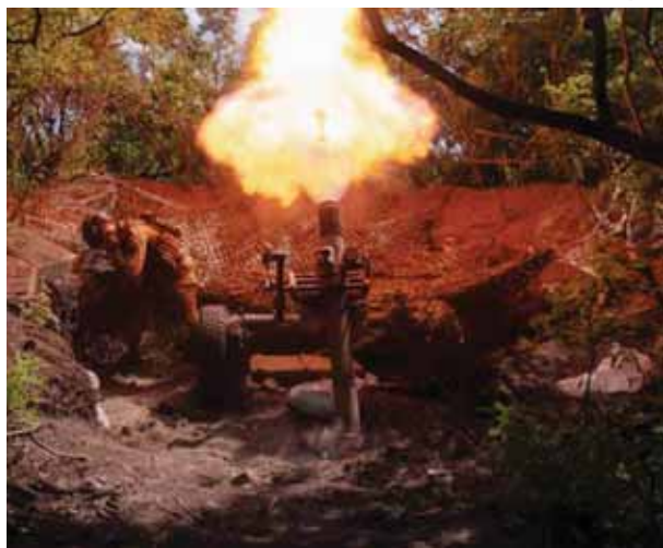
Servicemen of Ukraine's 93rd Mechanised Brigade fire a French MO-120-RT heavy mortar at the Russian forces on the front line near the city of Bakhmut in Ukraine's Donetsk region on Wednesday.

The city of Kharkiv, which is the capital of the region of the same