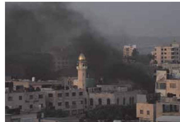
Black smokes rise to the sky during clashes between Israeli forces and Palestinian demonstrators in the West Bank city of Jenin, Wednesday.