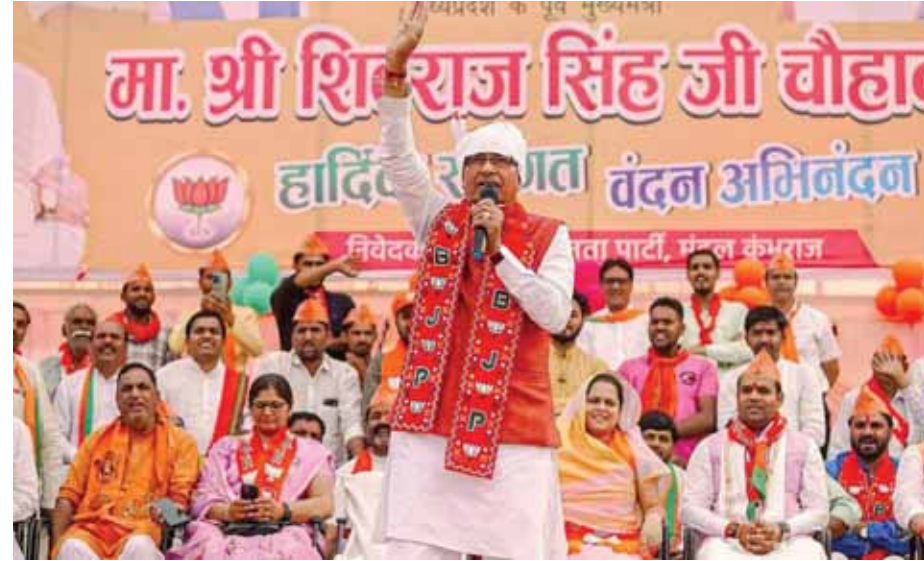
tight slap on Banerjee's vote bank politics," he told a press conference at the party headquarters here.

The former Madhya Pradesh chief minister alleged after coming at the helm in West Bengal, Banerjee pursued vote bank politics and gave OBC certificates to a number of castes and the beneficiaries included Muslims, Bangladeshis and Rohingyas. "The Calcutta High Court's decision in the matter that came on Wednesday was a