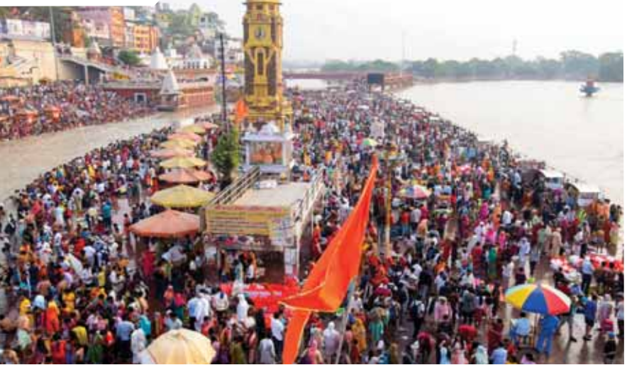
Devotees at Har Ki Pauri on the occasion of Buddha Purnima, in Haridwar