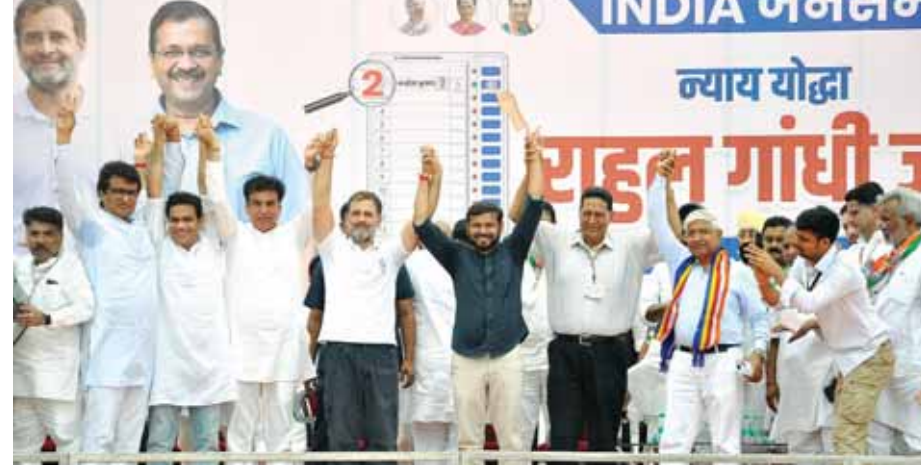
Congress leader Rahul Gandhi with party leader and INDIA Bloc Lok Sabha candidate from North East Delhi constituency Kanhaiya Kumar during a public meeting at Dilshad Garden in New Delhi on Thursday

Just days before the Lok Sabha elections in Delhi, Congress leader Rahul Gandhi rode the Delhi Metro on Thursday to connect with voters. Congress candidate from North East Delhi, Kanhaiya Kumar, shared photos of Rahul interacting and posing with passengers. En route to a rally in Mangolpuri with Kumar on the last day of campaigning, Rahul engaged with commuters. Delhi will vote on May 25 under Phase VI.