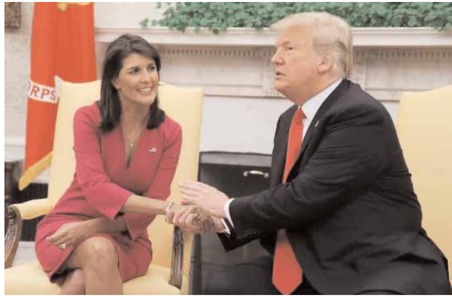
Nikki Haley and Donald Trump in the Oval Office in 2018.

no more excuses; a president who would support capitalism and freedom; a president who understands we need less debt, not more debt," she said. "Trump has not been perfect on these policies. I've made that clear many, many times. But (Joe) Biden has been a catastrophe. So, I will be voting for Trump. Having said that... I stand by what I said in my suspension speech," she said. Haley was born Nimarata Nikki Randhawa in Bamberg, South Carolina, to immigrant Sikh parents from Amritsar, Punjab. Haley is the first Indian-American to serve in a presidential cabinet. Haley said she has "no regrets" about her Republican primary bid. "We left it all on the field." She also thanked the primary voters who have continued to back her even after she withdrew from the race — a potential warning sign for Trump. And she reiterated the call she'd made when exiting the race in March for the former president to reach out to those voters. "Trump would be smart to