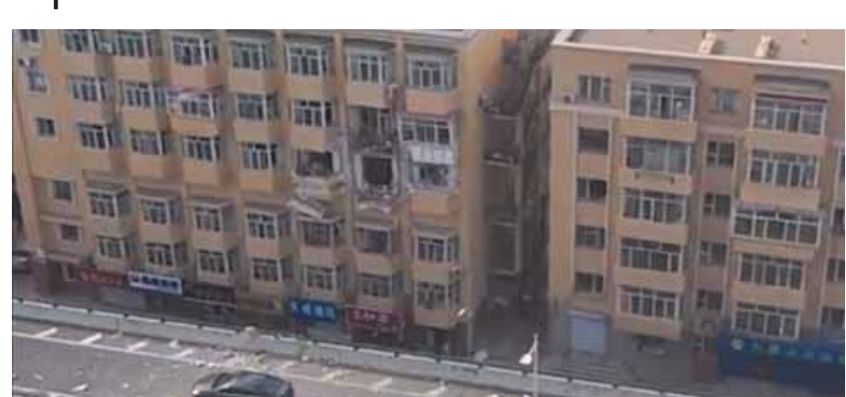
least one person being carted away by first responders into an ambulance, and the streets

Beijing (AP): An explosion at an apartment building in northeastern China killed one person and injured at least three others Thursday, state media reported. Parts of the five-story apartment building in Harbin were damaged, with one apartment's balcony completely blown off, videos on social media showed. Officials told local media that the explosion was likely from a natural gas tank. One woman died of her injuries, according to Jimu News, a state-backed media outlet. The three others were taken to the hospital for their injuries. Videos online also showed at