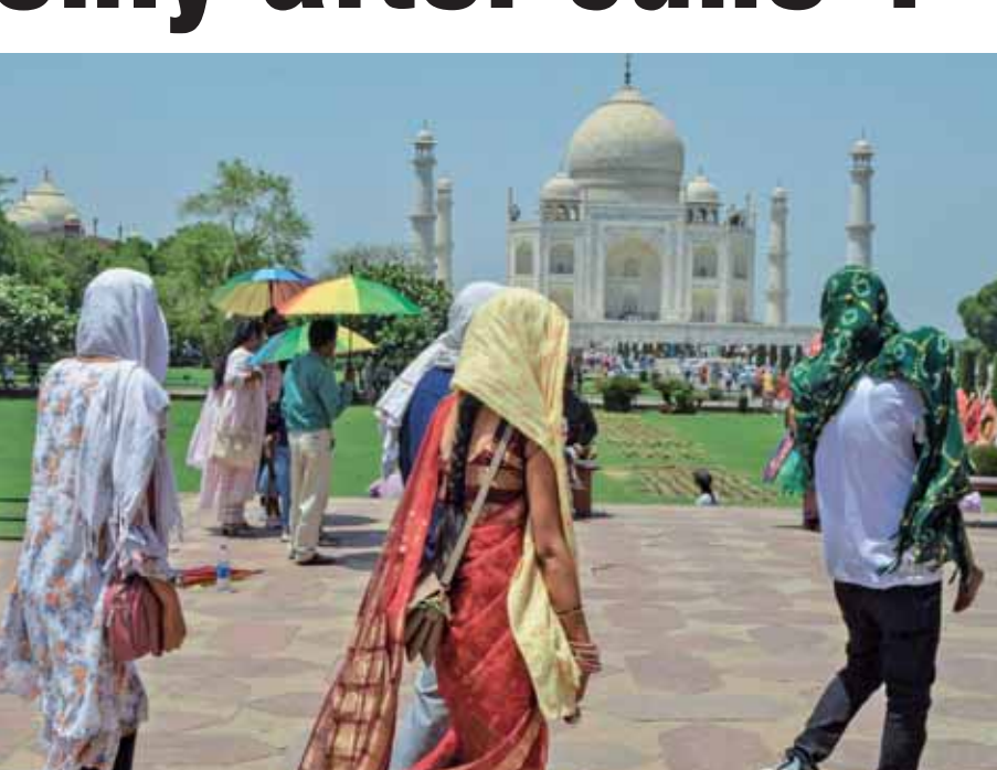
Tourists at the Taj Mahal on a hot summer day in Agra

Relief from the blistering weather is anticipated from June 1, thanks to a fresh disturbance, western according to forecasts by the