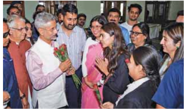
External Affairs Minister S. Jaishankar during a discussion on 'Viksit Bharat @2047', in Shimla, Tuesday

China is constructing roads, bridges and model village at the border on the land it took in 1962 and had made a road to Siachen with the coordination of Pakistan and India has also deployed forces,