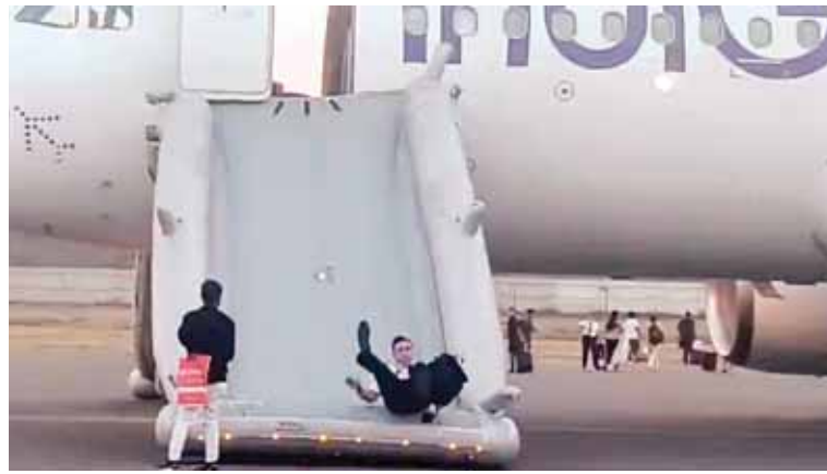
A pilot slides down from the Varanasi-bound IndiGo flight that received a bomb threat at the Indira Gandhi International Airport, in New Delhi on Tuesday

Dramatic scenes unfolded at the Indira Gandhi International Airport as the 176 passengers onboard the IndiGo flight were evacuated via the emergency exits following the bomb threat.