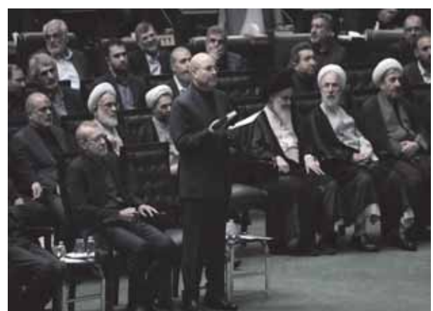
Mohammad Bagher Qalibaf, center, takes an oath during the opening ceremony of the new parliament term in Tehran, Iran.

Iran's parliament re-elected hard-liner Mohammad Bagher Qalibaf on Tuesday as its speaker, reaffirming its hard-right makeup in the wake of a helicopter crash that killed the country's president and foreign minister. Of 287 lawmakers voting, 198 backed Qalibaf to retain the position he first took in 2021. He initially became speaker following a string of failed presidential bids and 12 years as the leader of Iran's capital city, in which he built onto Tehran's subway and supported the construction of modern high-rises. Many, however, know Qalibaf for his support, as a Revolutionary Guard general, for a violent crackdown on Iranian university students in 1999. He also reportedly ordered live gunfire to be used against Iranian students in 2003 while serving as the country's police chief. In Tuesday's