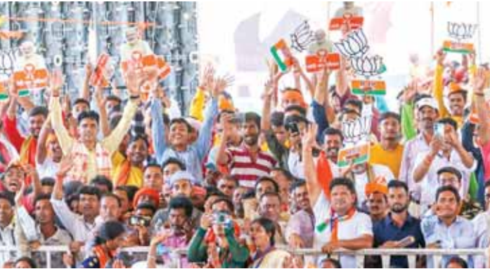
BJP supporters during Prime Minister Narendra Modi's public meeting for Lok Sabha elections, in Dumka district, on Tuesday

was decreasing in the Santhal Parganas because of infiltration and accused the JMM-led ruling alliance in Jharkhand of "patronising" infiltrators, who he said were grabbing land and putting women at risk.