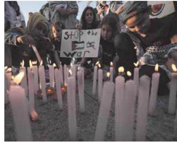
Children light candles during a march against Israel and in solidarity with Palestinians in the southern Gaza city of Rafah, on the Mediterranean Sea corniche in Beirut, Lebanon, Monday. Israeli Prime Minister Benjamin Netanyahu acknowledged Monday that a "tragic mistake" had been made after an Israeli strike in the southern Gaza city of Rafah set fire to a tent camp housing displaced Palestinians and killed at least 45 people, according to local officials.

Palestinian health officials say at least 45 people, around half of them women and children, were killed in Sunday's strike. The fire also could have ignited fuel, cooking gas canisters or other materials in the densely populated camp housing displaced people.