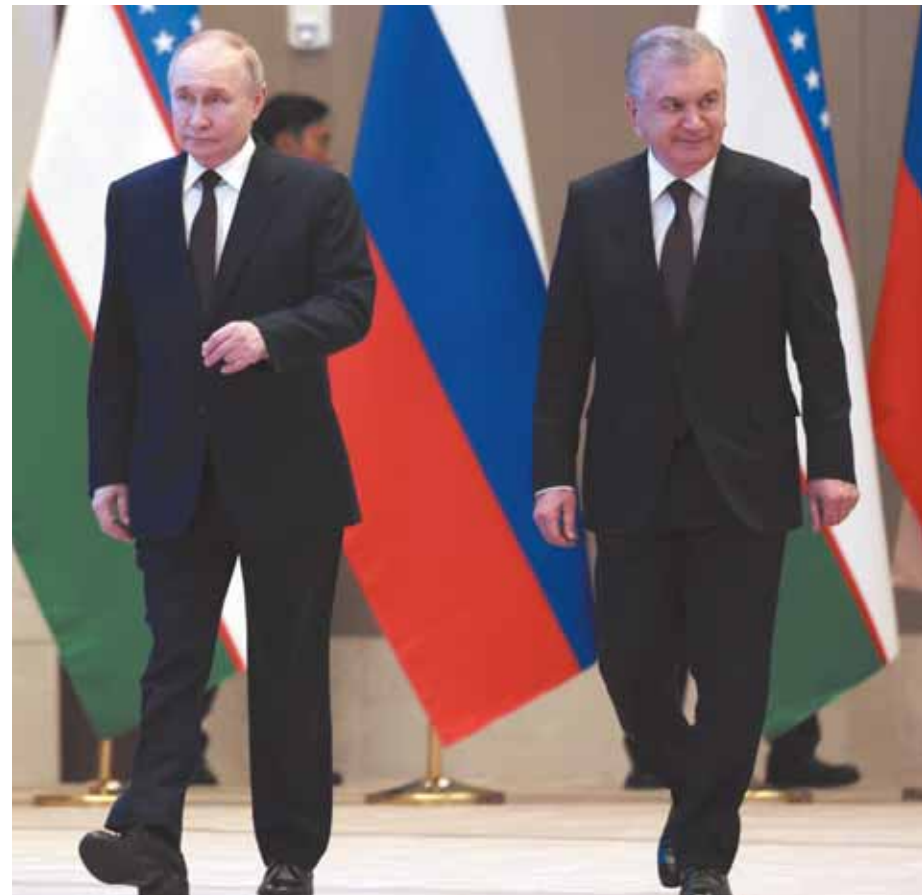
Russian President Vladimir Putin, left, and Uzbek President Shavkat Mirziyoyev arrive to attend a meeting of the Council of Regions of Uzbekistan and Russia in Tashkent, Uzbekistan, Monday.

Much before that, in 2017, Nawaz had stepped down as the country's prime minister after the Supreme Court disqualified him for life from holding public office for not declaring a receivable salary. Following his trial in the Panama Papers case, the apex court, in February 2018, disqualified the PML-N supremo as the party's president.