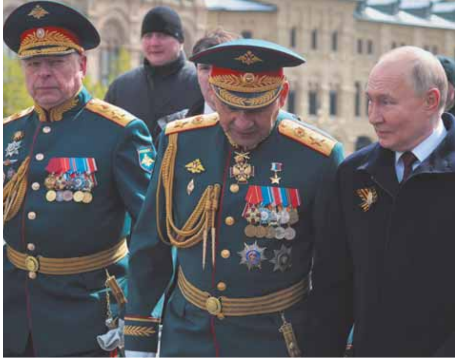
Commander-in-Chief of the Russian Ground Forces Oleg Salyukov, left, Russian Defense Minister Sergei Shoigu, centre, and Russian President Vladimir Putin leave Red Square...