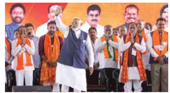
Prime Minister Narendra Modi during a public meeting for Lok Sabha elections, in Hyderabad, on Friday