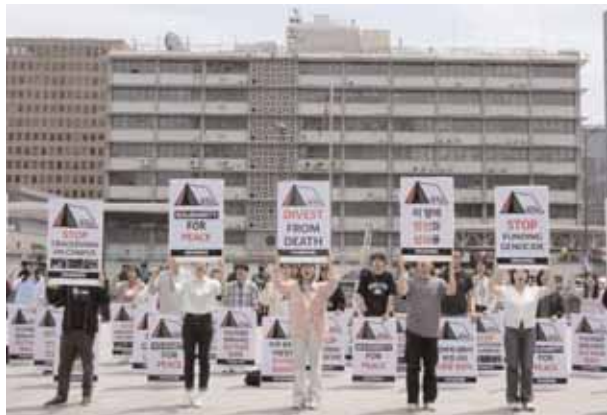
University students supporting Palestinian people stage a rally to demand a stop to the crackdown on demonstrators at rallies for Palestinians on the campus of U.S. universities, near the U.S. Embassy in Seoul, South Korea, Friday.

launched punishing assaults. Over a million Palestinians have fled to Rafah to escape fighting elsewhere, with many packed into UN-run shelters or squalid tent camps. The city on the border with Egypt is also a crucial hub for bringing in food, medicine, fuel and other goods. The UN's Office for the Coordination of Humanitarian Affairs, known as OCHA, says about 110,000 people have fled Rafah and that food and fuel supplies in the city are critically low. Georgios Petropoulos, an OCHA official working in Rafah, said the two main crossings near the city remain closed, cutting off supplies and preventing medical evacuations and the movement of humanitarian staff. "Even if there were assurances to us being able to pass through a corridor, the proximity so close to a military involved in fighting is just not acceptable for something that has to be a humanitarian zone," he said. The UN's World Food