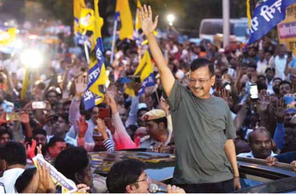
Delhi Chief Minister Arvind Kejriwal addresses supporters after coming out of Tihar Jail as the Supreme Court (SC) granted him interim bail in a money laundering case, amid the ongoing Lok Sabha elections, in New Delhi, on Friday

In a major relief to embattled Aam Aadmi Party (AAP) convenor and Delhi Chief Minister Arvind Kejriwal, the SC on Friday granted him interim bail in a money laundering case at the peak of the election season but barred him from visiting his office or the Delhi Secretariat and signing official files unless absolutely necessary for obtaining the Lieutenant Governor's approval. He has been asked to surrender to the prison authorities by June 2. June 1 is the last day of the seven-phase elections. The votes will be counted on June 4.