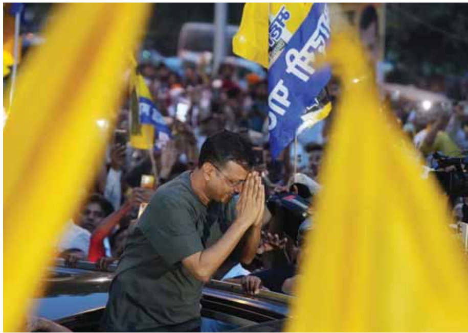
Delhi Chief Minister Arvind Kejriwal comes out of Tihar jail on Friday

Workers and leaders of his Aam Aadmi Party (AAP) had gathered outside the prison complex to welcome him. Kejriwal left from Tihar in his convoy. Clad in yellow T-shirts, AAP supporters danced to dhol beats and fed each other sweets at the party office here on Friday as they celebrated the