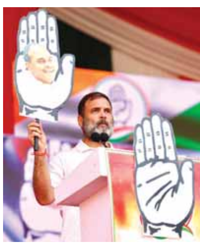
Congress leader Rahul Gandhi addressing an election rally in Andhra Pradesh on Saturday canvassing for Kadapa candidate Sharmila YSR, daughter of former Chief Minister late Y Rajashekhar Reddy

Lauding the initiative for a public debate on the Lok Sabha elections, former Congress president Rahul Gandhi on Saturday said he or party chief Mallikarjun Kharge would be pleased to participate in such a discussion and expressed hope that Prime Minister Narendra Modi would also take part. "It would be a positive initiative for the major parties to present their vision to the country from one platform for a healthy democracy," Rahul said in a social media post. He also added that the nation expects Modi to participate in the debate. There is yet any response on the subject from the BJP. The Congress leader shared on social media his reply to Justice (Retd) Madan B Lokur, Justice (Retd) Ajit P Shah and N Ram, who had written to him and the prime minister earlier this week, inviting them to a platform for a debate on the key election issues. In their letter addressed to the