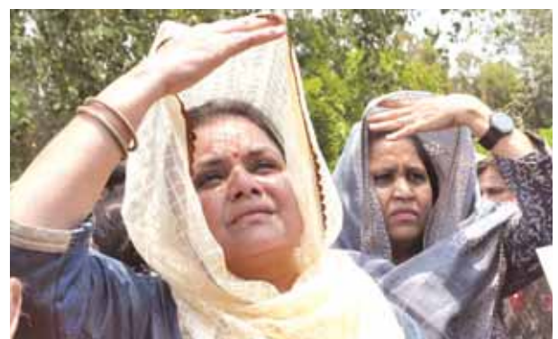
People use scarfs to shield themselves from the hot summer sun.

On the day the people of 58 parliamentary constituencies in six States and two Union Territories, including Delhi, Haryana, and Uttar Pradesh, go to the polls for the sixth phase of the 2024 Lok Sabha elections, the hottest nine days of the year, also known as Nautapa, will begin. Nautapa, which will continue until June 2, is also considered the birth time of the southwest monsoon. During Nautapa, the Sun is closest to the Earth, resulting in intense heat. The maximum temperature is expected to range from 42 degrees Celsius to 45 degrees Celsius, which may feel like 50