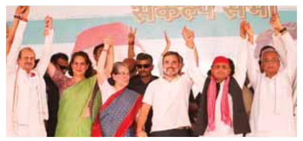
Congress leader and party candidate from Rae Bareilly constituency Rahul Gandhi with party leaders Sonia Gandhi and Priyanka Gandhi, Samajwadi Party (SP) chief and party candidate from Kanpur constituency Akhilesh Yadav, former Chhattisgarh Chief Minister Bhupesh Baghel and others during a public meeting for the Lok Sabha elections, in Rae Bareilly district, on Friday.