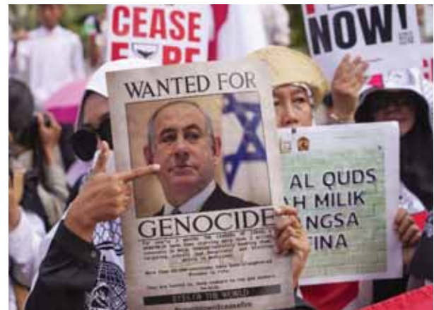
A protester holds a poster of Israeli Prime Minister Benjamin Netanyahu during a rally commemorating the 76th anniversary of the mass expulsion of the Palestinians from what is now Israel in 1948, often called the "Nakba" or Arabic for catastrophe, outside the U.S. Embassy in Jakarta, Indonesia on Friday.

Israel strongly denied charges of genocide on Friday, telling the United Nations' top court it was doing everything it could to protect the civilian population during its military operation in Gaza. The International Court of Justice wrapped up a third round of hearings on emergency measures requested by South Africa, which says Israel's military incursion in the southern city of Rafah threatens the "very survival of Palestinians in Gaza" and has asked the court to order a cease-fire. Tamar Kaplan-Tourgeman, one of Israel's legal team, defended the country's conduct, saying it had allowed in fuel and medication to the beleaguered enclave. "Israel takes extraordinary measures in order to minimize the harm to civilians in Gaza," she told The Hague-based court. A protester shouting "Liars" briefly interrupted Kaplan-