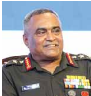
General Pandey said, "The project 'Udbhav', launched last year, delved deep into ancient texts such as Vedas, Puranas, Upanishads and Arthashastra, and it has

In an effort to highlight India's rich heritage in statecraft, the Army has explored the epic battles of the Mahabharata, heroic exploits of eminent military figures as part of a project that aims to enrich the nation's outlook in the defence domain, Army Chief General Manoj Pandey said on Tuesday.