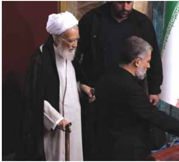
Ayatollah Mohammad Ali Mowahedi Kermani arrives to attend the first session of Assembly of Experts after an election that decided the new assembly, in Tehran, Iran, Tuesday. Under Iranian constitution the 86-member all-cleric assembly has the right to monitor the performance of supreme leader, and choosing or dismissing him. Mowahedi Kermani was picked Tuesday as head of the assembly.