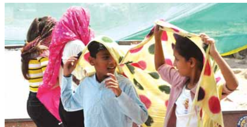
Delhiites use scarves to shield themselves from the hot summer