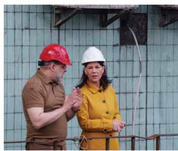
Germany's Foreign Minister Annalena Baerbock speaks to Ukrainian Energy Minister Herman Halushchenko during official visit to a thermal power plant which was destroyed by a Russian rocket attack in Ukraine, Tuesday.

AP ■ KYIV Germany's foreign minister arrived in Kyiv on Tuesday in the latest public display of support for Ukraine by its Western partners, although deliveries of promised weapons and ammunition from NATO countries like Germany have been slow and have left Ukraine vulnerable to a recent Russian push along parts of the front line. Annalena Baerbock renewed Berlin's calls for partners to send more air defense systems, as Russia pounds Ukraine with missiles, glide bombs and rockets. Germany is the second-biggest supplier of military aid to Ukraine after the United States. Ukraine's depleted troops are trying to hold off a fierce Russian offensive along the eastern border in one of the most critical phases of the war, which is stretching into its third year. Germany recently pledged a third US-made Patriot battery for Ukraine, but Kyiv officials say they are still facing an alarming shortfall of air defenses against the Russian onslaught. The Kremlin's forces have used their advantage in the skies to debilitate Ukraine's power grid, hoping to sap Ukrainian morale