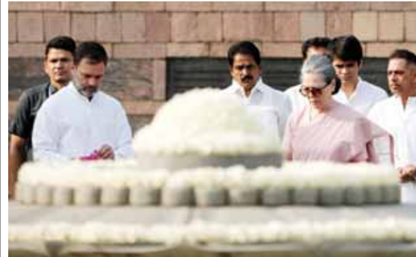
Congress leaders Sonia Gandhi and Rahul Gandhi pay tributes to former Prime Minister Rajiv Gandhi on his death anniversary at Veer Bhumi, in New Delhi, on Tuesday

PIONEER NEWS SERVICE ■ NEW DELHI Prime Minister Narendra Modi on Tuesday paid tributes to former Prime Minister Rajiv Gandhi on his death anniversary. India's Prime Minister between 1984 and