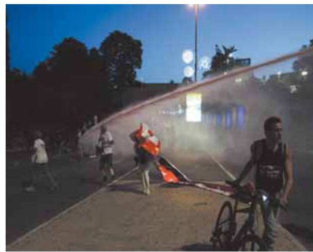
Police use water cannon to disperse demonstrators blocking a road during a protest against Israeli Prime Minister Benjamin Netanyahu's government, and calling for the release of hostages held in the Gaza Strip by the Hamas militant group, outside the Knesset, Israel's parliament in Jerusalem on Monday.

While no one faces imminent arrest, the announcement deepens Israel's global isolation at a time when it is facing