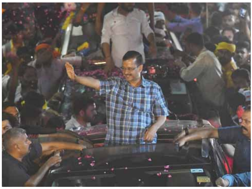
Delhi Chief Minister Arvind Kejriwal during a roadshow for Congress and joint INDIA Bloc candidate from North East Delhi, Kanhaiya Kumar