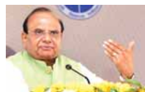
STAFF REPORTER ■ NEW DELHI

Delhi Lieutenant Governor Vinai Kumar Saxena has for the first time reacted to the alleged assault on AAP leader and Rajya Sabha MP Swati Maliwal on Tuesday, sharing that Maliwal called him a day earlier on Monday out of "sheer anguish".