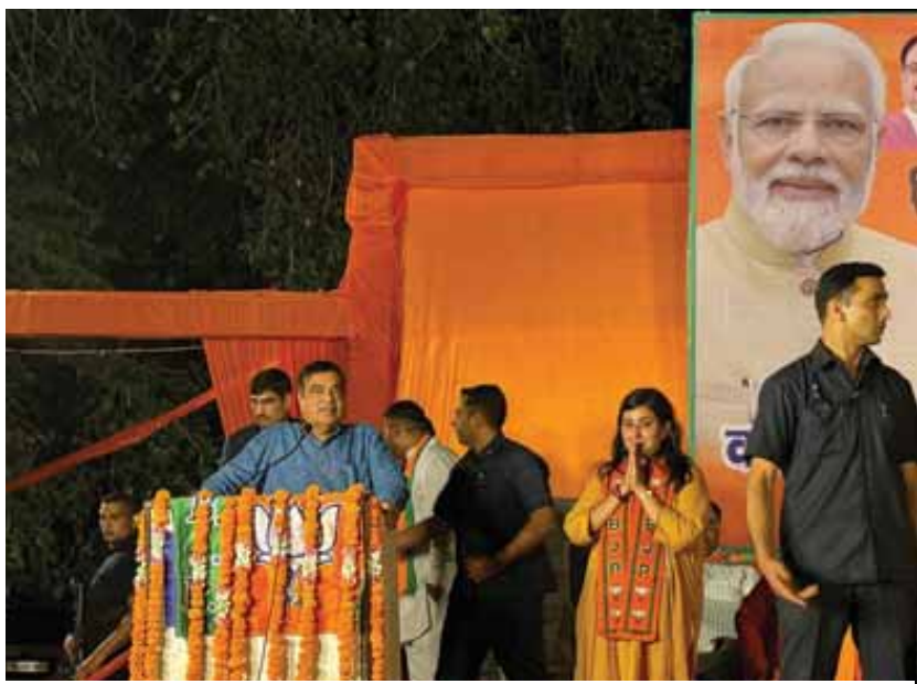
Union Minister Nitin Gadkari addresses public to seek votes for New Delhi candidate Bansuri Swaraj