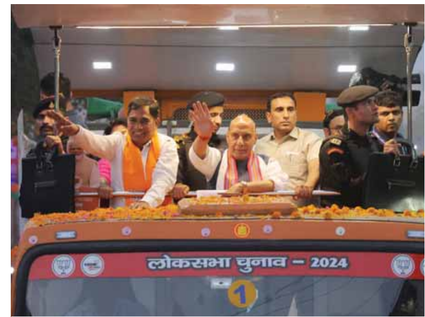
Defence Minister Rajnath Singh at a roadshow in support of northwest Delhi candidate Yogendra Chandolia