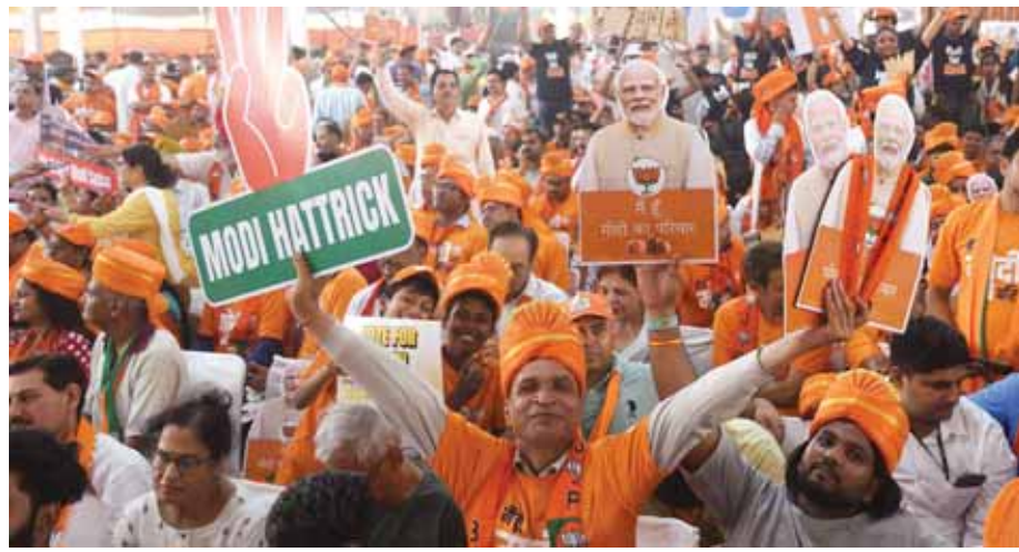
Delhiites throng Dwarka sector 14 to welcome Prime Minister Narendra Modi on Wednesday

Modi denounced the communal and casteist agendas of the INDIA Bloc, accusing them of prioritising vote-bank politics over the welfare of the nation. He criticised their divisive tactics and highlighted instances of communal violence and corruption under their rule. "The country also understands