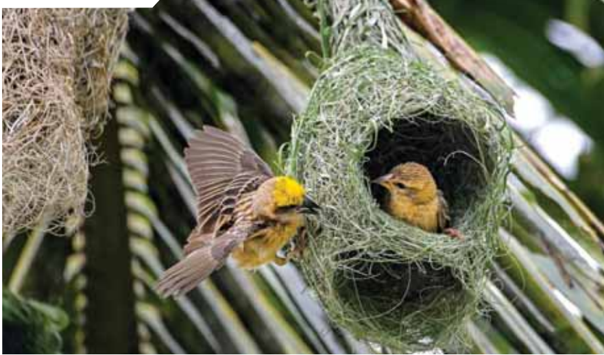
Weaver birds build a nest on a tree, in Nadia