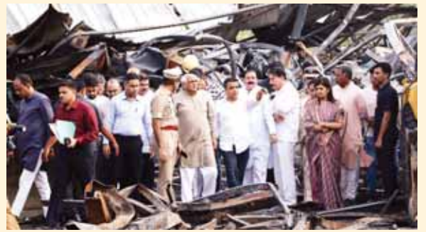
Gujarat Chief Minister Bhupendra Patel with officials and others at the game zone site where a major fire on Saturday evening killed at least 27 people and injured three, in Rajkot, on Sunday