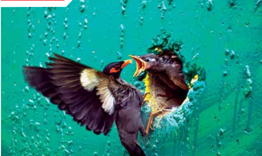
A myna feeds its chicks, in Moradabad district