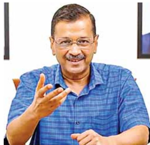
Chief Minister Arvind Kejriwal said the East Delhi children hospital fire which left seven newborns dead is heart-rending and warned that those responsible for negligence will not be spared. In a post on X, he said the Government stood with those who lost their children in the fire incident in Vivek Vihar, and added the administration was ensuring proper treatment to the injured.