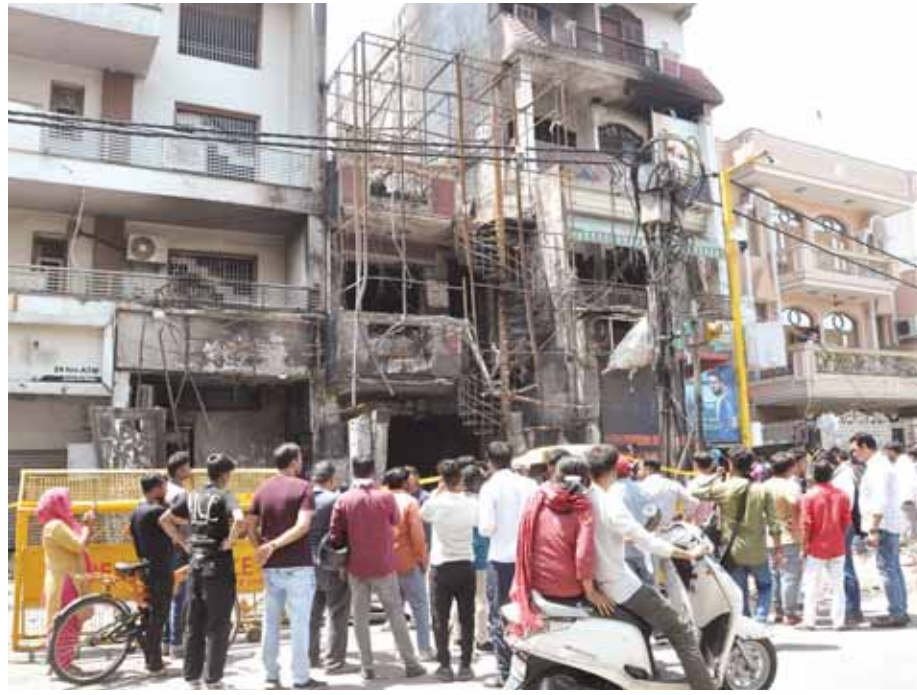
Commuters pass by a children's hospital where a fire broke out on Saturday night at Vivek Vihar area, in New Delhi, on Sunday

Two boutiques, a portion of IndusInd Bank operating from an adjacent building and a shop on the ground floor were also damaged besides an ambulance and a scooter parked outside the building. The Prime Minister's Office has announced Rs 2 lakh as compensation to the families of each of the seven victims, and Rs 50,000 for the families of the injured babies. Delhi