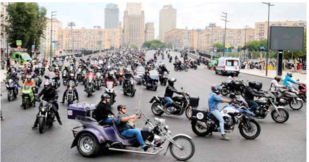
Bikers attend a motorcycle rally marking a traditional spring's motorcycle festival riding along the center of Moscow, with the famous building of Russian Foreign Ministry in the background, Russia, Sunday

Earlier, the World Food Program said the exceptionally heavy rains in Afghanistan had killed more than 300 people and destroyed thousands of houses, mostly in the northern province of Badghlan on May 10 and May 11. Survivors have been left with no home, no land, and no source of livelihood, WFP said.