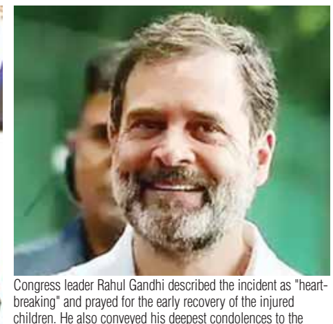
Congress leader Rahul Gandhi described the incident as "heart-breaking" and prayed for the early recovery of the injured children. He also conveyed his deepest condolences to the grieving parents of the newborn children who lost their lives in the hospital fire. "The news of the death of many newborn babies due to fire in a Baby Care Hospital in Delhi is extremely heart-breaking. My deepest condolences to all the grieving parents and relatives. I hope that the injured children recover and get well as soon as possible," he said in a post in Hindi on X.