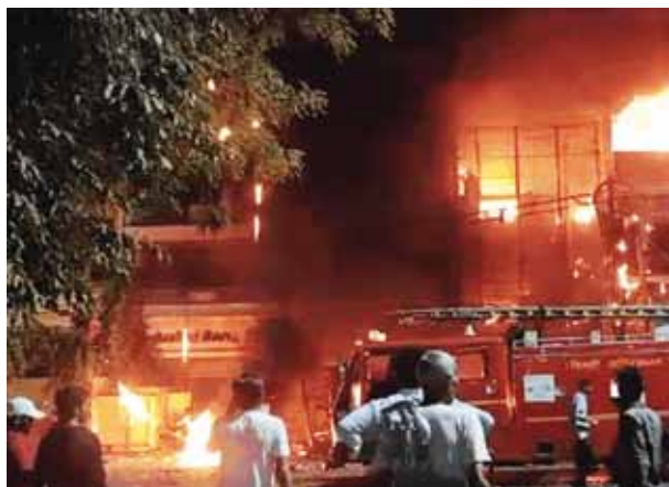
the flames." He added that people must avoid coming close to areas where a fire-fighting operation is underway to ensure that those dousing the flames can operate smoothly. The fire had spread from the hospital to a boutique and a private bank in the next building, and an eyeglass showroom and a shop selling

Firefighting personnel faced several challenges during its rescue operation after a blaze erupted at an east Delhi children's hospital that left seven newborns dead, none more so than clearing the crowd that had gathered at the spot and recording videos. Delhi Fire Services officials said a blaze broke out at the Baby Care New Born Hospital in the Vivek Vihar area around 11:30 pm on Saturday and spread to two adjacent buildings. At least 12 newborns were rescued from the facility but seven of them died. Five babies are undergoing treatment at another hospital, they said. A senior Delhi Fire Services official said, "Several people had gathered at the spot and were recording videos of the fire. Many of them even came close to those trying to douse