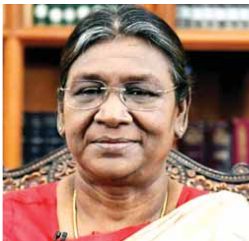
"I pray for the speedy recovery of other children injured in this incident. The news of death of many children due to fire in a hospital in Vivek Vihar, Delhi is heart-rending. May God give strength to the bereaved parents and relatives to bear this shock. I pray for the speedy recovery of other children injured in this incident," President of India Droupadi Murmu said in a post on X in Hindi.