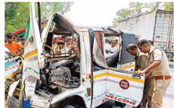
Lakhimpur Kheri: Police personnel investigate after a collision between a mini vehicle and a UP roadways bus on the Nakaha-Shankarpur highway, on Sunday