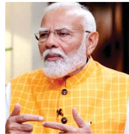
Expressing grief, Prime Minister Narendra Modi on Sunday said in a post on X, "The fire tragedy at a hospital in Delhi is heart-rending. My thoughts are with the bereaved families in this incredibly difficult time. I pray that those injured recover at the earliest."