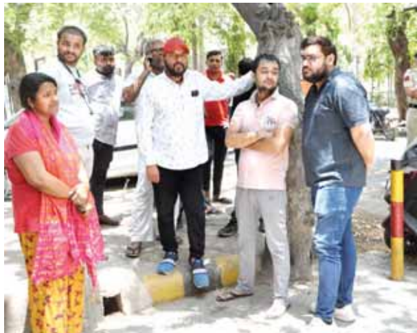
in Karkardooma. A fire broke out at Baby Care New Born Hospital around 11:30 PM on Saturday, officials of the Delhi Fire Services (DFS) said. The blaze quickly spread to two adjacent buildings, requiring 16 fire tenders. Three buildings were affected by the fire. "Allah ko pyaari ho gayi meri beti," said a father, whose 11-day-old daughter had not yet been identified. "My daughter was born on May 15 at another hospital. They asked us to keep her in the childcare hospital for 72 hours for observation. After that, we admitted her to the childcare hospital, where she had been for the last 10 days," he said. "My friends called and told me that there was a blast at the childcare hospital in Delhi where my daughter was. When I found out and came here, I learned that my daughter had passed away," he said. Meanwhile, three families among the six of them have