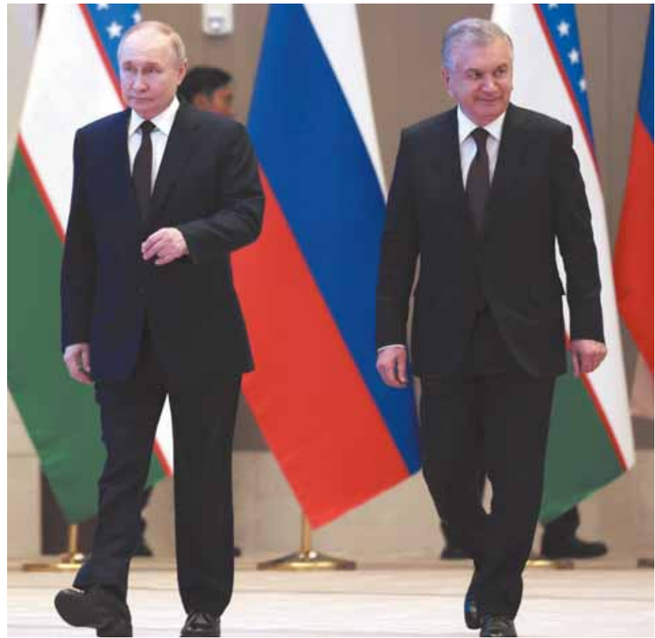
Russian President Vladimir Putin, left, and Uzbek President Shavkat Mirziyoyev arrive to attend a meeting of the Council of Regions of Uzbekistan and Russia in Tashkent, Uzbekistan, Monday.

Much before that, in 2017, Nawaz had stepped down as the country's prime minister after the Supreme Court disqualified him for life from holding public office for not declaring a receivable salary. Following his trial in the Panama Papers case, the apex court, in February 2018, disqualified the PML-N supremo as the party's president.