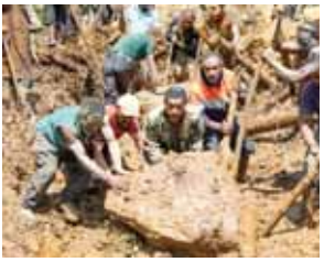
injured. India is ready to offer all possible support and assistance," the Prime Minister posted on X. According to the Papua New Guinea Government, more than 2,000 people are believed to have been buried alive in a landslide in the South Pacific island nation.

'Deeply saddened by the loss of lives and damage caused by the devastating landslide in Papua New Guinea. Our heartfelt condolences to the affected families and prayers for speedy recovery of the