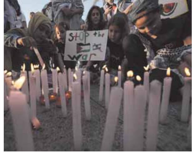
Children light candles during a march against Israel and in solidarity with Palestinians in the southern Gaza city of Rafah, on the Mediterranean Sea corniche in Beirut, Lebanon, Monday. Israeli Prime Minister Benjamin Netanyahu acknowledged Monday that a "tragic mistake" had been made after an Israeli strike in the southern Gaza city of Rafah set fire to a tent camp housing displaced Palestinians and killed at least 45 people, according to local officials.

The Israeli military says an initial investigation into a strike that sparked a deadly weekend fire in a tent camp in the southern Gaza city of Rafah has found the blaze was caused by a secondary explosion. Rear Adm Daniel Hagari, the chief military spokesman, said Tuesday that the military fired two 17-kg (37-pound) munitions that targeted two senior Hamas militants. He said the munitions would have been too small to ignite a fire on their own and the military is looking into the possibility that weapons were stored in the area. Palestinian health officials say at least 45 people, around half of them women and children, were killed in Sunday's strike. The fire also could have ignited fuel, cooking gas canisters or other materials in the densely populated camp housing displaced people.