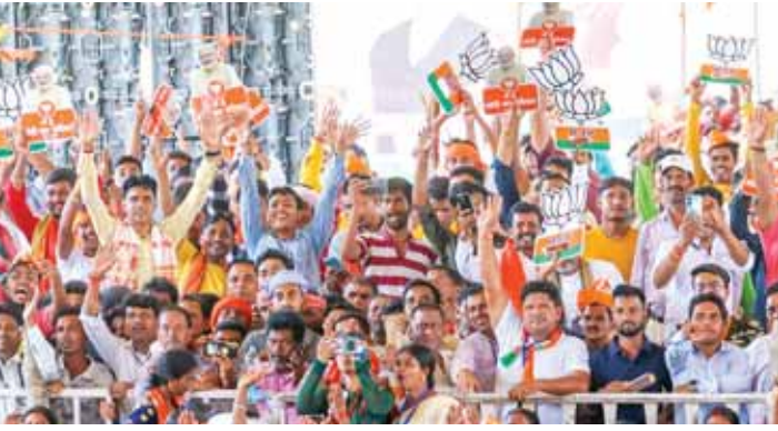
BJP supporters during Prime Minister Narendra Modi's public meeting for Lok Sabha elections, in Dumka district, on Tuesday