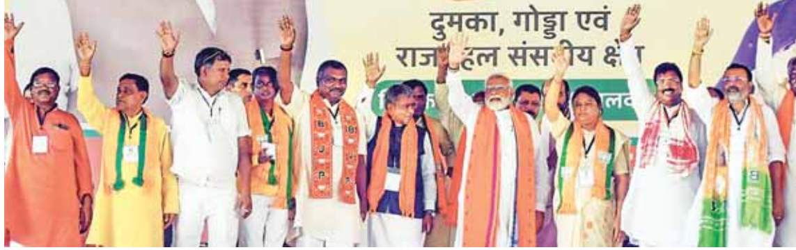
Prime Minister Narendra Modi during a public meeting for Lok Sabha elections in Dumka district

"love jihad" emanated from Jharkhand. The people of Jharkhand have coined this term," he said. Accusing the JMM of indulging in "communal and appeasement politics," he said that despite Sunday being a holiday since the British era, in one Jharkhand district, it was changed to Friday.