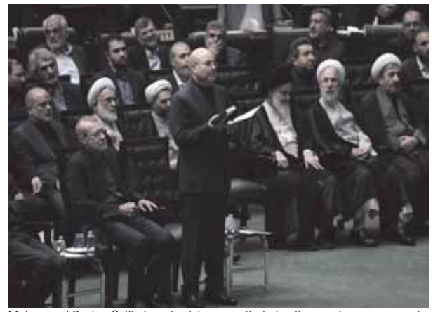
Mohammad Bagher Qalibaf, center, takes an oath during the opening ceremony of the new parliament term in Tehran, Iran.

Iran's parliament re-elected hard-liner Mohammad Bagher Qalibaf on Tuesday as its speaker, reaffirming its hard-right makeup in the wake of a helicopter crash that killed the country's president and foreign minister. Of 287 lawmakers voting, 198 backed Qalibaf to retain the position he first took in 2021. He initially became speaker following a string of failed presidential bids and 12 years as the leader of Iran's capital city, in which he built onto Tehran's subway and supported the construction of modern high-rises. Many, however, know Qalibaf for his support, as a Revolutionary Guard general, for a violent crackdown on Iranian university students in 1999. He also reportedly ordered live gunfire to be used against Iranian students in 2003 while serving as the country's police chief. In Tuesday's