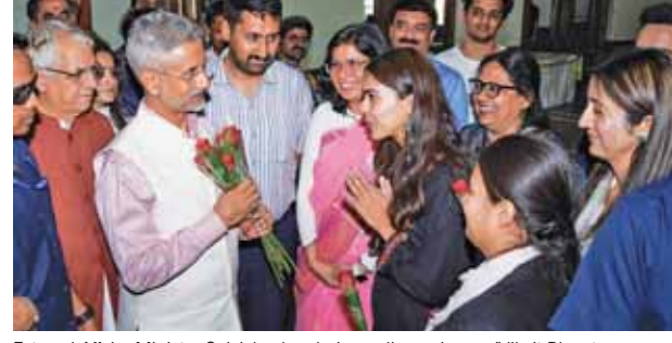
External Affairs Minister S Jaishankar during a discussion on Viksit Bharat @2047, in Shimla, on Tuesday

"I see four-five years of difficult times ahead and the electorates should wisely vote as similar conflicts could happen on our borders," he told the media persons. China is constructing roads, bridges and model village at the border on the land it took in 1962 and had made a road to Siachen with the coordination of Pakistan and India has also deployed