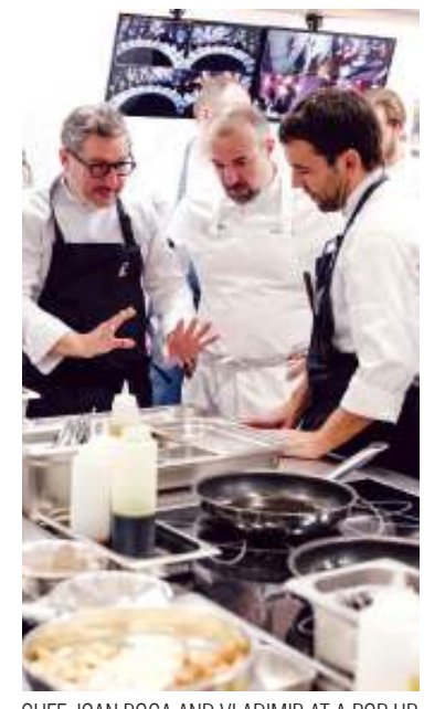
CHEF JOAN ROCA AND VLADIMIR AT A POP UP COLLABORATION IN KRASOTA, DUBAI