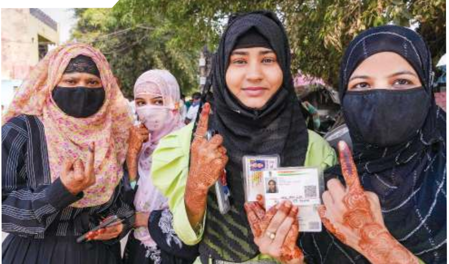
Women show their ink-marked finger after casting votes for the 3rd phase of Lok Sabha elections, in Bareilly.