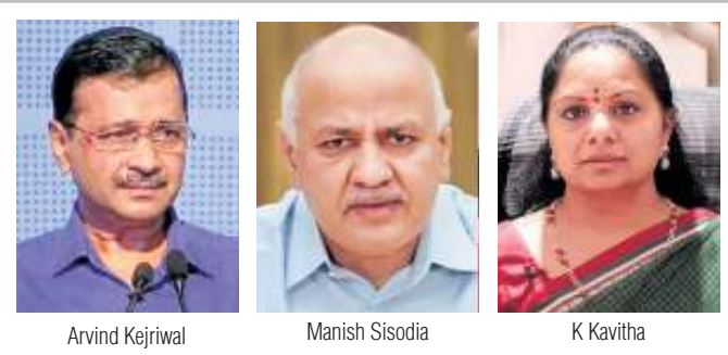
Arvind Kejriwal Manish Sisodia K Kavitha