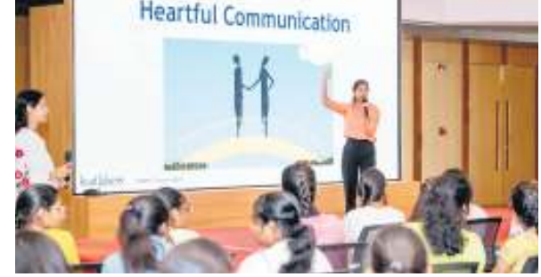
Heartfulness cleansing workshop