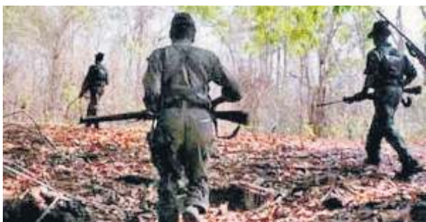
They have been charged under the Indian Penal Code, Unlawful Activities (Prevention) Act and the Explosive Substances Act, the National Investigation Agency (NIA) said in a statement

The National Investigation Agency on Tuesday charge-sheeted three members of the CPI (Maoist) for allegedly supplying explosives and other items to the banned outfit for attacking and spying on security forces, according to an official statement.