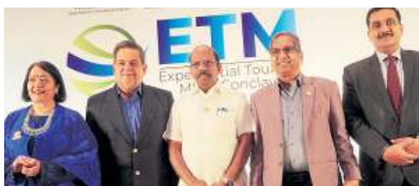
Representatives of the FTCCI and ETM at the curtain raiser event in Hyd on Saturday

The first Experiential Tourism (ETM) conclave will be held in Hyderabad from July 27-30. The Conclave will be organised under the aegis of the Government of Telangana and Telangana Tourism. The Tourism Committee of FTCCI is collaborating with iCONEX, a new Delhi-based international conferences and exhibitions organiser.