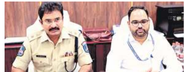
Ranga Reddy Collector K Shashanka addressing a press conference in Ranga Reddy on Saturday

Shashanka said that voters can use any one of the 13 types of identity cards prescribed by the Election Commission, even if they don't have a voter card. Polling will take place from 7.00 am to 6.00 pm, with an extension of one hour beyond the usual closing time. He emphasized the importance of