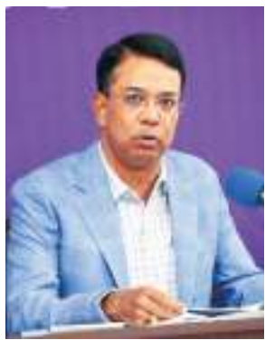
voters of a particular age group to participate in voting.

On Saturday he held a press conference in BRK Bhavan in Hyderabad. He said that the Election Commission of India has identified 9,900 critical polling stations in the state. The ECI has received 92 complaints from the political parties in the state and it issued notices to them. Those who received notices should reply to the ECI within 14 days. For the first time, the ECI was sending SMS directly to the