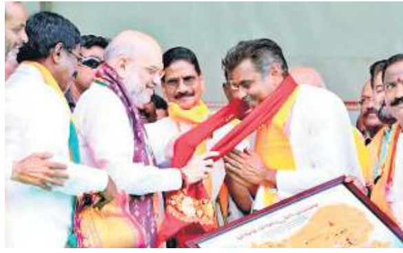
Union Home Minister Amit Shah greeting Chevella Lok Sabha BJP candidate Konda Vishweshwar Reddy in Vikarabad on Saturday

Amit Shah accused the INDIA bloc of failing to nominate a consensus candidate for the prime minister's post,