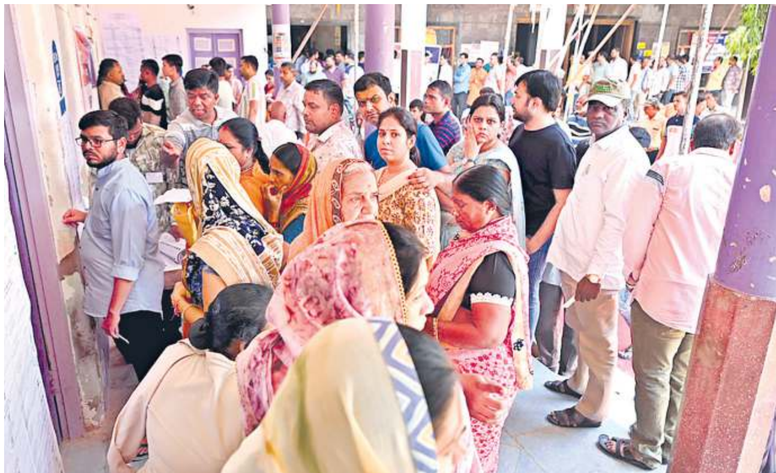
Telangana voters eagerly casting their votes on Monday in Lok Sabha elections