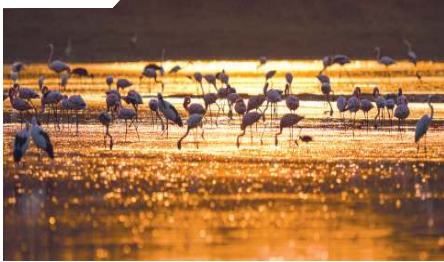
Flamingoes at the Thol Bird Sanctuary in Mehsana district