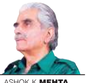
ASHOK K MEHTA

Amid strained India-Nepal relations, speculation swirls around a potential regime change in Nepal