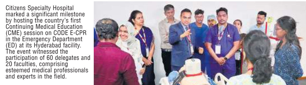
Citizens Specialty Hospital marked a significant milestone by hosting the country's first Continuing Medical Education (CME) session on CODE E-CPR in the Emergency Department (ED) at its Hyderabad facility. The event witnessed the participation of 60 delegates and 20 faculties, comprising esteemed medical professionals and experts in the field.