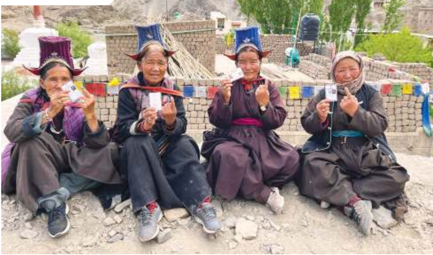
People show their inked finger after casting their vote during the fifth phase of Lok Sabha elections, in Ladakh