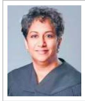
Hyderabad. She was a sole practitioner from 2018 to

The Judge was born in Vijayawada, Andhra Pradesh and completed her initial education in Hyderabad. She pursued her graduation in Psychology and Political Science from 1991 to 1994 in Osmania University,