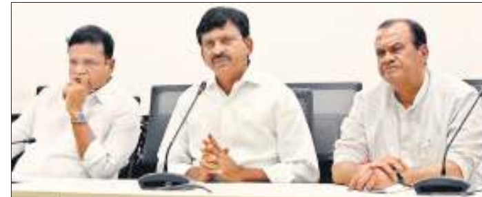
Minister Ponguleti Srinivas Reddy addressing a press conference after the Cabinet meeting on Monday