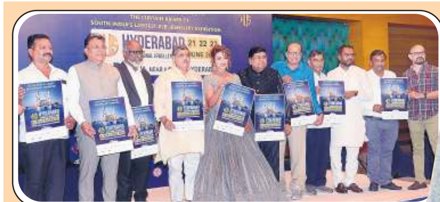
Hyderabad International Jewellery Show (HIJS) is being organised by United Exhibitions at GMR Arena in Hyderabad. The expo is going to be held from June 21 to June 23. The products on display will be a dazzling array of exquisite designs, from timeless classics to avant-garde creations, meticulously curated to captivate the end customer's senses!