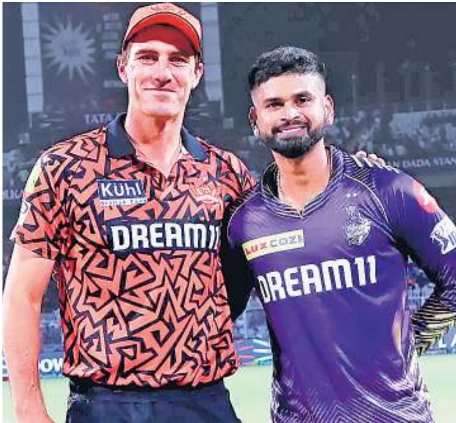
Table-toppers KKR (19 points) will also have to fill in the huge void at the top with their second-highest run-

scorer and wicketkeeper Phil Salt (435 runs) leaving the camp for national duties with England ahead of the T20 World Cup. Salt had forged a devastating partnership with Sunil Narine (461) at the top and KKR were immensely benefited by their ultra-aggressive approach with the bat, backed up well by a potent middle-order even though skipper Iyer (287) has not had a major impact yet. The washed out contest against