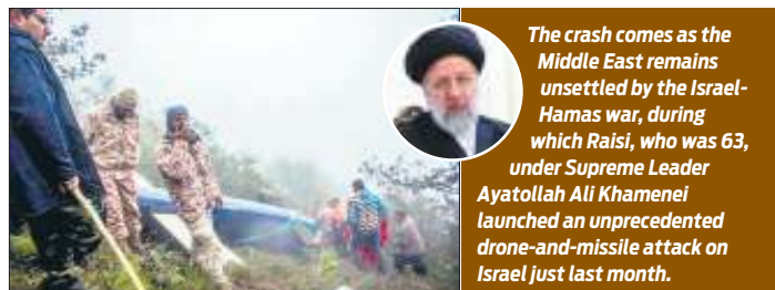
The crash comes as the Middle East remains unsettled by the Israel-Hamas war, during which Raisi, who was 63, under Supreme Leader Ayatollah Ali Khamenei launched an unprecedented drone-and-missile attack on Israel just last month.

During Raisi's term in office, Iran enriched uranium closer than ever to weapons-grade levels, further escalating tensions with the West as Tehran also supplied bomb-carry-