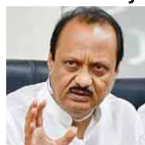
won more seats, the Congress was ready to give the chief minister's post...Late (chief minister and Congress leader) Vilasrao Deshmukh told me that Madam (Sonia Gandhi) had said Congress had no moral right to claim the chief minister post," Ajitdada said at the Indapur rally. Ajitdada that if Sharad Pawar had insisted, the NCP could have got the chief minister's post. "Vilasrao Deshmukh asked us as to who would be chief minister from the NCP — whether it is me, (late) RR Patil or Chhagan Bhujbal". "What Pawarsaheb did was to seek and get four additional ministerial berths and give up the chief minister's post. Yet, at that time, I kept quiet. Now I feel I should have parted ways with my uncle in 2004

As the ongoing electoral battle between the members of the Pawar family intensified in Baramati Lok Sabha constituency, breakaway nephew and deputy chief minister Ajit Pawar of the NCP on Friday fired a fresh salvo at NCP chief and family patriarch Sharad Pawar, by revealing that he wanted to part ways with his uncle way back in 2004. Addressing an election rally at Indapur Assembly segment which falls in the Baramati constituency, Ajitdada — as Ajit Pawar is known in the State political circles — expressed his regret of not severing his political links with Sharad Pawar in 2004. In the 2004 State Assembly polls, the then NCP and Congress — which were ruling Maharashtra as Democratic Front (DF) — had won 71 and 69 seats as against 62 and 54 seats won by the Opposition Shiv Sena (then united) and the BJP respectively. The DF had gone onto form a state government for the second time. "In 2004, when we (NCP) had