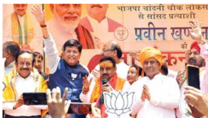
Union Minister Piyush Goyal, former Union Minister and BJP leader Harsh Vardhan with others during a Jansabha in support of the party candidate from Chandni Chowk constituency Praveen Khandelwal, ahead of the third phase of Lok Sabha elections, at Chandni Chowk, in New Delhi, on Friday.

works not for individuals but for organisational development, and each candidate is a symbol of the organisation. We will ensure the victory of BJP candidate Khandelwal by ensuring maximum voter turnout on election day." This support adds a stark contrast to the infighting between the Congress in the national Capital, which is now out in the open with the exit of former Delhi Congress Chief Arvinder Singh Lovely. Slamming the INDIA Bloc, Goyal said, "The Congress and the AAP abuse each other in Punjab while they have seat-sharing arrangements in other States. The people of Delhi are intelligent enough not to be misled by such tactics," adding that the grand old party is going to be "wiped out"