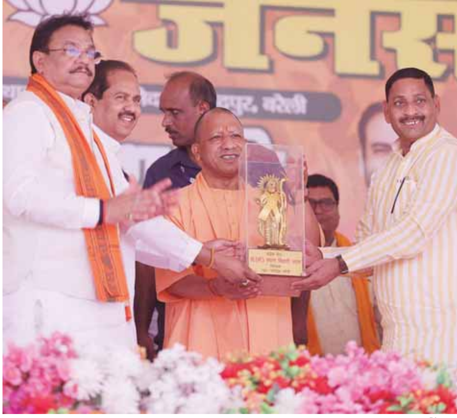
Chief Minister Yogi Adityanath receiving a memento at the BJP election rally in Aonla on Friday