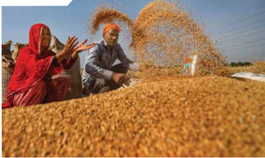
Farmers harvest wheat at a village near the Indo-Pak border, on the outskirts of Jammu