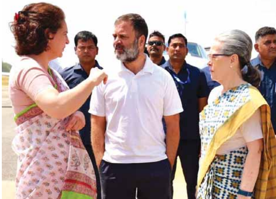
Congress leaders Rahul Gandhi, Sonia Gandhi and Priyanka Gandhi Vadra upon their arrival before the nomination filing of Rahul ahead of the third phase of the Lok Sabha elections, in Raebareli.

On deciding to contest from Raebareli Lok Sabha constituency, former Congress president Rahul Gandhi apparently made a calculated risk to solve several anomalies within and outside the party and hence retaining the legacy of Gandhi-Nehru family. In this scenario, neither the Gandhi scion has anything to lose, nor do the people of Raebareli, who were longing to continue their support for the grand old party's first family. The seat is currently held by longest-serving Congress chief Sonia Gandhi, who announced her retirement from electoral politics. While Sonia has been elected to the Rajya Sabha and will continue as a parliamentarian, the Congress and Rahul, who are confident enough to secure a victory in Raebareli as well as his current Wayanad Lok Sabha seat in Kerala, where he is contesting once again, will ultimately vacate the Uttar Pradesh Lok Sabha seat to pave the way for his sibling, Priyanka Gandhi Vadra. The party also appeared to have concluded that Raebareli would be the safer seat for Rahul who lost Amethi to Smriti Irani last time by nearly 50,000 votes. Sources in the party said the plans were already there that