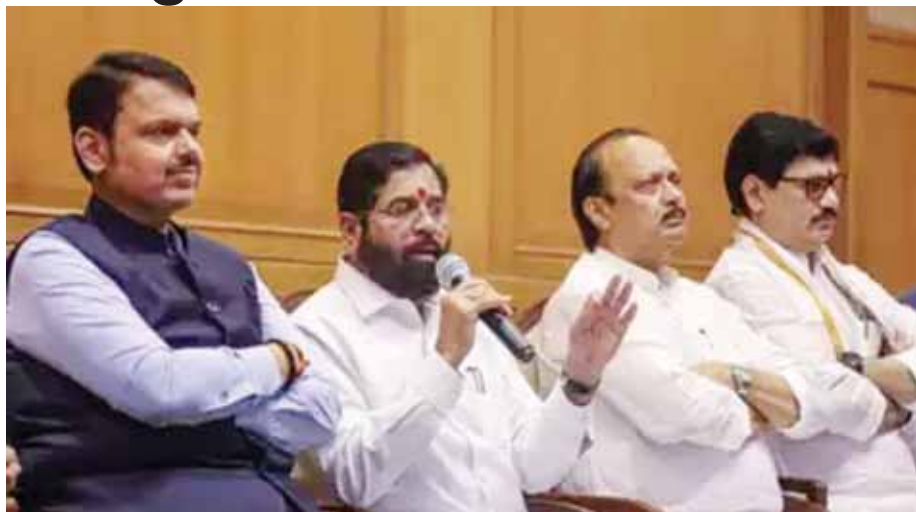
the MMR to the Shinde-led Shiv Sena. What has surprised many as to how Shinde — whose Shiv Sena does not have as strong an organisational base as the

Sabha seats (out of the total 48 seats). In the end, Shinde had his way in several of the disputed seats. Shinde's bargaining skills bear out from the fact that he has managed to arm-twist the BJP into giving his party three seats from Mumbai — the prestigious Mumbai, Mumbai north-west and Mumbai north-central, the adjoining Thane and Kalyan seats and also wrest the Nashik seat from the Ajit Pawar-led NCP. From the seat-sharing tie-up finalised within the ruling MahaYuti, it is quite surprising that the BJP — which has an excellent organisational base in the Mumbai Metropolitan Region (MMR), comprising the country's commercial capital and the neighbouring Thane and Palghar districts — has given away five out of nine Lok Sabha seats in