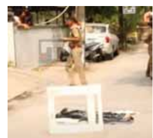
being known as an unwed mother that she threw down the child. The city police commissioner who led the probe asked the media not to publish the name of the woman as she was a rape victim. Police are investigating the role of others in this gruesome act. The parents of the woman were interrogated by the investigators and by evening, it was disclosed that the cops are trying to find out the details of a SUV which was seen speeding away from the apartment immediately after the incident. Kochi has already emerged as the crime capital of south India as not a single day passes without reports of murder, gang warfare, drug pushing and narcotics related crimes.

For the people of Kochi, Saturday May 3, 2024 will remain as an unforgettable and dreadful day for decades to come. The city woke up to the news that an infant, born hardly three hours ago was thrown out of a high rise residential apartment in the uptown Panampilly Nagar where the whose who of the metro has set up their residences. The incident occurred at 07.30 and the police on being alerted by persons who saw a plastic bag carrying the body of the child crashing down and hitting the ring road. The Kochi City Police team rushed to the site was taken back when they saw the content of the bag, the body of a new born child which has been broken and bruised. On inspecting all the 21 apartments, the police team came across a 21-year old woman who they confirmed as the one who gave birth to the child. She confided to the police that she was a rake victim and it was to escape from the ignominy of