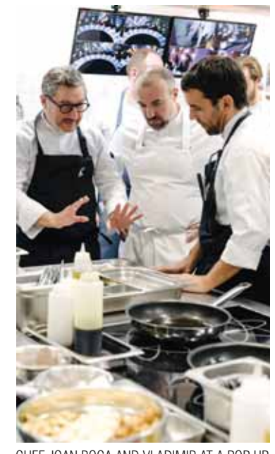
CHEF JOAN ROCA AND VLADIMIR AT A POP UP COLLABORATION IN KRASOTA, DUBAI