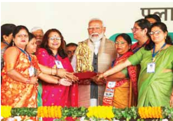
Prime Minister Narendra Modi being felicitated during a public meeting for Lok Sabha polls, in Palamu, on Saturday

The continuous jibe by Prime Minister Narendra Modi on Congress leader Rahul Gandhi by terming him "shehzada" (prince) reached a new zenith on Saturday with the latter's sibling and a general secretary in the grand old party, Priyanka Gandhi, calling the PM as "Shehanshah" (monarch). At the Lok Sabha poll rallies in Bihar and Jharkhand, Modi also used the term shehzada along with Rahul for the RJD leader and former Deputy Chief Minister Tejashwi Yadav. "There is a shehzada in Delhi (Rahul) and one in Patna (Tejashwi), both of whom think of the country as their fiefdom (jaagir)." While addressing a rally in Gujarat, Priyanka called Modi a "Shahanshaah" who lives in a palace but is cut off from the public. It was her first response to the PM's 'shehzada' jibe for her brother Rahul. Asserting that India wants a strong leader at the helm to ensure security, Modi said his Government's surgical and air strikes had shaken Pakistan, and the neighbouring country's