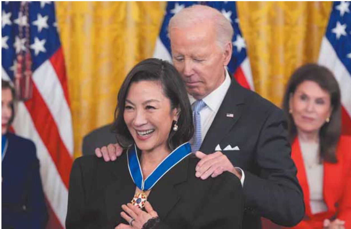
President Joe Biden awards the nation's highest civilian honor, the Presidential Medal of Freedom, to Michelle Yeoh during a ceremony in the East Room of the White House, on Friday in Washington.

Palestinian prisoners in Israeli jails. Hamas has said it will send a delegation to Cairo in the coming days for further discussions on the offer, though it has not specified when. Israel, and its allies, have sought to increase pressure on Hamas on the hostage negotiation. Signaling that Israel continues to move forward with its planning for a Rafah operation could be a tactic to nudge the militants to finalise the deal. Netanyahu said earlier this week that Israeli forces would enter Rafah, which Israel says is Hamas' last stronghold, regardless of whether a truce-for-hostages deal is struck. His comments appeared to be meant to appease his nationalist governing partners, and it was not clear whether they would have any bearing on any emerging deal with Hamas. US Secretary of State Antony Blinken visited the region, including Israel, this week and called the latest proposal "extraordinarily generous" and said "the time to act is now."