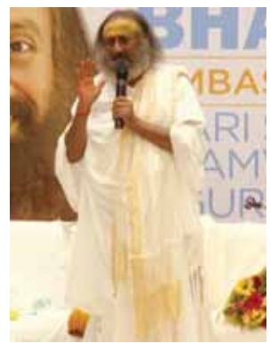
Gurudev reached the venue at KVT after enjoying a serene boat ride to Lalita Ghat. He also saw Shri Kashi Vishwanath Dham (corridor). He said that everyone could

incomparable experience for the devotees. Discussing women-led development, spirituality and the delicate balance between business and domestic responsibilities on the second day of his two-day visit to the parliamentary constituency of Prime Minister Narendra Modi, Ravi Shankar appreciated the efforts of the present government in empowering women in various sectors, highlighting their important role in the nation's journey to a developed India by 2047. He also highlighted the widespread impact of women power in various fields ranging from space exploration and startup ventures to sports.