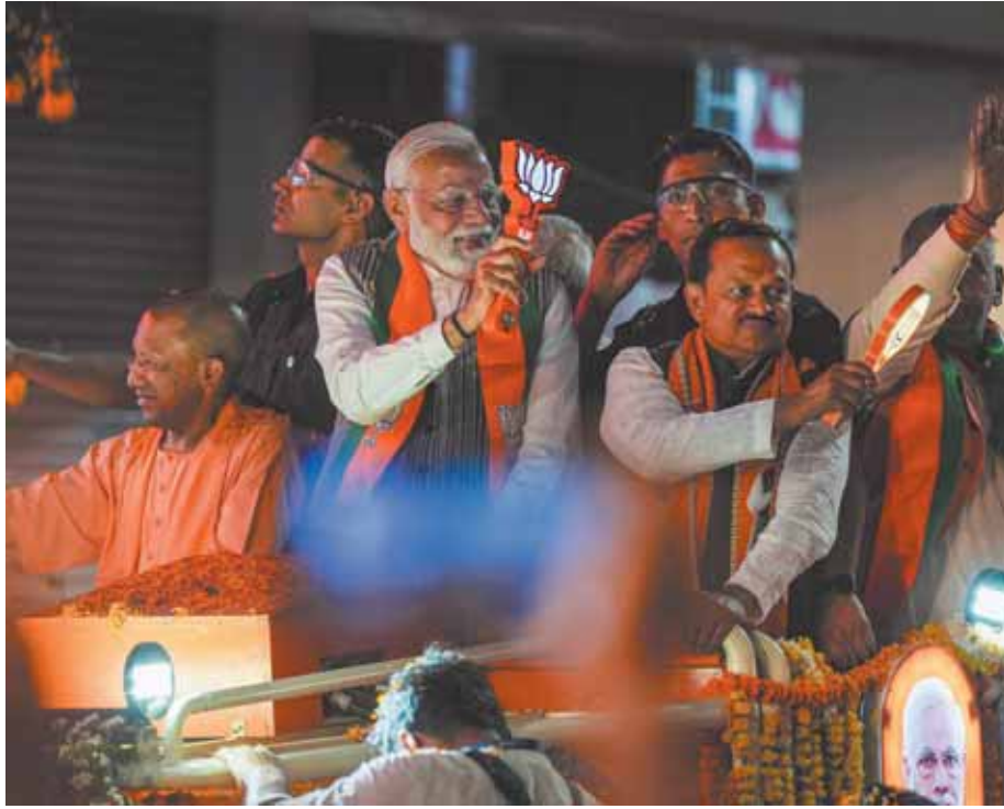
Party chief and former chief minister Akhilesh Yadav is in the fray, will also vote on the same day. A BJP worker said the roadshow was held from the Gumti Gurdwara to

Voting in the state's 13 Lok Sabha constituencies, including Kanpur and Akbarpur, will be held in the fourth phase of the Lok Sabha election on May 13. The Kannauj parliamentary constituency, where Samajwadi