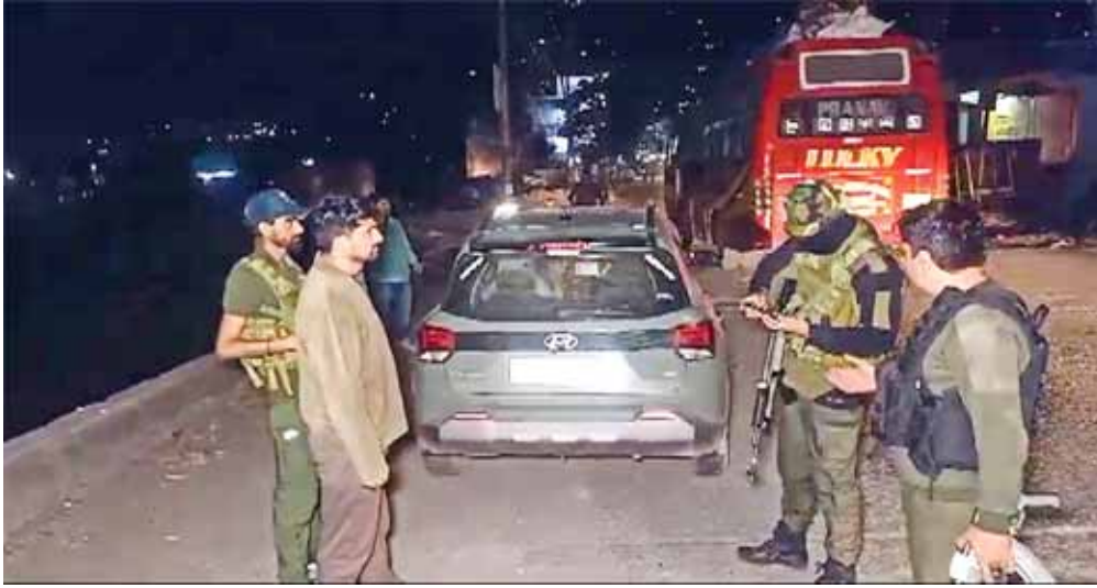
Security personnel stand guard after a militant attack on army vehicles, in Poonch district on Saturday. A search operation is going on in the woods amid inputs about the presence of the militants

In a stark reminder to the Pulwama terror attack on security personnel in February 2019 ahead of the Lok Sabha polls, an Indian Air Force (IAF) vehicle convoy was attacked in the similar fashion by terrorists in the Poonch district of Jammu and Kashmir late Saturday evening in which one soldier was killed and four seriously injured. The attack occurred near Shashidhar when the convoy vehicles were moving towards Sanai Top in the district's Surankote area. The local military units launched cordon and search operations to capture the terrorists behind the strike, the IAF statement read. This is the ninth major attack on security personnel since October 2021 in the region including this which comes right in the midst of 2024 General Elections. A similar terrorist strike took place in the Poonch district on December 21, 2023. Four Army personnel sacrificed their lives and three others received critical injuries after their vehicles were ambushed by the hiding foreign terrorists in the general area of Dera ki Gali in the Poonch district. Five Indian Army personnel including two officers were "killed in action" in the Kalakote forest area of Rajouri on November 22. Meanwhile, the audacious strike has once again raised question marks as none of the terrorists