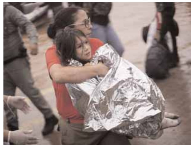
A firefighter carries a girl rescued from an area flooded by heavy rains in Porto Alegre, Rio Grande do Sul state, Brazil, Saturday.

from the state capital, Porto Alegre, a massively swollen river swept away a bridge that connected it with the neighbouring city of Linha Nova.