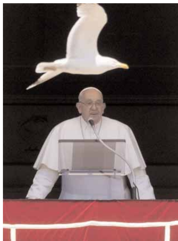
A seagull flies by as Pope Francis recites the Regina Coeli noon prayer from the window of his studio overlooking St. Peter's Square, at the Vatican, Sunday.

the party of Chancellor Olaf Scholz that fueled concern about intimidation and violence in the run-up to next month's election for the European Parliament.