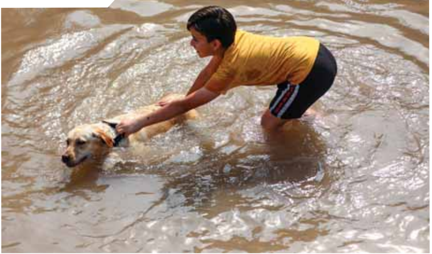
A child bathes his dog in a waterbody on a hot summer day, in Jammu