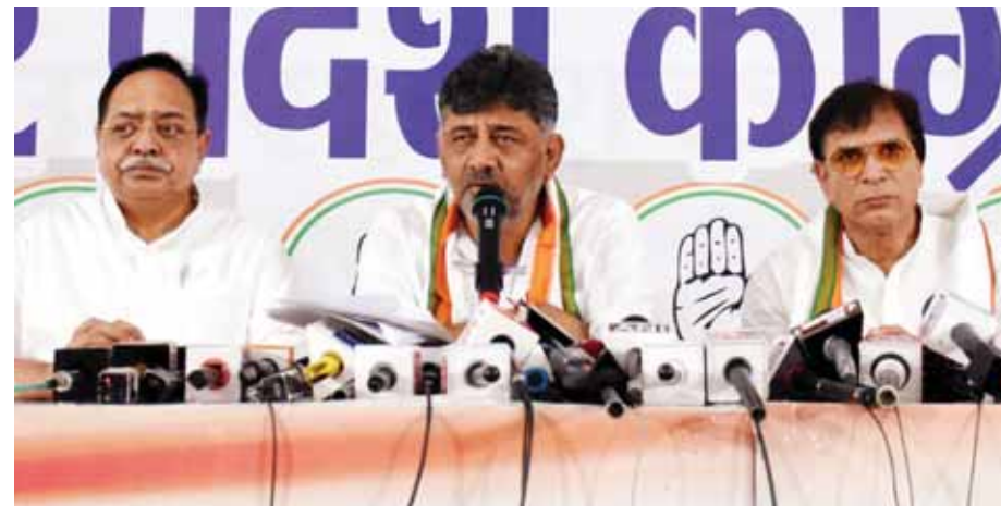
Deputy Chief Minister of Karnataka DK Shivakumar addressing mediapersons in Lucknow

Deputy Chief Minister of Karnataka DK Shivakumar on Thursday attacked the National Democratic Alliance government over promises it made for coming to power and assured that the Congress would implement all their five guarantees which it had made soon after assuming power in Karnataka. Addressing a press conference at the UPCC headquarters here on Thursday, the Karnataka Deputy Chief Minister and state congress committee president DK Shivakumar said that inflation and unemployment had taken the form of crisis today. "Since the formation of the Congress government in Karnataka, it is giving 10 kg food grains to poor families every month, Rs 2,000 per month to 1.20 crore women under Lakshmi Yojana, 200 units of free electricity to 1.50 crore families under Jyoti Yojana and unemployment allowance of Rs 3,000 per month to all the