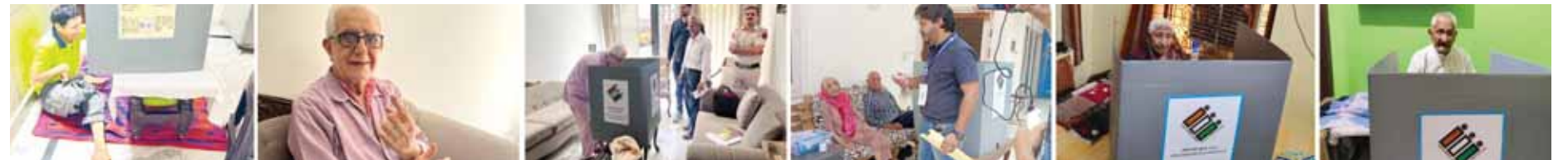
Despite the EC's best efforts to engage the elderly and specially-abled, along with all other eligible voters, the polling so far has not seen a significant increase in voter turnout