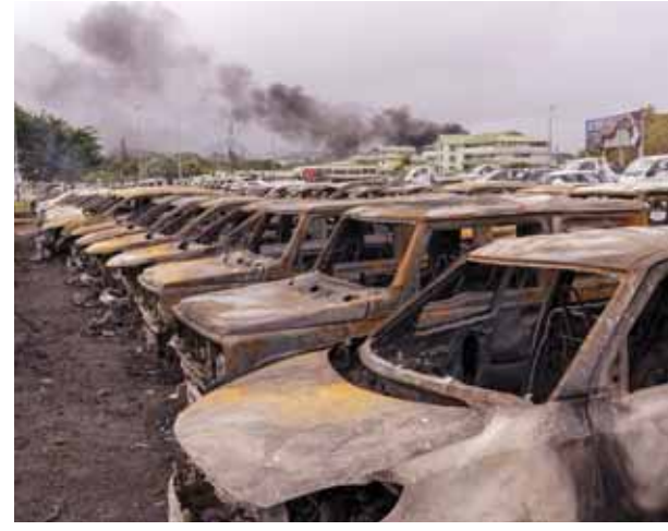
Burnt cars are lined up after unrest in Noumea, New Caledonia, Wednesday. France has imposed a state of emergency in the French Pacific territory of New Caledonia