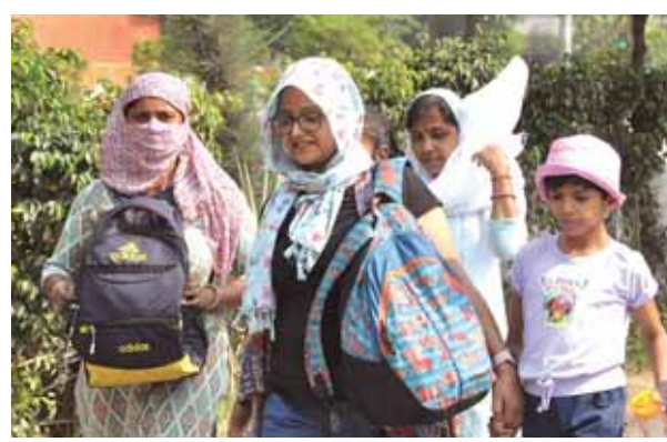
People use scarves to shield themselves from the hot summer

If you're residing in northwest India, brace yourself for intense heatwaves ahead. Days after predicting thunderstorms and rain spells in the region, the India Meteorological Department (IMD) on Thursday issued warnings of impending heatwave conditions, notably in Punjab, Haryana, Rajasthan, and Delhi. By Saturday, in fact, temperatures in the national Capital could soar to 45 degrees Celsius, exacerbating the already intense heat conditions. For the next five days, the Northwest region is expected to bear the brunt of heatwaves, owing to westerly and northwesterly winds, said the IMD, flagging heightened health concerns, particularly for vulnerable populations such as infants, the elderly, and those with underlying