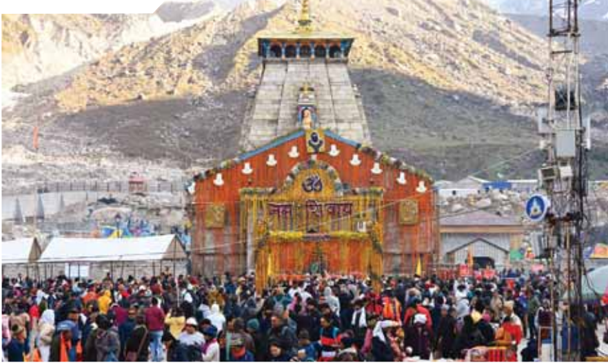
Devotees at the Kedarnath temple during the 'Char Dham Yatra', in Rudrapurag