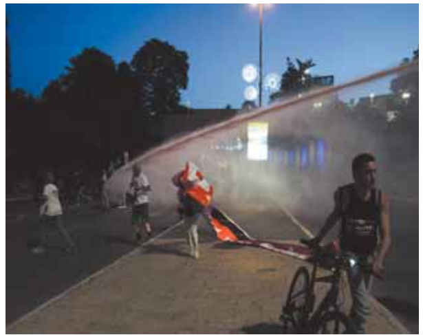
Police use water cannon to disperse demonstrators blocking a road during a protest against Israeli Prime Minister Benjamin Netanyahu's government, and calling for the release of hostages held in the Gaza Strip by the Hamas militant group, outside the Knesset, Israel's parliament in Jerusalem on Monday.

Israel sought Tuesday to contain the fallout from a request by the chief prosecutor of the world's top war crimes court for arrest warrants for Israeli and Hamas leaders, a move supported by three European countries, including key ally France. Belgium, Slovenia and France each said Monday they backed the decision by International Criminal Court prosecutor Karim Khan, who accused Israeli Prime Minister Benjamin Netanyahu, his Defence Minister Yoav Gallant, and three Hamas leaders — Yahya Sinwar, Mohammed Deif and Ismail Haniyeh — of war crimes and crimes against humanity in the Gaza Strip and Israel. While no one faces imminent arrest, the announcement deepens Israel's global isolation at a time when it is facing