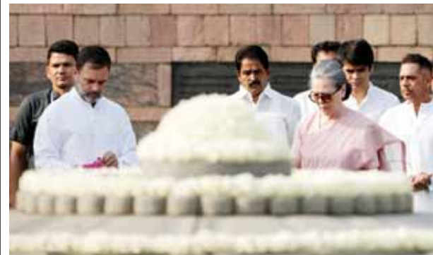
Congress leaders Sonia Gandhi and Rahul Gandhi pay tributes to former Prime Minister Rajiv Gandhi on his death anniversary at Veer Bhumi, in New Delhi, on Tuesday

Prime Minister Narendra Modi on Tuesday paid tributes to former Prime Minister Rajiv Gandhi on his death anniversary. India's Prime Minister between 1984 and