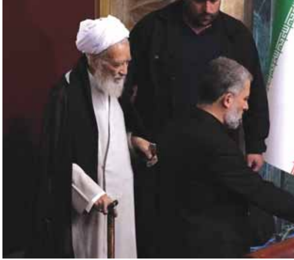
Ayatollah Mohammad Ali Movahedi Kermani arrives to attend the first session of Assembly of Experts after an election that decided the new assembly, in Tehran, Iran, Tuesday. Under Iranian constitution the 86-member all-cleric assembly has the right to monitor the performance of supreme leader, and choosing or dismissing him. Movahedi Kermani was picked Tuesday as head of the assembly.