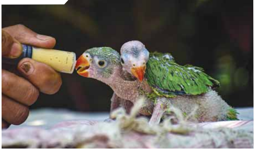
A man feeds a parrot's chick that fell off a tree, in Guwahati