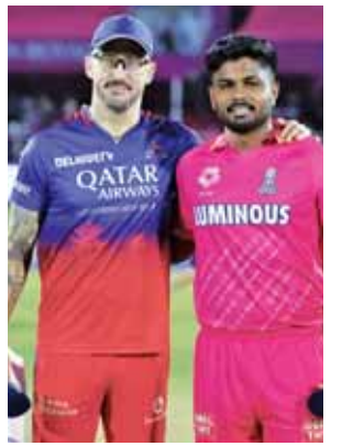
the bat this season.

Shimron Hetmyer is expected to be available for the contest giving Rajasthan solidity in the lower order, which has not made a big contribution with