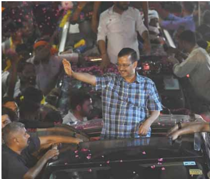
Delhi Chief Minister Arvind Kejriwal during a roadshow for Congress and joint INDIA Bloc candidate from North East Delhi, Kanhaiya Kumar

Najafgarh, Dwarka and IGI Airport and Gurugram is under construction in the final stage at a cost of 7.7 thousand crores," adding that BJP seeks votes on the basis of development and on the basis of the report card of the last 10 years. "Choose BJP to make the country a 5 trillion economy, to become the third largest economy of the world and especially to free Delhi from water pollution, air pollution