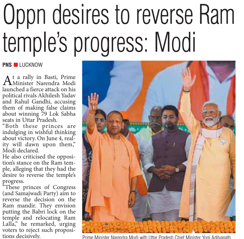
Prime Minister Narendra Modi with Uttar Pradesh Chief Minister Yogi Adityanath greet supporters during a public meeting for the Lok Sabha elections in Basti on

more than the Congress. Besides, the BJP has consistently raked up corruption allegations against the AAP, including the now-scrapped excise policy and 10 other alleged scams. AAP hopes Kejriwal's arrest will generate sympathy for the party in the general elections and help it win maximum seats in Delhi and Punjab. Continued on Page 8