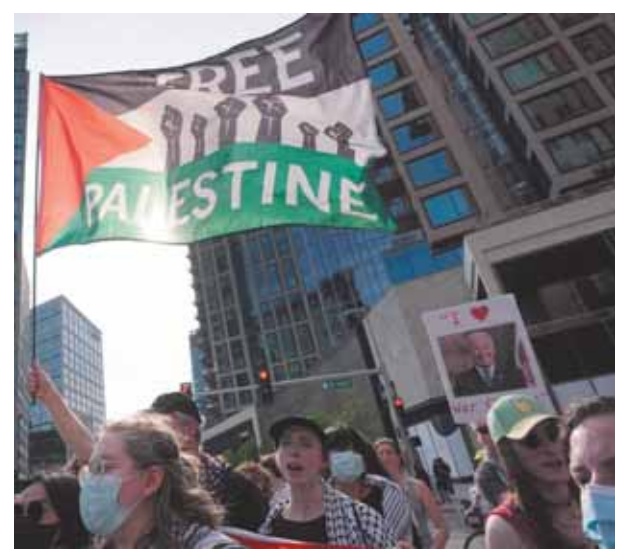
Demonstrators display Palestinian flags and chant slogans while marching Tuesday

With their formal recognition, planned for May 28, the three countries will join some 140 more than two-thirds of the United Nations — that have rec-