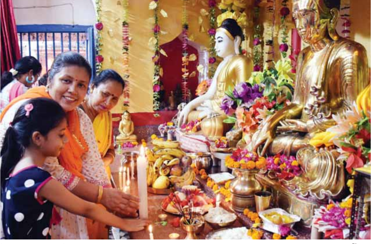
Devotees lighting candles at Buddha Vihar temple on Latouche Road in Lucknow on Thursday

All the accused are currently on the run.