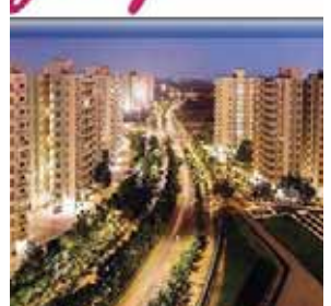
PTI ■ NEW DELHI

\begin{array}{ccc} R^{ealty} & {\rm firm} & {\rm Godrej} \\ Properties & {\rm has} & {\rm sold} \\ around & {\rm 650~flats~in~Noida~for} \end{array} more than Rs 2,000 crore, amid strong consumer demand for residential properties.