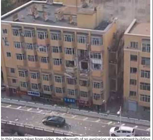
In this image taken from video, the aftermath of an explosion at an apartment building is seen in Harbin in northeastern China's Heilongjiang province on Thursday. State media say an explosion at an apartment building in Harbin, a city in northeastern China, has killed one person and injured at least three others.

The three others were taken to the hospital for their injuries. Videos online also showed at least one person being carted away by first responders into an ambulance, and the streets were covered in debris.Xinhua news agency said the explosion occurred at roughly 7 am. Harbin is the capital of China's northeastern Heilongjiang province.