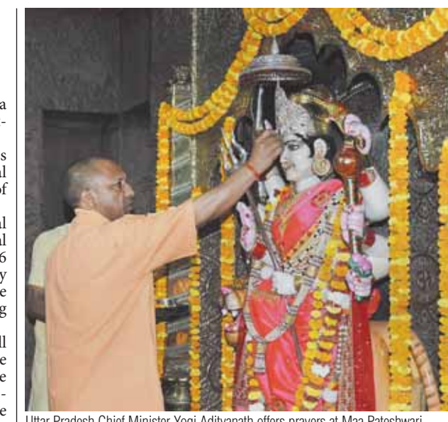
Uttar Pradesh Chief Minister Yogi Adityanath offers prayers at Maa Pateshwari