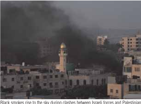
demonstrators in the West Bank city of Jenin, Wednesday,