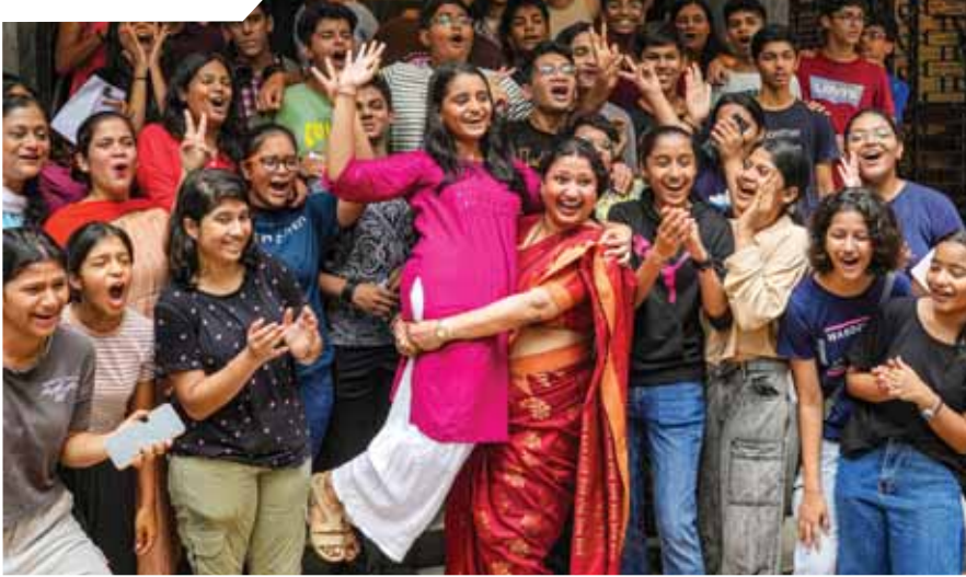
Students celebrate with their teacher over Secondary School Certificate (SSC) results, in Mumbai