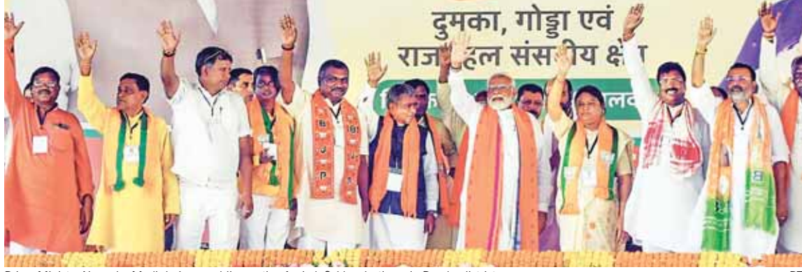
Prime Minister Narendra Modi during a public meeting for Lok Sabha elections, in Dumka district

Accusing the JMM of indulging in "communal and appeasement politics",