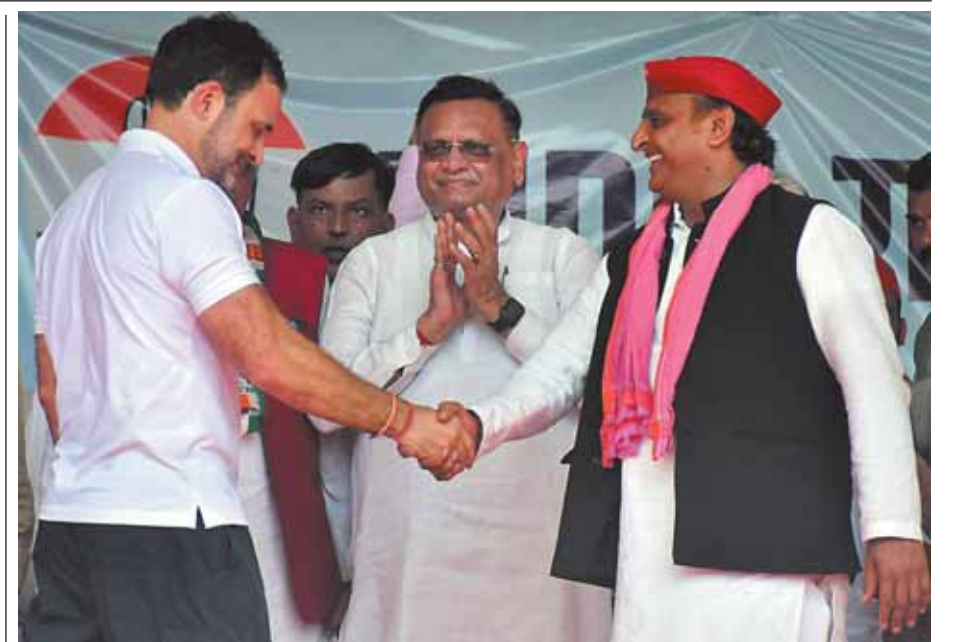
Congress leader Rahul Gandhi and Samajwadi Party Chief Akhilesh Yadav during a public meeting for Lok Sabha elections in Bansgaon on Tuesday.

As Bansgaon heads to the polls, the constituency stands at a crossroads where the outcome will not only determine its immediate political future but also carve out a significant place in its electoral history.