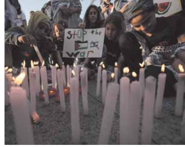
Children light candles during a march against Israel and in solidarity with Palestinians in the southern Gaza city of Rafah, on the Mediterranean Sea corniche in Beirut, Lebanon, Monday. Israeli Prime Minister Benjamin Netanyahu acknowledged Monday that a "tragic mistake" had been made after an Israeli strike in the southern Gaza city of Rafah set fire to a tent camp housing displaced Palestinians and killed at least 45 people, according to local officials.