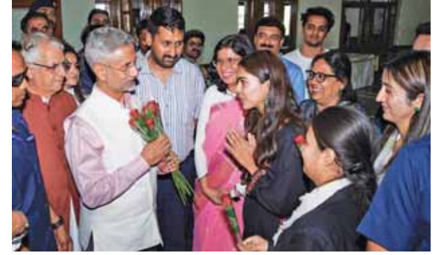
External Affairs Minister S. Jaishankar during a discussion on 'Viksit Bharat @2047', in Shimla, Tuesday

China is constructing roads, bridges and model village at the border on the land it took in 1962 and had made a road to Siachen with the coordination of Pakistan and India has also deployed forces,