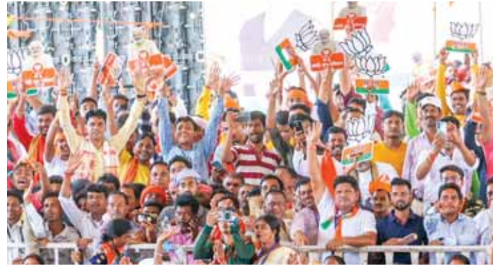
BJP supporters during Prime Minister Narendra Modi's public meeting for Lok Sabha elections, in Dumka district, on Tuesday