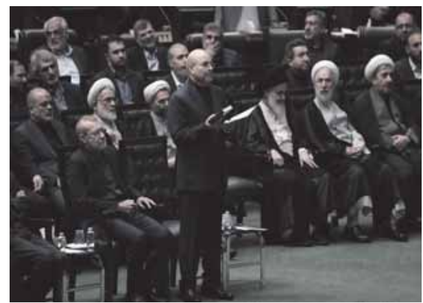
Mohammad Bagher Qalibaf, center, takes an oath during the opening ceremony of the new parliament term in Tehran, Iran.

Iran's parliament re-elected hard-liner Mohammad Bagher Qalibaf on Tuesday as its speaker, reaffirming its hard-right makeup in the wake of a helicopter crash that killed the country's president and foreign minister. Of 287 lawmakers voting, 198 backed Qalibaf to retain the position he first took in 2021. He initially became speaker following a string of failed presidential bids and 12 years as the leader of Iran's capital city, in which he built onto Tehran's subway and supported the construction of modern high-rises. Many, however, know Qalibaf for his support, as a Revolutionary Guard general, for a violent crackdown on Iranian university students in 1999. He also reportedly ordered live gunfire to be used against Iranian students in 2003 while serving as the country's police chief. In Tuesday's