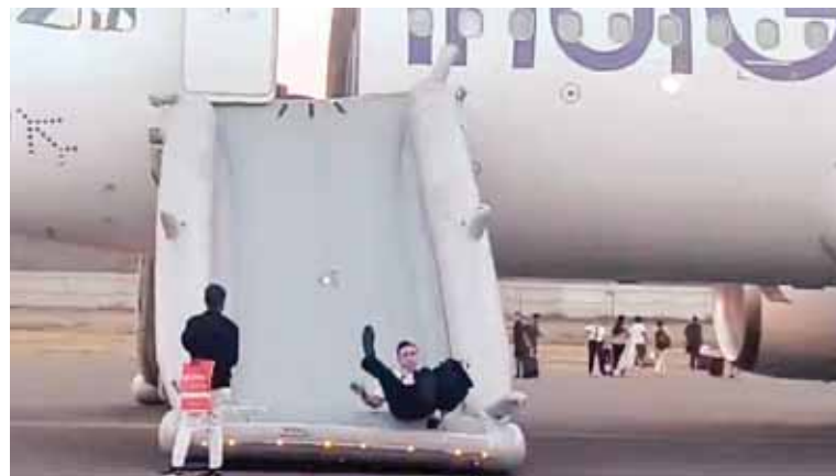
A pilot slides down from the Varanasi-bound IndiGo flight that received a bomb threat at the Indira Gandhi International Airport, in New Delhi on Tuesday

The footage shows the pilot sliding out of the aircraft using the emergency slides, highlighting the tense moments following the threat. An elderly woman passenger and an IndiGo crew can be seen coming out to the wing of the plane through the emergency exit,