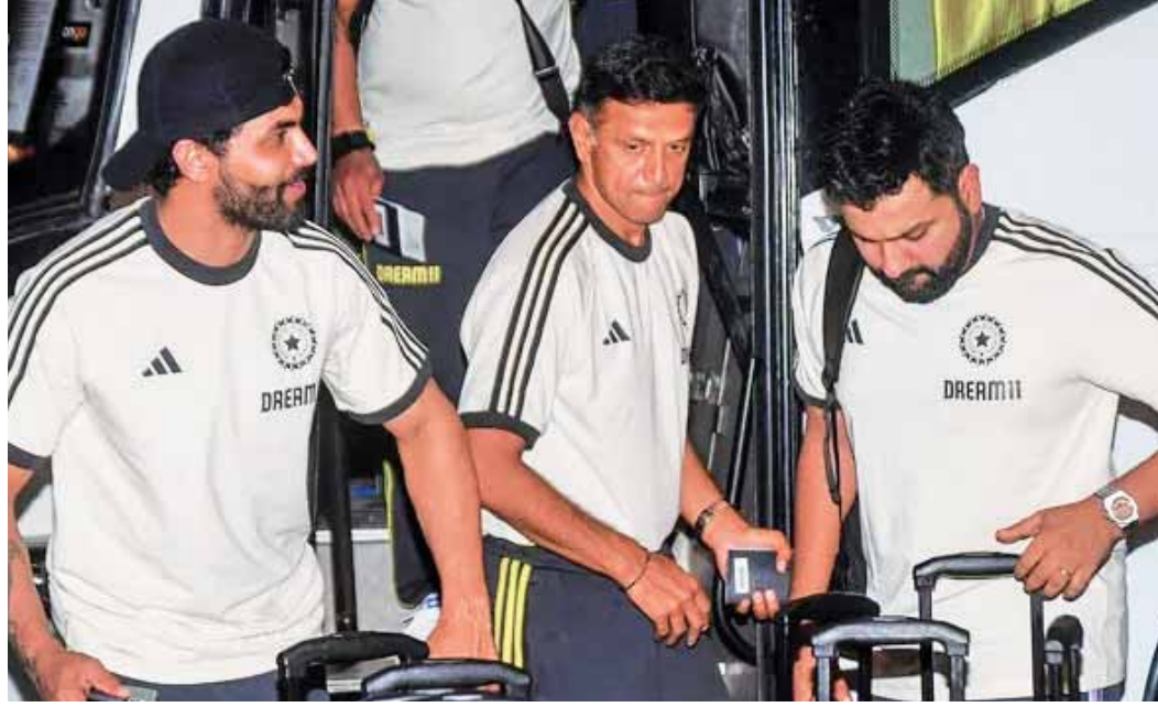
quite clear already. "I will be expecting if we need Shivam to ball a few overs, he will. Same with Hardik, he has come and bowled whenever needed. All-rounders must do that whatever their role is," he had said after the announcement of India's squad. However, that's just one part of the story. The batters will also have to negate pitches that will be very different from the ones they got used to in the IPL. "The West Indian pitches are no longer what they used to be in the '80s or in the '90s. They are now slower, and at times gripping," a veteran curator told PTI.

Mitchell Starc underlined that point after playing a big role in guiding Kolkata Knight Riders to their third IPL title. "There is an Impact Player Rule here (in IPL) and not in the T20 World Cup. You are going to rely more on your all-rounders. You cannot put your batting all-rounder at No. 8, like you did in the IPL. "I don't think that you'll see these kind of high scores in the T20 World Cup, purely because there will be one batter less," said Starc. In the earlier part of the IPL, Chennai Super Kings used Shivam Dube, a pace bowling all-rounder, exclusively as a batter through the Impact Player rule, though he usually walked in at No. 4 or 5 in place of a bowler. Dube produced a couple of match-winning knocks against Royal Challengers Bengaluru and the Knight Riders. But in the World Cup, the left-hander will have to showcase his bowling skills too to get a slot in the eleven as vice-captain Hardik Pandya plays a similar role and remains the first-choice. Skipper Rohit Sharma has made that bit