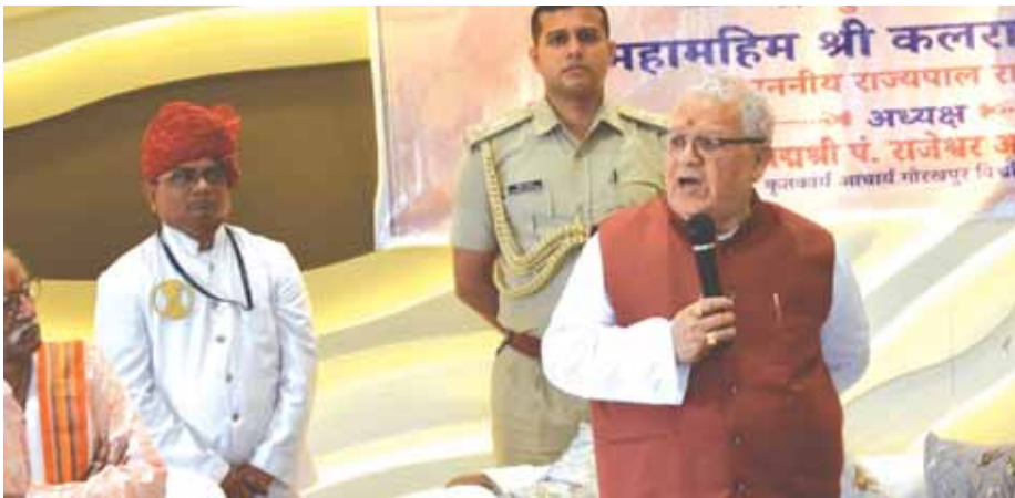
Rajasthan Governor Kalraj Mishra addressing a seminar in Varanasi on Wednesday.

"The Indian Constitution has been prepared with great effort in two years, 11 months and 18 days by 284 members of the Constituent Assembly after studying the major constitutions of the whole world, various Indian political systems, governance systems and the governmental systems up to the Vedic period", he said, adding that it includes all the elements necessary for democracy. According to