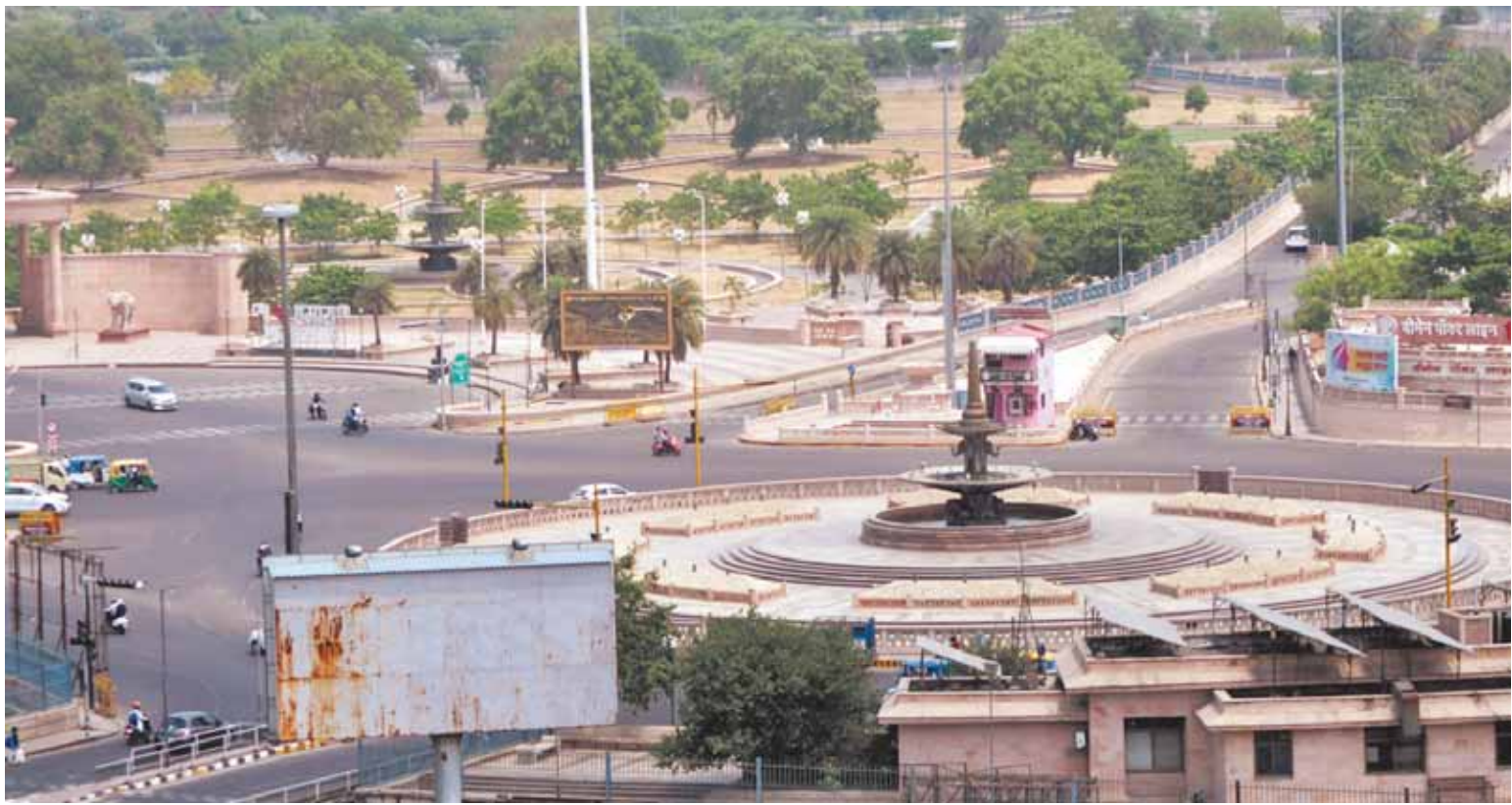
The 1090 crossing in Lucknow wears a deserted look in the scorching heat on Wednesday afternoon

Following slight rise in temperature over eastern, central and western parts of UP, heat wave to severe heat wave conditions prevailed at many places in the state, accompanied by isolated warm night conditions shattering many records. Prayagraj, Kanpur Nagar, Fursatganj and Sultanpur in east UP recorded all-time high temperatures on Wednesday. Fursatganj recorded its all-time high temperature whereas Prayagraj equalled the previous all-time high temperature of 48.8 degree Celsius. Fursatganj recorded 47.2 degree Celsius and Kanpur Nagar recorded a maximum temperature of 48.4 degree Celsius. Lucknow recorded a maximum temperature of 43.7 degree Celsius which was 3.6 degrees above normal and a minimum temperature of 29.4 which was 3.9 degrees above normal.