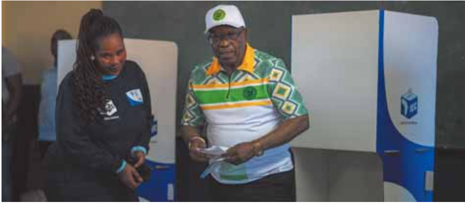
Former president of the A.N.C. and South Africa, Jacob Zuma, casts his vote in Nkandla, KwaZulu Natal, South Africa, Wednesday during the general elections. South Africans are voting in an election seen as their country's most important in 30 years, and one that could put them in unknown territory in the short history of their democracy, the three-decade dominance of the African National Congress party being the target of a new generation of discontent in a country of 62 million people.

Millions of South Africans are voting on Wednesday to elect a new National Assembly as well as the provincial legislatures, amid predictions that the President Cyril Ramaphosa-led African National Congress could lose its majority for the first time since Nelson Mandela was elected 30 years ago. The polling stations opened at 7 am (local time) and will close at 9 pm. Final results are expected by Sunday. President Ramaphosa, 71, remained confident that his party would return to power in the election, which is the most hotly contested since Mandela was elected as the country's first democratic president in 1994. "The people of South Africa will give the ANC, as they vote today, a firm majority. So, in my mind, in my head and in my thought processes, there isn't even a doubt about that," Ramaphosa said in a brief