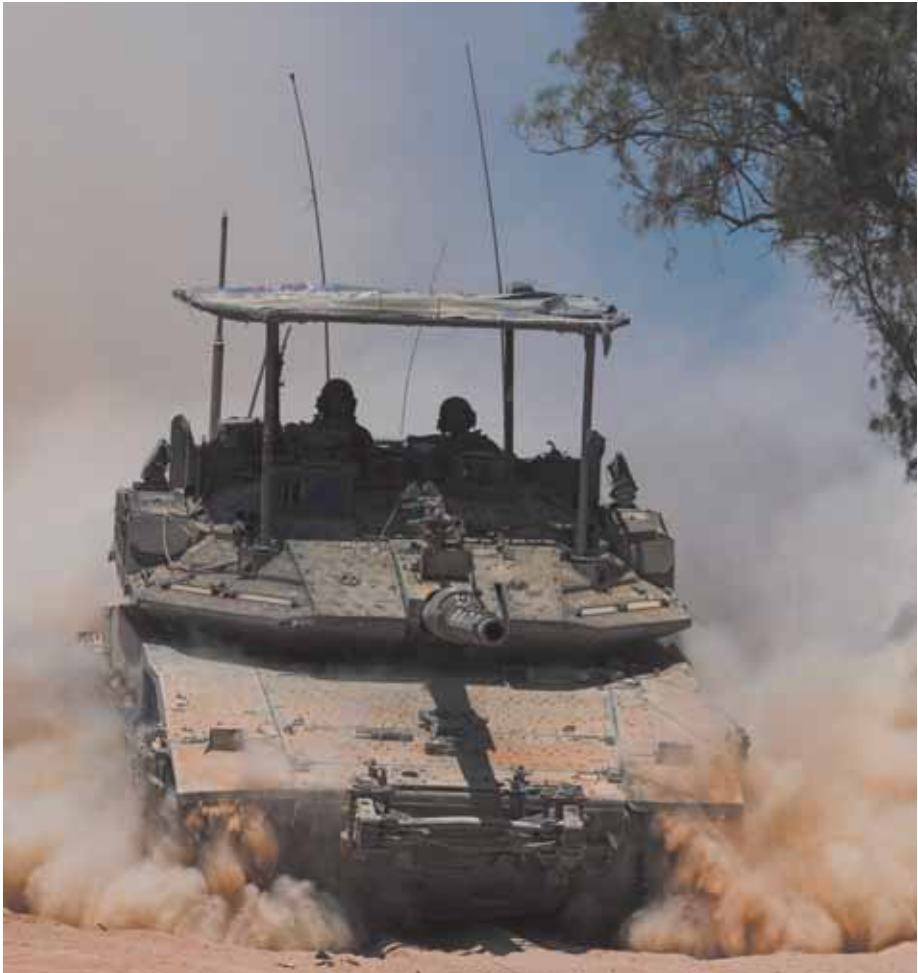
Israeli soldiers drive a tank near the Israeli-Gaza border, in southern Israel, Wednesday.

that Israel "immediately halt its military offensive, and any other action in Rafah". The draft condemns what it calls "the indiscriminate targeting of civilians, including women and children, and civilian infrastructure" and reiterates the council's demand for all parties to comply with international law requiring the protection of civilians. Algeria's UN ambassador, Amar Bendjama, who is also the Arab representative on the Security Council, told reporters after emergency closed council consultations Tuesday that he would be sending the draft resolution to the 15-member council later in the evening. Algeria called the emergency council meeting as Israel pushed ahead with its military operation in Rafah, where over a million Palestinians had sought refuge. It followed Sunday night's Israeli airstrikes that triggered a fire engulfing tents in a camp for displaced Palestinians west of Rafah, killing 45 people and injured over 100 others.