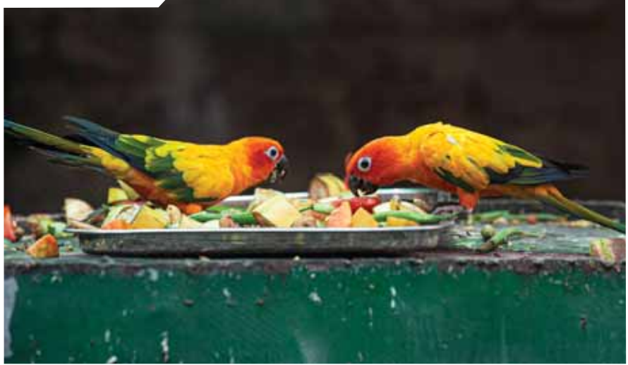
Lovebirds at their enclosure on a hot summer day, in New Delhi