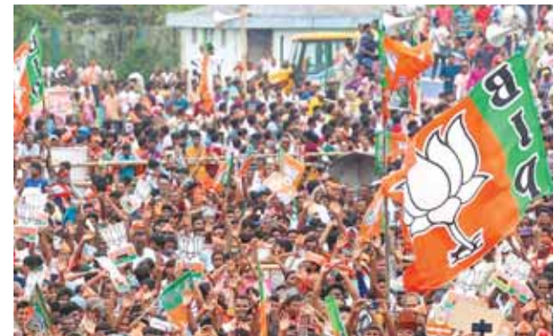
BJP supporters during Prime Minister Narendra Modi's campaign rally for Lok Sabha polls, in Mathurapur, West Bengal, on Wednesday

The voting schedule period for the 2024 Lok Sabha elections, spread over 44 days, which is the second longest after the first parliamentary elections of 1951-52, which lasted for more than four months but then that time it was through ballot papers and the counting of votes lasted for 4/5 days. Interesting slogans ranged from "God of the Gods" to "Lord Jagannath" and "Mujra", 'disco', 'Bhangra', 'Bharatnatyam' to Minimum Support Price (MSP) to farm loan waiver and Muslim appeasement dominated in