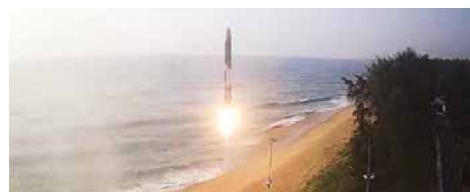
Agnikul Cosmos successfully carries out a sub-orbital test-flight of its home-built 3D-printed semi-cryogenic rocket Agnibaan from its own launch pad at Sriharikota, on Thursday

Describing successful launch of a rocket Agnibaan powered by world's first single-piece 3D printed semi-cryogenic engine as a "momentous occasion" for India's space sector, Prime Minister Narendra Modi on Thursday said "it is a testament to our yuvashakti." Chennai-based space start-up Agnikul Cosmos successfully carried out a sub-orbital test-flight of its home-built 3D-printed semi-cryogenic rocket — Agnibaan — from its own launch pad at Sriharikota, making it India's second private entity to do so. Modi, in a post on X, said, "A remarkable feat which will make the entire nation proud!" "The