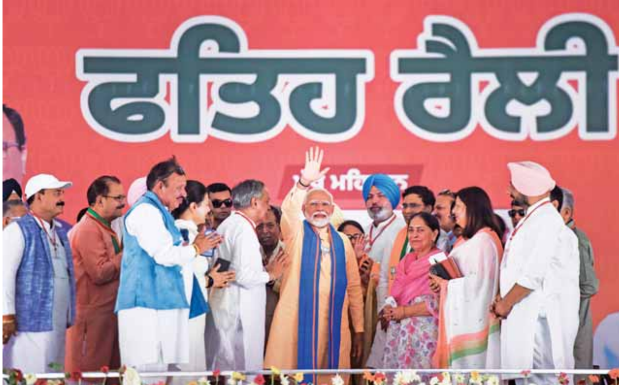
Prime Minister Narendra Modi waves at crowd during a public meeting for Lok Sabha elections in Hoshiarpur, Punjab, on Thursday

Prime Minister Narendra Modi ended his whirlwind Lok Sabha poll campaign with a rally in Punjab's Hoshiarpur on Thursday, closing out his electioneering the way he began — by focussing on a region where he has invested heavily over the years for the BJP to make a mark outside its strongholds. Modi notched up a total of 206 public-outreach programmes, including rallies and roadshows, since the Election Commission (EC) announced the poll schedule on March 16. The Prime Minister surpassed his nearly-145 public engagements on the stump during the 2019 polls by a big margin. The campaign period this time was of 76 days, compared to the 68 days in the polls held five years ago. When the EC announced the polls, Modi was on a political tour of southern India, covering all five states in the three days between March 15 and March 17. The Bharatiya Janata Party (BJP) is eyeing to boost its fortunes in Tamil Nadu, Kerala and Andhra Pradesh — three states where it won no seat in 2019 — and