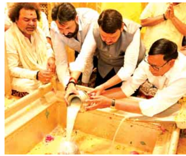
Maharashtra DyCM Devendra Fadnis offering prayers at Kashi Vishwanath Temple in Varanasi on Thursday.

Meanwhile, the BJP workers took out padyatras at 1,900 booths for Modi's record victory. These processions were participated by many UP ministers, MLAs and party office-bearers along with their respective mandals and booths. They also met influential voters and held meetings with them at various places and appealed for voting. In this direction, UP