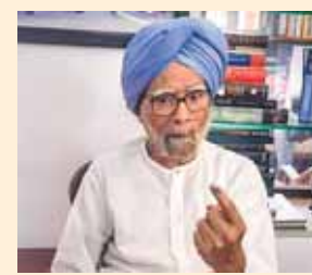
Former Prime Minister Manmohan Singh

Commission's direction of no appeal for votes on caste and religion. Earlier in an appeal to voters, particularly Punjab ahead of the seventh-phase of Lok Sabha polls on Saturday, Singh asserted that only the Congress can ensure growth-oriented progressive future where democracy and Constitution will be safeguarded. The senior Congress leader also hit out at the BJP Government for imposing an "ill-conceived" Agniveer scheme on the Armed forces. "The BJP thinks that the value of patriotism, bravery and service is only four years. This shows their fake nationalism," he said in a letter to voters of Punjab.