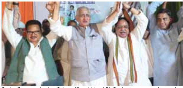
Senior Congress leaders Salman Khurshid and PL Punia at a press conference in Varanasi on Wednesday evening.

According to Khurshid, evaluation is being done on seven subjects in seven phases