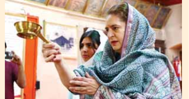
Congress leader Priyanka Gandhi at Jaku Temple, Shimla, in the midst of last day of campaign in Himachal Pradesh on Thursday

In his first statement in the flag-end of ensuing Lok Sabha elections, former Prime Minister Manmohan Singh on Thursday accused his successor Narendra Modi of lowering the dignity of public discourse and the gravity of the office of the PM by giving "hateful speeches" during the poll campaign. Singh also took the opportunity to make his stand clear after the controversy erupted when Modi had accused Singh of saying that Muslims have the first right on the country's resources. On the last day of two months long campaign, Congress president Mallikarjun Kharge also expressed confidence that the INDIA Bloc will secure a clear majority in the Lok Sabha polls and give the country an inclusive and nationalist Government, while senior leader Rahul Gandhi responded to Modi's assertion that the world only learned of Mahatma Gandhi through the film 'Gandhi'.