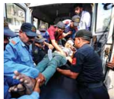
An injured man being admitted to the Government Medical College Hospital after a bus carrying pilgrims fell into a gorge in Akhnoor, in Jammu, on Thursday

At least 22 pilgrims died and 64 others received injuries after an overcrowded bus, headed towards the famous Shiv Khori shrine, rolled down into a deep gorge near the Tungi Morh, Chowki Choura area of Akhnoor in Jammu division on Thursday. The list of dead included 10 males, 9 women, and two children. The majority of pilgrims hailed from Uttar Pradesh and Rajasthan. According to a statement issued by the Jammu and Kashmir Police, the bus bearing registration number UP81CT-4058 was carrying devotees from Kurukshetra towards the Shiv Khori shrine in the Reasi district when it met with an accident at around 12.35 p.m. on Thursday in