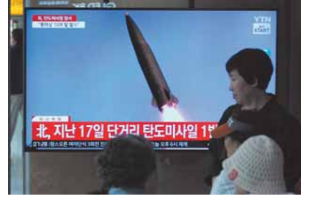
A news program broadcasts a file image of a missile launch by North Korea, at the Seoul Railway Station in Seoul, South Korea, Thursday. North Korea on Thursday fired a barrage of ballistic missiles toward its eastern sea, according to South Korea's military, days after its attempt to launch a military reconnaissance satellite ended in failure but still drew strong condemnation from its rivals.

North Korea on Thursday fired a barrage of suspected ballistic missiles toward its eastern sea, according to South Korea's military, days after its attempt to launch a military reconnaissance satellite ended in failure but still drew strong condemnation from its rivals. South Korea's Joint Chiefs of Staff said it detected the North firing around 10 projectiles that appeared to be short-range ballistic missiles from an area near its capital, Pyongyang. It said the suspected missiles flew around 350 kilometers (217 miles) before landing in waters off the North's eastern coast. It said the South Korean military has increased surveillance and vigilance and is closely sharing information with the United States and Japan. Japan's coast guard issued a maritime safety advisory over the North Korean launches