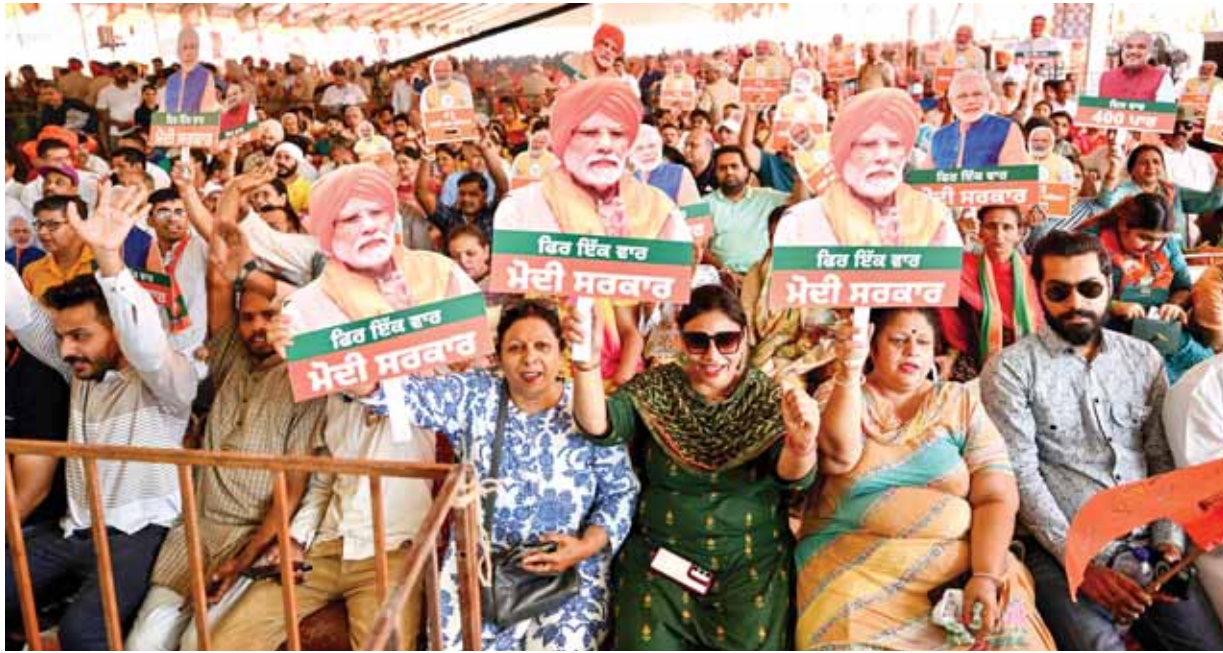
NDA supporters at Prime Minister Narendra Modi's public meeting for the last phase of Lok Sabha elections, in Hoshiarpur, Punjab, on Thursday

Addressing his final rally of the back-to-back hectic 2024 Lok Sabha polls campaign, which spanned about two months, Prime Minister Narendra Modi on Thursday attacked the Congress for 'ranting' about the Constitution. He accused them of 'strangling' it during the Emergency and not caring about it when Sikhs were killed in the 1984 riots.