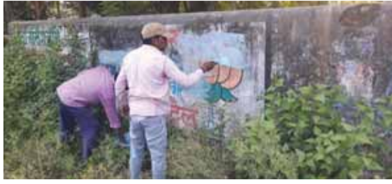
STAFF REPORTER ■ RAIPUR

For strict adherence to the Model Code of Conduct (MCC), the Election Commission in Chhattisgarh has removed a total of 4,34,580 pieces of illegal political propaganda, an official communiqué said on Friday.