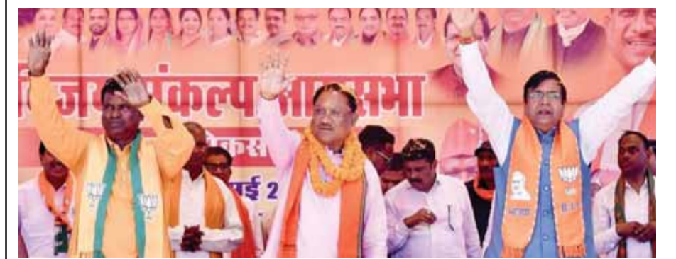
STAFF REPORTER ■ RAIPUR

Chhattisgarh Chief Minister Vishnu Deo Sai on Friday said that voters in the country will not get trapped by the illusions of the Congress. They will vote for the BJP and Prime