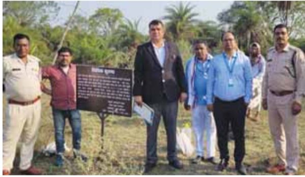
years. The DRT is going to take similar actions against other defaulters and guarantors as well, they said.