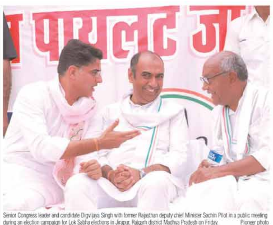
Senior Congress leader and candidate Digvijaya Singh with former Rajasthan deputy chief Minister Sachin Pilot in a public meeting during an election campaign for Lok Sabha elections in Jirapur, Rajgarh district Madhya Pradesh on Friday.