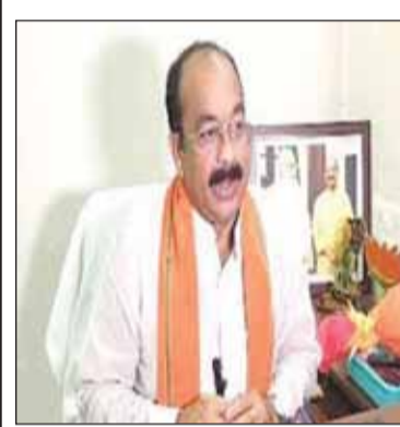
STAFF REPORTER ■ RAIPUR

Chhattisgarh Deputy Chief Minister Arun Sao on Friday said that senior Congress leader Rahul Gandhi would suffer defeat from the traditional Gandhi family seat of Rae Bareilly in Uttar Pradesh.