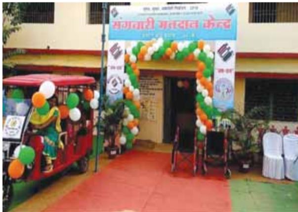
STAFF REPORTER ■ RAIPUR

The Election Commission has set up 2,828 all-women polling booths called 'Sangwari Booth' to encourage women to vote in the third and final phase of the Lok Sabha elections in Chhattisgarh.