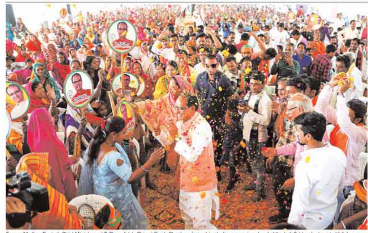
Former Madhya Pradesh Chief Minister and BJP candidate Shivraj Singh Chouhan during his election campaign ahead of the Lok Sabha elections in Vidisha district Madhya Pradesh on Friday.