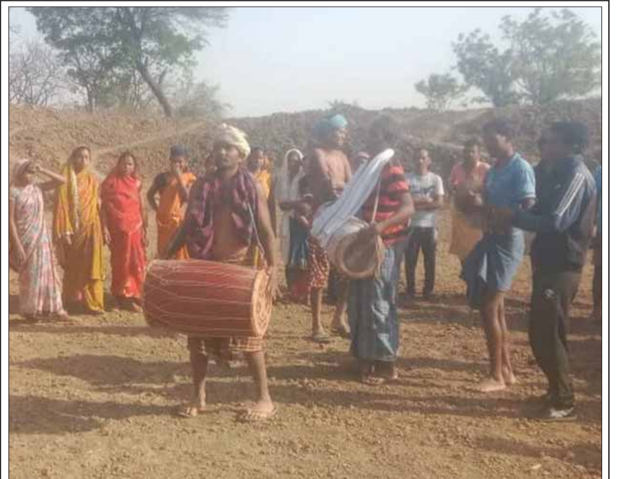
A glimpse of cultural programmes held in Chhattisgarh's Balrampur on Friday to ensure participation of members of the special backward tribe Pahadi Korwa in the May 7 Lok Sabha elections.

previous low turnout. An official communiqué said that efforts were being made to make the general elections more inclusive, not only for women but for the disabled and youth as well. A total of 57 disabled polling booths and 260 youth polling booths have been set up where disabled people and youth will conduct voting. Surguja, Korba, Bilaspur, Raipur, Durg, Janjgir-Champa and Raigarh will see voting across 15,701 polling stations on May 7. The results will be announced nationally on June 4.