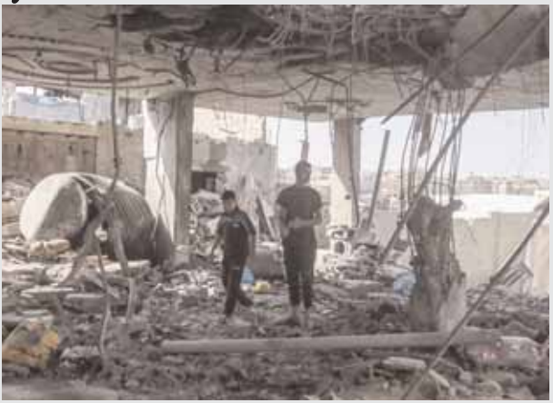
Palestinians stand in the ruins of the Chahine family home, after an overnight Israeli strike that killed at least two adults and five boys and girls under the age of 16 in Rafah, southern Gaza Strip, Friday. An Israeli strike on the city of Rafah on the southern edge of the Gaza Strip killed several people, including children, hospital officials said Friday.

Turkiye on Thursday suspended all imports and exports to Israel citing the country's ongoing military action in Gaza and vowed to continue to impose the measures until the Israeli government allows the flow of humanitarian aid to the region. A Turkish Trade Ministry statement said "export and import transactions in relation to Israel have been stopped, covering all products." Turkish officials would coordinate with Palestinian authorities to ensure that Palestinians are not affected by the suspension of imports and exports, the ministry said. The ministry described the step as the "second phase" of measures against Israel, adding that the steps would remain in