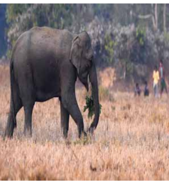
STAFF REPORTER ■ DHAMTARI