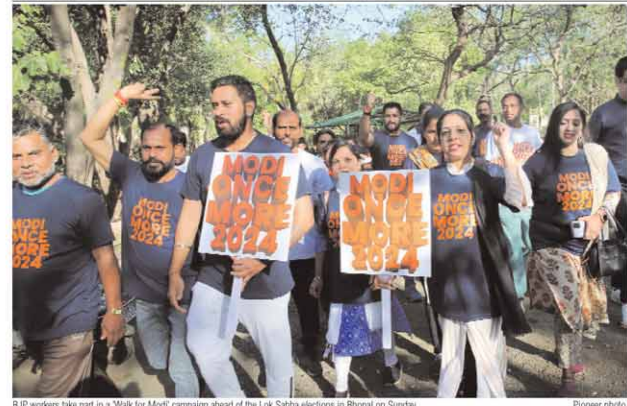
BJP workers take part in a 'Walk for Modi' campaign ahead of the Lok Sabha elections in Bhopal on Sunday.

asm displayed at our voter awareness rally". He further added that through this car rally, we aim to inspire our fellow citizens to register and vote. He said that the task is not yet completed till everyone including all SBI staff members at Bhopal cast their vote on May 7.