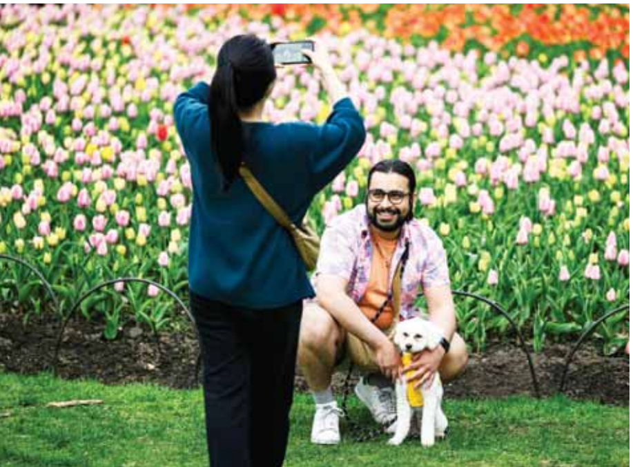
People pose for photos among the tulips as they bloom in Commissioner's Park in Ottawa, Ontario, a week before the opening of the Canadian Tulip Festival, on Saturday

monarchy represent the people of modern Britain? How will the institution address concerns about its links to empire and slavery? Should the monarchy be replaced with an elected head of state?