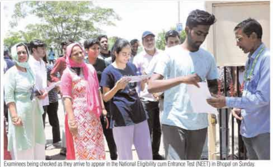
Examinees being checked as they arrive to appear in the National Eligibility cum Entrance Test (NEET) in Bhopal on Sunday.

Five students fatally attacked a student at Rajiv Gandhi Technological University (RGPV) located in Gandhi Nagar, Bhopal. The accused seriously injured victim by hitting him on the head with a rod. The reason for the dispute is said to be old rivalry.