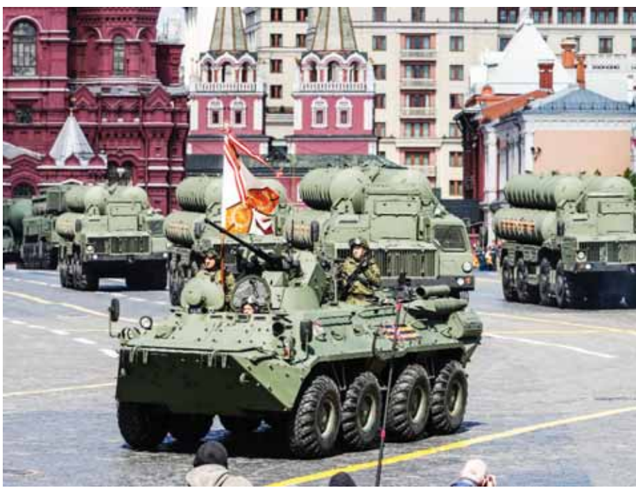
Russian APC and S-400 anti-aircraft missile system launchers roll during the Victory Day military parade dress rehearsal at the Red Square in Moscow, Russia, on Sunday.

The regime "is at permanent risk of crumbling overnight, as its Soviet predecessor did three decades ago." Putin is sure to continue his continue animosity toward the West, which he said in his state of the nation address "would like to do to Russia the same thing they did in many other regions of the world, including Ukraine: to bring discord into our home, to weaken it from within."