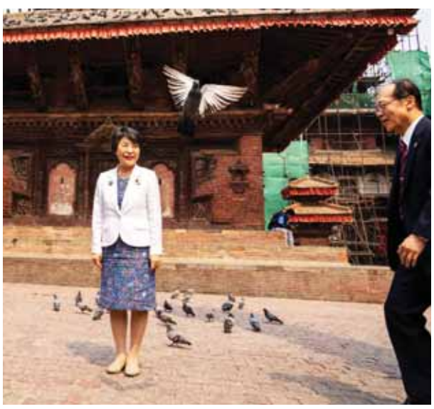
A pigeon flies past as Japanese Foreign Minister Yoko Kamikawa takes a walk at the Basantapur Durbar Square, one of the UNESCO World Heritage Sites, in Kathmandu, Nepal, on Sunday

'Prachanda' separately, according to the sources. The Japanese embassy in Kathmandu last week expressed hope that the foreign minister's visit "will give a good impetus for further strengthening our friendly relationship towards the year 2026, the 70th anniversary of the establishment of diplomatic relations between Japan and Nepal."