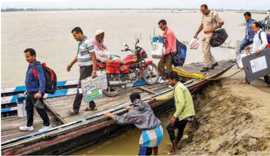
Polling officials travel via a boat to reach their respective polling booths, a day before the voting, in Kamrup