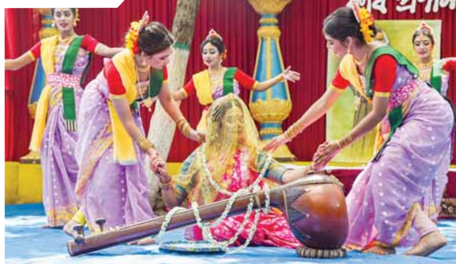
Students perform during the celebration of Nobel laureate Rabindranath Tagore's birth anniversary, in Nadia