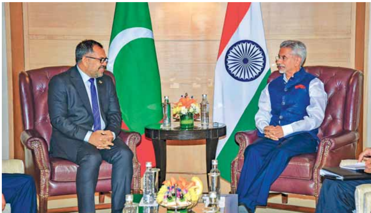
External Affairs Minister S Jaishankar with Maldives Foreign Minister Moosa Zameer at a meeting in New Delhi

Development of India-Maldives ties is based on "mutual interests" and "reciprocal sensitivity", External Affairs Minister S Jaishankar said here on Thursday during his talks with his Maldivian counterpart Moosa Zameer. These remarks came in the backdrop of strained ties between the two countries after President Mohamed Muizzu insisted on withdrawal of Indian military personnel operating three military platforms in the island nation. Zameer is New Delhi in the first high-level trip from Male after the Maldives' pro-China president Muizzu assumed office six months ago. "As close and proximate neighbours, the development of our ties is obviously based on mutual interests and reciprocal sensitivity," Jaishankar said in his opening remarks in his meeting with Zameer. "As far as India is concerned, these are articulated in terms of our Neighbourhood First policy and SAGAR (Security and Growth for all in the Region) vision. I hope that our meeting today will enable us to strengthen the convergence