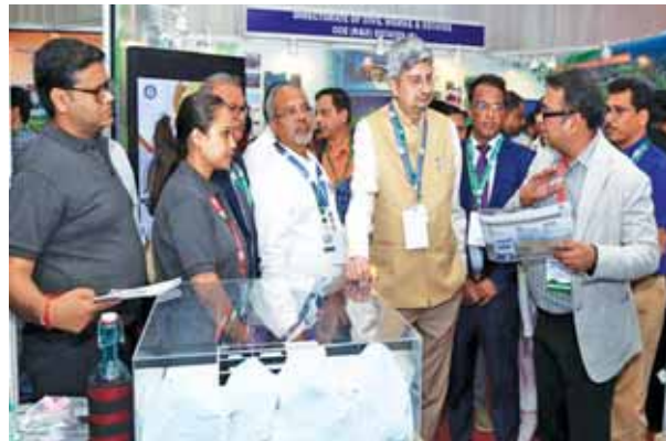
Secretary exhorted the infrastructure firms to contribute in further strengthening the apparatus. He added that while the Armed Forces personnel are