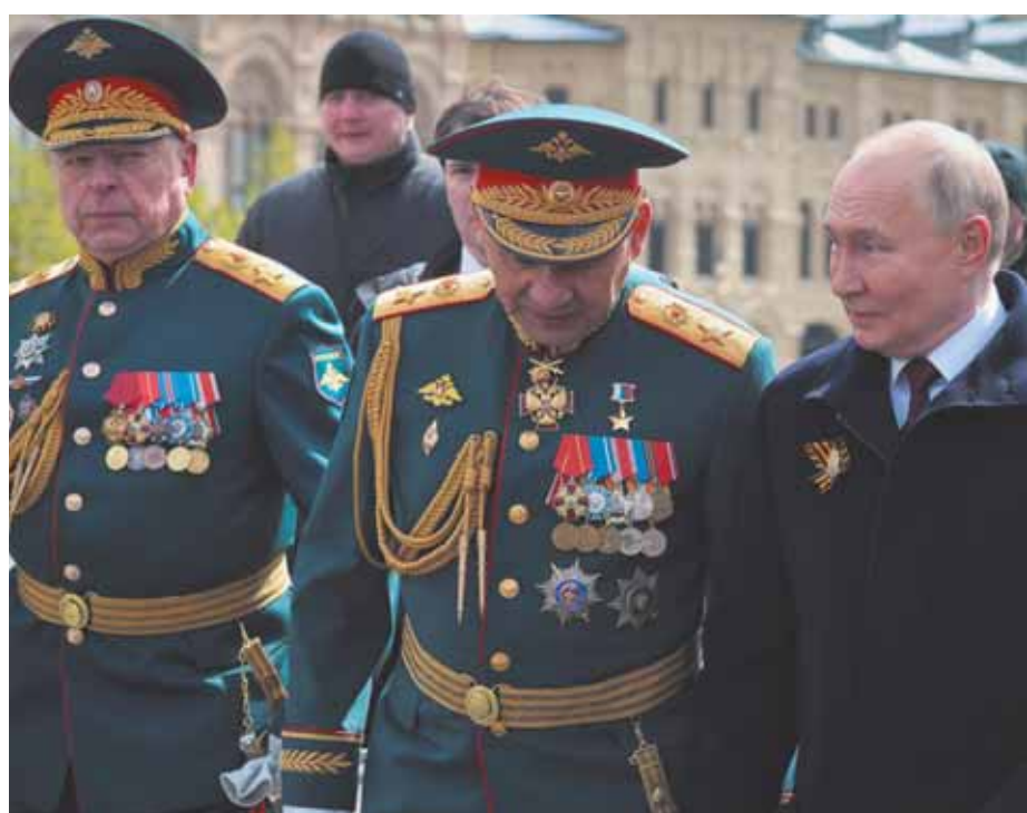
Commander-in-Chief of the Russian Ground Forces Oleg Salyukov, left, Russian Defense Minister Sergei Shoigu, centre, and Russian President Vladimir Putin leave Red Square, walk, after the Victory Day military parade in Moscow, Russia, Thursday, May 9, 2024, marking the 79th anniversary of the end of World War II.

Russia on Thursday wrapped itself in patriotic pageantry for Victory Day, as President Vladimir Putin celebrated the defeat of Nazi Germany in World War II by hailing his forces fighting in Ukraine and blasting the West for fueling conflicts around the world. Even though few veterans of what Russia calls the Great Patriotic War are still alive 79 years after Berlin fell to the Red Army, the victory remains the most important and widely revered symbol of Russia's prowess and a key element of national identity. Putin has turned Victory Day — the country's most important secular holiday — into a pillar of his nearly quarter-century in power and a justification of his military action in Ukraine. Two days after beginning his fifth term in office, he led the festivities across Russia that recall the nation's wartime sacrifice.