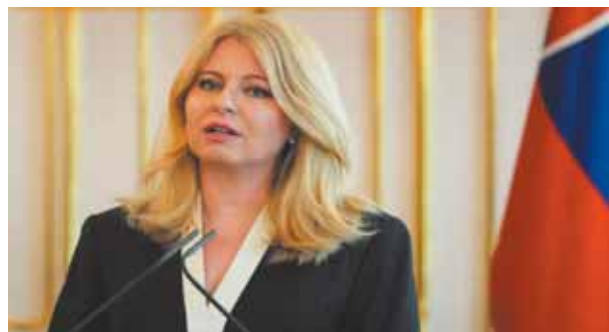
Slovakia's incumbent President Zuzana Caputova speaks during joint press statements with President elect Peter Pellegrini at the presidential palace in Bratislava, Slovakia, on Thursday. Slovak Prime Minister Robert Fico was in serious but stable condition Thursday, a hospital official said, after the populist leader was shot multiple times in an assassination attempt.

Slovak authorities charged a man Thursday with attempting to assassinate populist Prime Minister Robert Fico, saying the suspect acted alone in a politically motivated attack that laid bare the extreme polarization that has gripped the small central European country. Fico, 59, was in serious but stable condition a day after being shot multiple times in the stomach, a hospital official said. President-elect Peter Pellegrini said he spoke to Fico at the hospital but confirmed his condition "remains very serious." The attempted assassination has shocked the nation and reverberated across the continent weeks ahead of European elections. While President Zuzana Caputova called on everyone to take the opportunity to dial back the vitriol that has characterized the political debate, some government ministers took aim at Slovakia's media for contributing to the fractious atmosphere. Interior Minister Matus Sutaj Estok asked jour-