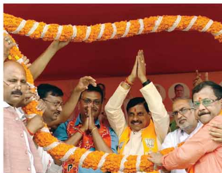
Madhya Pradesh Chief Minister Mohan Yadav during an election campaign for Lok Sabha elections in Jharkhand on Thursday.

2014, bombs used to explode anywhere in the country, but now it does not happen. Pakistan had committed a mistake once and was taught a lesson by entering the house twice. When the second vote was cast in 2019, Article 370 was removed from Kashmir, laws like triple talaq were implemented, Shri Ram temple was constructed and now Lord Shri Ram is smiling in the sanctum sanctorum. This time the vote has to be cast for the prosperity of the country as well as for Lord Krishna. Chief Minister Yadav said that Jharkhand is such a rich state that if its mineral wealth is properly utilized then this state can become the number one state in the world. This is the land of Lord Birsa Munda. Here there is a desire to break all the barriers and come among you.