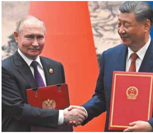
Chinese President Xi Jinping, right, and Russian President Vladimir Putin attend a signing ceremony in Beijing, China, on Thursday

Chinese President Xi Jinping on Thursday hinted at a political settlement to end the Ukraine war, saying he expects peace and stability will return to the European continent, shortly after his talks with Russian counterpart Vladimir Putin as the two leaders vowed to counter any attempt by the US to hinder their strategic ties. Putin received a grand welcome upon his arrival here earlier in the day on his first foreign visit after winning the fifth term in office in March for wide-ranging talks with Xi to reset the burgeoning China-Russia strategic ties for future. "China hopes that peace and stability will return to the European continent at an early date, and stands ready to play a constructive role to this end," Xi said at a joint press conference with Putin after their talks. A joint statement issued after Putin-Xi talks said that both sides believe that for "a sustainable settlement of the Ukrainian crisis, it is necessary to eliminate its root causes." In a veiled criticism of the US, which is pressuring Beijing to end its strategic ties with Russia, the joint statement said relations between China and Russia do not target any third countries, therefore they will counter any attempts to hinder such cooperation. "The two sides note that the relationship between Russia and China has progressed to a more advanced interstate cooperation compared to the mili-