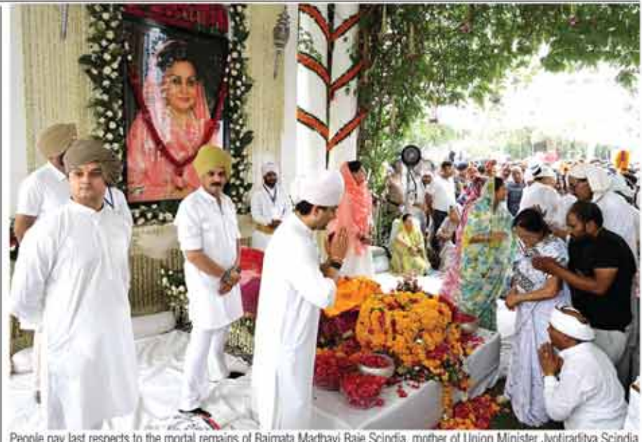
People pay last respects to the mortal remains of Rajmata Madhavi Raju Scindia, mother of Union Minister Jyotiraditya Scindia at Jai Vilas Palace in Gwalior, Madhya Pradesh on Thursday.

Madhya Pradesh, 100 percent of the calls coming in at 1930 are being picked up, which shows the readiness of the police. DGP Sudhir Kumar Saxena told about the challenges faced by the police to control cyber crime. He said that the police face multiple challenges in the field of cyber. These challenges include adoption of new methods by criminals, high number of cyber crimes, geographical problems like accused committing crime in one district and fleeing to another district, lack of resources to control cyber crime, special training and district This includes lack of experts at the level etc. Apart from these, the biggest challenge is to know how help can be provided to the victim quickly. It is necessary to overcome these challenges. He said that lack of knowledge among the victims is also a big problem, even many policemen do not fully know what to do to control cyber crime, for this it is necessary that all the officers stay on the same platform and know. What to do actively? He said that it is necessary to take such training to the lower level by all the SPs of the district so that the common people suffering from cyber crime can feel relieved.