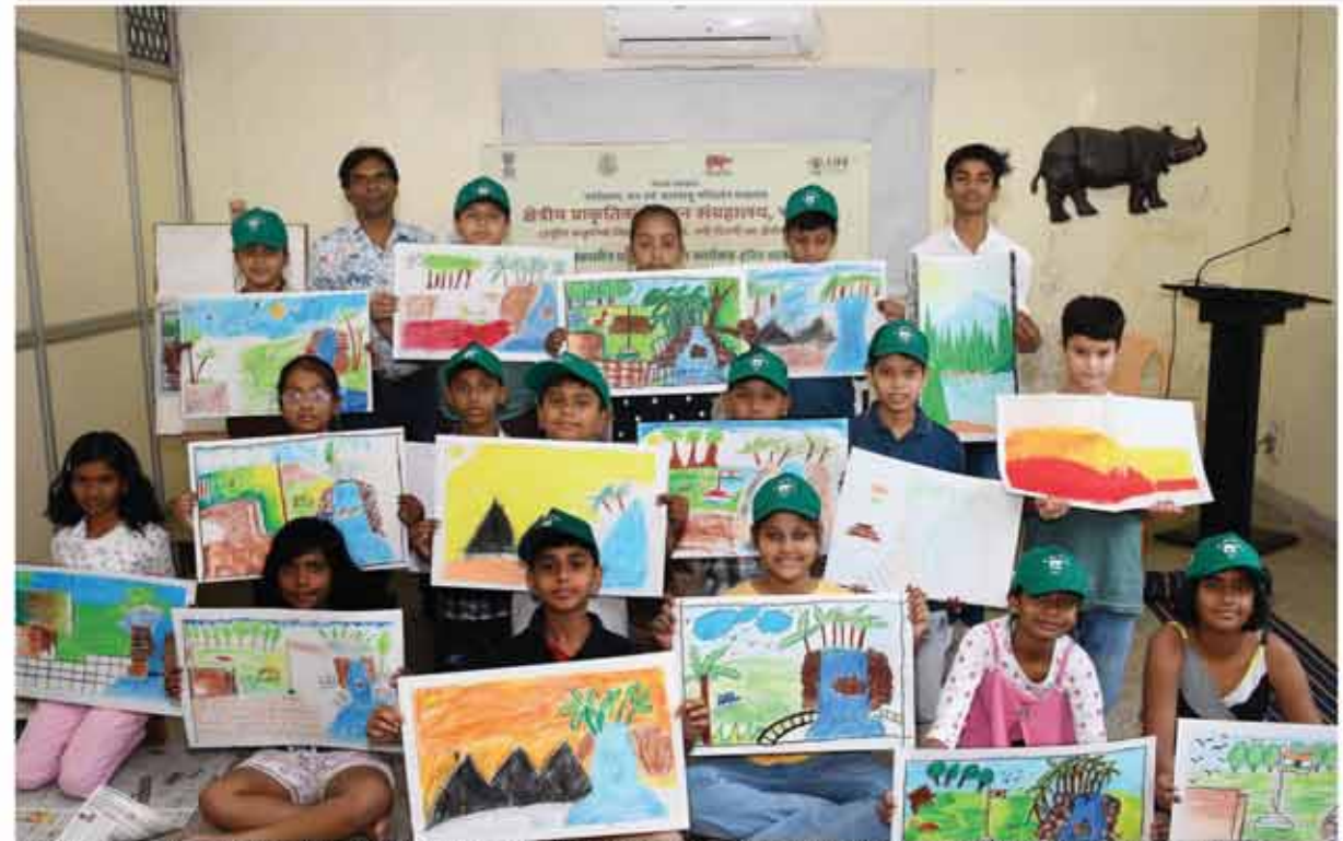
Students take part in a painting workshop during the Summer Nature Study Programme, at the Regional Museum of Natural History in Bhopal on Thursday.

monsoon. After this, La Nina conditions are likely to develop in the second half of the monsoon. Hail-rain alert has been issued in many districts of Madhya Pradesh in the next few hours. The Meteorological Department has predicted the possibility of lightning and winds blowing at a speed of 70 kilometers per hour. The weather is expected to change in more than 12 districts including Indore, Ujjain and Ratlam. According to the Meteorological Department, lightning may occur in Betul, South Jabalpur, Seoni, Chhindwara, Pandhurna and Mandla. The weather may also change in Burhanpur, Narmadapuram's Pachmarhi, Raisen, Indore, Dhar, Barwani, South Khargone, Ujjain, Ratlam, Jabua, South Narsinghpur, Balaghat and Dindori districts. Earlier, it rained in Ratlam on Wednesday.