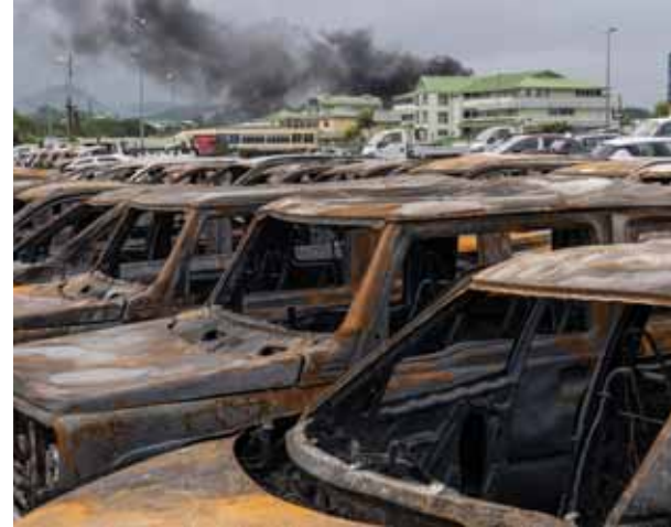
Burnt cars are lined up after unrest in Noumea, New Caledonia, Wednesday. France has imposed a state of emergency in the French Pacific territory of New Caledonia