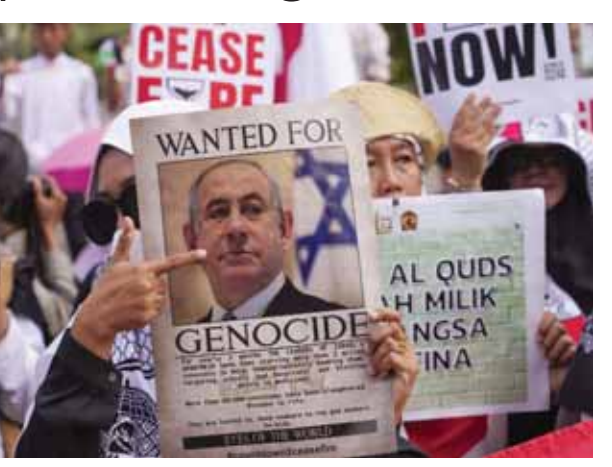
A protester holds a poster of Israeli Prime Minister Benjamin Netanyahu during a rally commemorating the 76th anniversary of the mass expulsion of the Palestinians from what is now Israel in 1948, often called the "Nakba" or Arabic for catastrophe, outside the U.S. Embassy in Jakarta, Indonesia on Friday.

A protester shouting "Liars" briefly interrupted Kaplan-