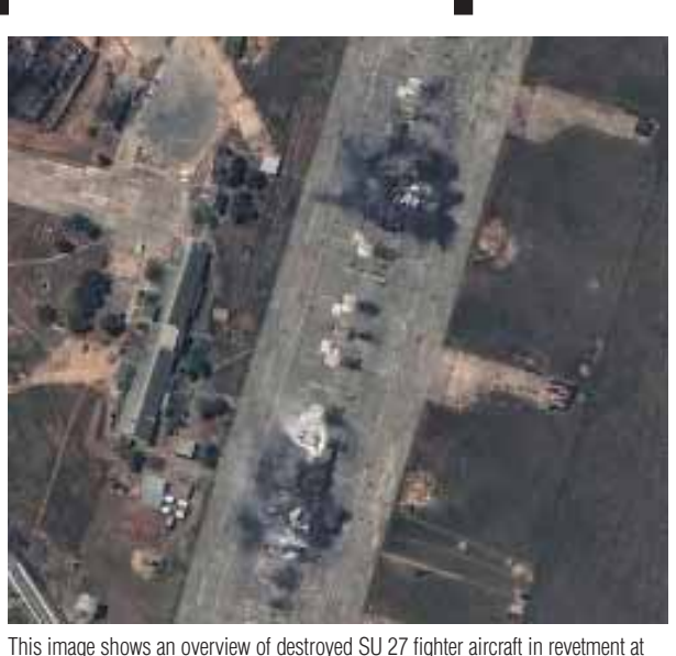
Belbek air base in Crimea on Thursday.

By starting the new offensive, Russian troops "expanded the zone of active hostilities by almost 70 kilometers" (about 45 miles), in an effort to force Ukraine to spread its forces and use reserve troops, Ukraine's military chief, Col. Gen. Oleksandr Syrskyi, said Friday. In the Kharkiv region, Russian forces have advanced 10 kilo-