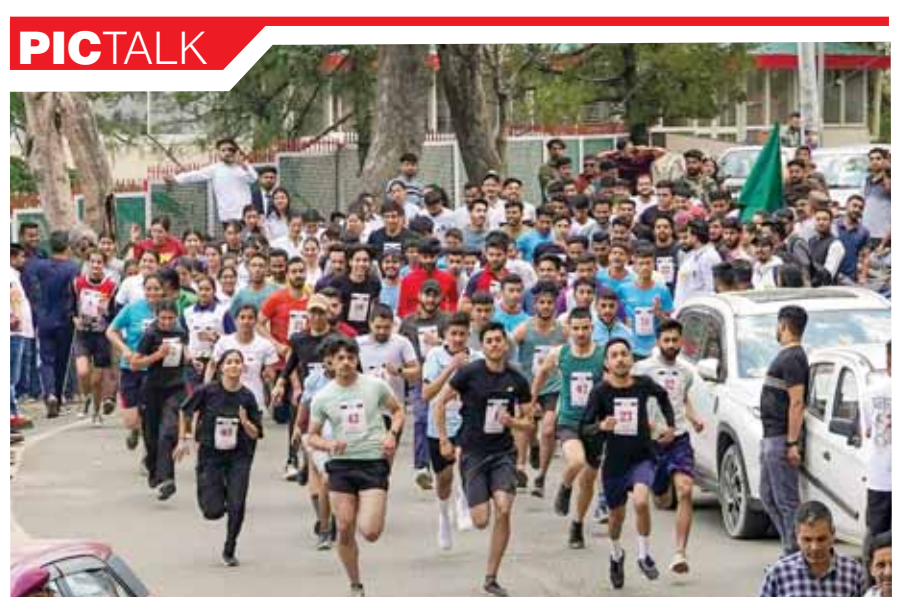
Participants at the 'Run For Vote' marathon for the Lok Sabha election awareness, in Shimla

To mitigate the adverse effects of the IMD forecast, it is essential to launch comprehensive public awareness campaigns to educate residents on the risks and preventive measures of heatwaves. As a thumb rule, those living on pavements and in shanties are at bigger health risk. Establishing cooling centres with air conditioning, fans and hydration facilities will provide critical relief to the vulnerable population. Encouraging people to stay hydrated and seek shelter in cool, shaded areas during peak heat hours is vital. The old system of piyaus is long gone; instead, now only bottled water is available. The Government must set up water kiosks so that people can get free, clean drinking water on the go. Additionally, urban planning strategies that incorporate green spaces, tree cover and reflective surfaces can mitigate the urban heat island effect and enhance thermal comfort in urban environments. During summers, water scarcity and power cuts turn things worse. The authorities must ensure that load shedding is kept to a minimum and clean drinking water is available; otherwise the chances of outbreak of waterborne diseases are high. As northwest India braces for a severe heatwave, prioritising public health and safety is paramount. The IMD forecast serves as a crucial reminder to remain vigilant, stay informed and make concerted efforts to mitigate the risks. We have braved many adversities; this too will pass!