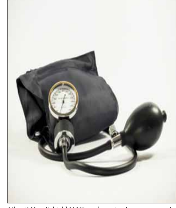
Lilavati Hospital told IANS. hypertension causes scarring of kidney tissue kidney Unmanaged

"Uncontrolled hypertension may narrow, harden or weaken the arteries around the kidneys disturbing the kidney's process of filtering blood, regulating fluid and electrolytes in the body. Hypertension damages the blood vessels and filters in the kidney, and it is challenging to remove waste from the body," L H Suratkal, Nephrologist, at