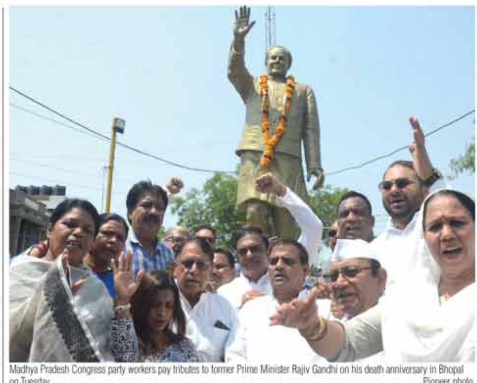
Madhya Pradesh Congress party workers pay tributes to former Prime Minister Rajiv Gandhi on his death anniversary in Bhopal on Tuesday.

at this speed. Which is being considered a big success. Bhopal Metro has a 6.22 km long priority corridor. There are plans to start the commercial run in the next few months. After this, when you enter the station to travel in the metro train, you will see the same picture which is inside an airport. There will also be a food plaza and some shops inside. From where you will be able to buy food and other essential items. Metro Rail Corporation has also started preparations for this. Plans are being prepared through experts. Similar plans will be made for Indore metro stations also. The priority corridor of Metro is between Subhash Nagar to AIIMS. Five stations - RKMP, Subhash Nagar, Central School, in front of DB and MP Nagar - have been completed up to 90 percent.