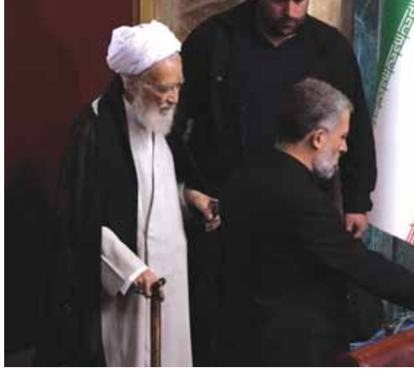
Ayatollah Mohammad Ali Mowahedi Kermani arrives to attend the first session of Assembly of Experts after an election that decided the new assembly, in Tehran, Iran, Tuesday. Under Iranian constitution the 86-member all-cleric assembly has the right to monitor the performance of supreme leader, and choosing or dismissing him. Mowahedi Kermani was picked Tuesday as head of the assembly.

On Wednesday, a funeral presided over by Khamenei will then turn into a procession