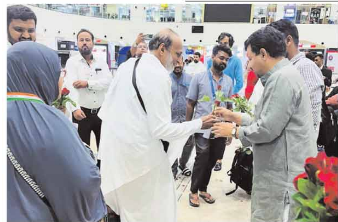
Haj pilgrims being given a warm send off by their relatives and family members before they leave for an annual Hajj journey to Mecca shrine, at Raja Bhoj Airport in Bhopal on Tuesday.