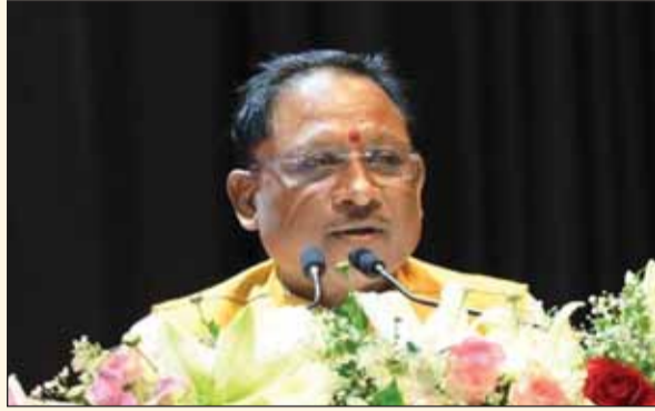
will then be the second largest steel producer in the

the state contains minerals like iron ore, lime stone, bauxite and tin. The contribution of state in extracting mineral resources was 21.09 per cent, he said, adding that the state mines have 17.61 per cent of iron in the country, 11.70 lime stone, 3.67 per cent bauxite and cent percent tin. "There is favourable atmosphere for establishing industries in Chhattisgarh and soon we will achieve the target of producing 30 crore tonne of steel per year. We