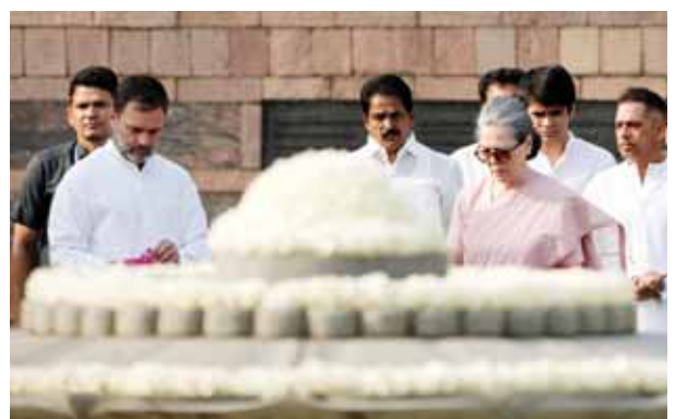
Congress leaders Sonia Gandhi and Rahul Gandhi pay tributes to former Prime Minister Rajiv Gandhi on his death anniversary at Veer Bhumi, in New Delhi, on Tuesday