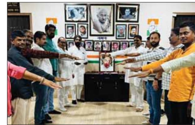
organised at the block and district levels.

The Congress in Chhattisgarh on Tuesday observed the 34th death anniversary of former Prime Minister Rajiv Gandhi as Anti-Terrorism Day. Congress leaders led by PCC chief Deepak Bajji paid tribute to the late Prime Minister at Rajiv Bhawan. A Congress spokesperson said that such programmes were also