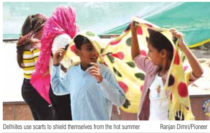
Delhiites use scarves to shield themselves from the hot summer

The intense heatwave is playing a spoiler for the rallies and roadshows of top political leaders cutting across party lines. The BJP and its star campaigners are holding rallies and roadshows in the evening. The AAP convener