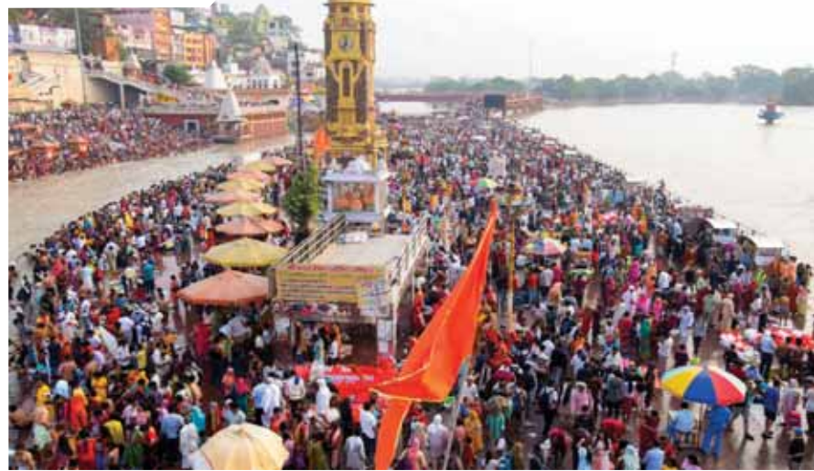
Devotees at Har Ki Pauri on the occasion of Buddha Purnima, in Haridwar