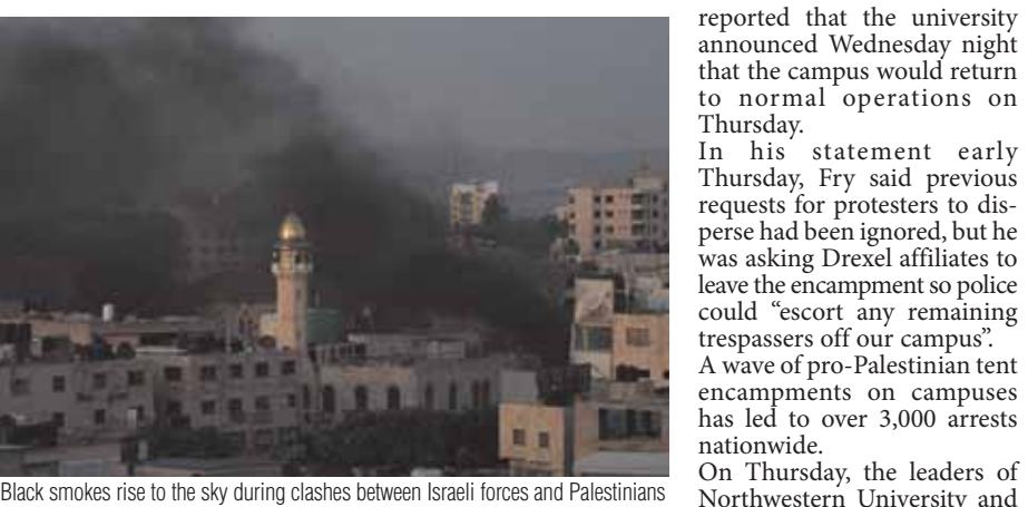
Black smoke rises to the sky during clashes between Israeli forces and Palestinian demonstrators in the West Bank city of Jenin, Wednesday.