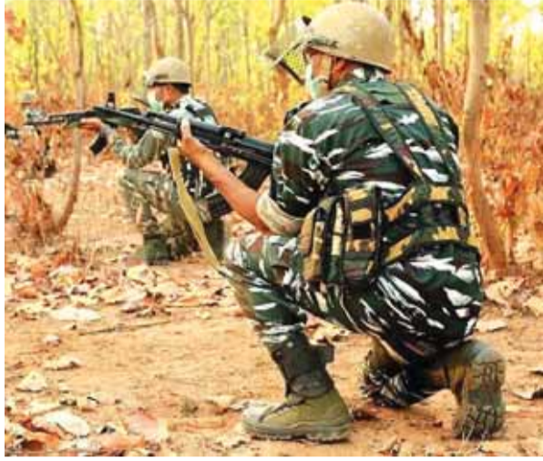
Indravati Area Committee and Platoon Number 16.

The District Reserve Guard from Dantewada, Narayanpur and Bastar districts, Bastar Fighters and Special Task Force – all units of the state police – launched the operation on Tuesday based on the inputs about the presence of Maoist cadres of