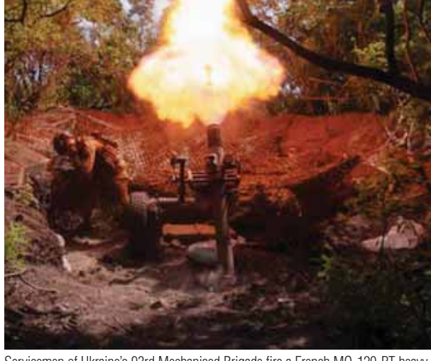
Servicemen of Ukraine's 93rd Mechanised Brigade fire a French MO-120-RT heavy mortar at the Russian forces on the front line near the city of Bahmut in Ukraine's Donetsk region on Wednesday.