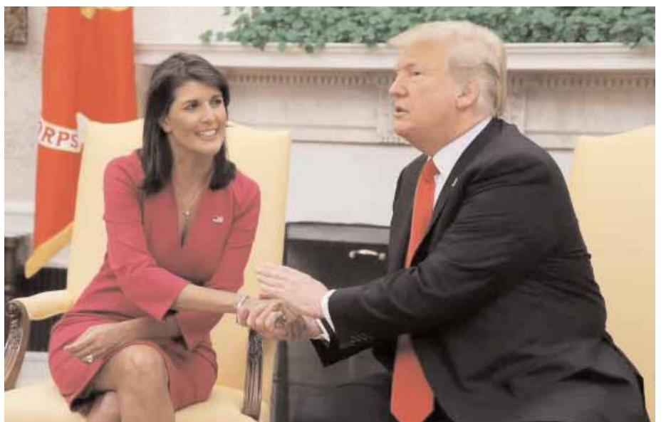
Nikki Haley and Donald Trump in the Oval Office in 2018. File photo

PTI ■ WASHINGTON Indian-American former presidential hopeful Nikki Haley has said that she will vote for her ex-opponent and boss Donald Trump in the November US election, breaking her silence on the matter since exiting the Republican presidential primary more than two months ago. Haley, 52, however, stopped short of an official endorsement. Haley, who once served as Trump's United Nations ambassador, was the last of his major rivals to drop out of the party primary contest, in early March. "I will be voting for Trump," Haley said on Wednesday in response to a question during her appearance at the Hudson Institute, a top conservative think-tank in the American Capital, as she delivered a speech on national security and foreign policy. "As a voter, I put my priorities on a president who's going to have the backs of our allies and hold our enemies to account, who would secure the border,