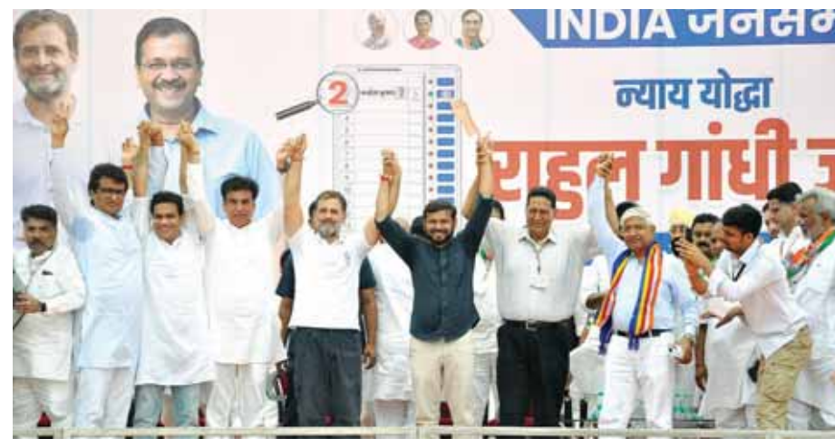
Congress leader Rahul Gandhi with party leader and INDIA Bloc Lok Sabha candidate from North East Delhi constituency Kanhaiya Kumar during a public meeting at Dilshad Garden in New Delhi on Thursday

Just days before the Lok Sabha elections in Delhi, Congress leader Rahul Gandhi rode the Delhi Metro on Thursday to connect with voters. Congress candidate from North East Delhi, Kanhaiya Kumar, shared photos of Rahul interacting and posing with passengers. En route to a rally in Mangolpuri with Kumar on the last day of campaigning, Rahul engaged with commuters. Delhi will vote on May 25 under Phase VI.