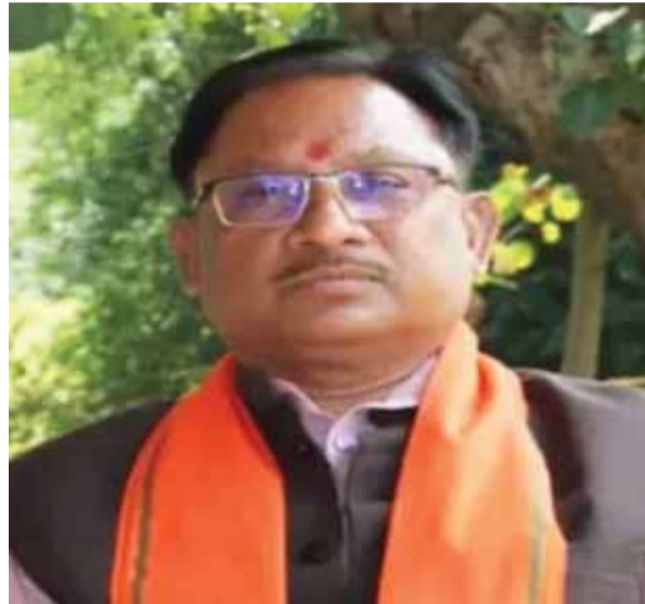
the West Bengal government after 2010

Notably, the Calcutta High Court has cancelled all OBC certificates issued by