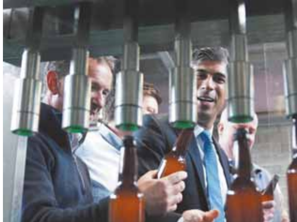
Britain's Prime Minister Rishi Sunak, centre, watch beer being bottled at the Vale of Glamorgan Brewery, in Barry, south Wales, while on the General Election campaign trail, Thursday.