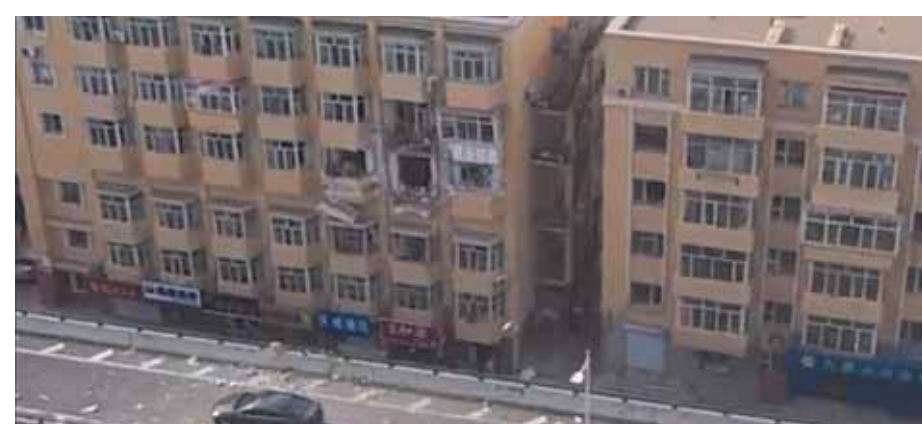
least one person being carted away by first responders into an ambulance, and the streets

Beijing (AP): An explosion at an apartment building in northeastern China killed one person and injured at least three others Thursday, state media reported. Parts of the five-story apartment building in Harbin were damaged, with one apartment's balcony completely blown off, videos on social media showed. Officials told local media that the explosion was likely from a natural gas tank. One woman died of her injuries, according to Jimu News, a state-backed media outlet. The three others were taken to the hospital for their injuries. Videos online also showed at