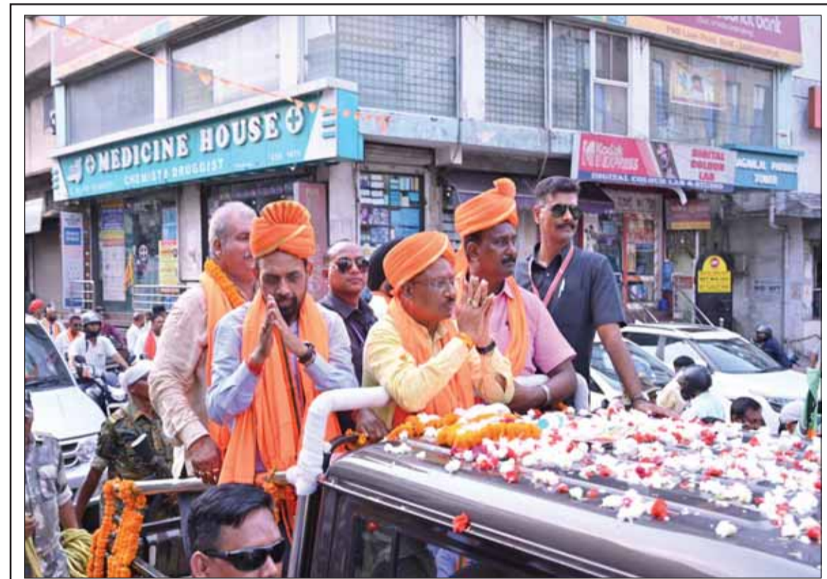
Chhattisgarh Chief Minister Vishnu Deo Sai on Thursday conducted a road show in Jamshedpur in Jharkhand and sought support for the BJP Lok Sabha candidate.

There are a total 509 degrees and diplomas proposed to be distributed in the ceremony, he said. Different committees have been formed to finalize the preparations.