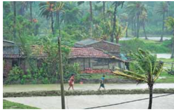
Villagers at a flooded area following the landfall of Cyclone Remal in South 24 Parganas district on Monday

At least two persons were killed and several others injured as severe cyclonic storm Remal hit Bengal coasts on Sunday night, sources at State secretariat Nabanna said, adding the NDRF and SDRF teams were working overtime to restore normalcy in affected areas most of which lie in the vicinity of Sunderbans. Though the speed of the storm reduced to a great degree by Monday morning, incessant rains continued to lash eight districts of South Bengal nearly throwing life out of gear. The first death occurred after a wall collapsed under the impact of the rains at Bibir Bagan near Park Circus and Entally area of Kolkata, police said. Another person died when a tree collapsed under the impact of driving rains and gusting winds at 135 kmph at Mousuni Islands at the mouth of Bay of Bengal off Sunderbans. At least eight other persons were injured at various places in Kolkata and Kakkdwip, sources said. Severe cyclone Remal made landfall between Sagar Islands in Bengal and Khepupara in neighbouring Bangladesh, sources said on Monday. Rivers surrounding most of the riverine islands — like Jharkhali, Geokhali,