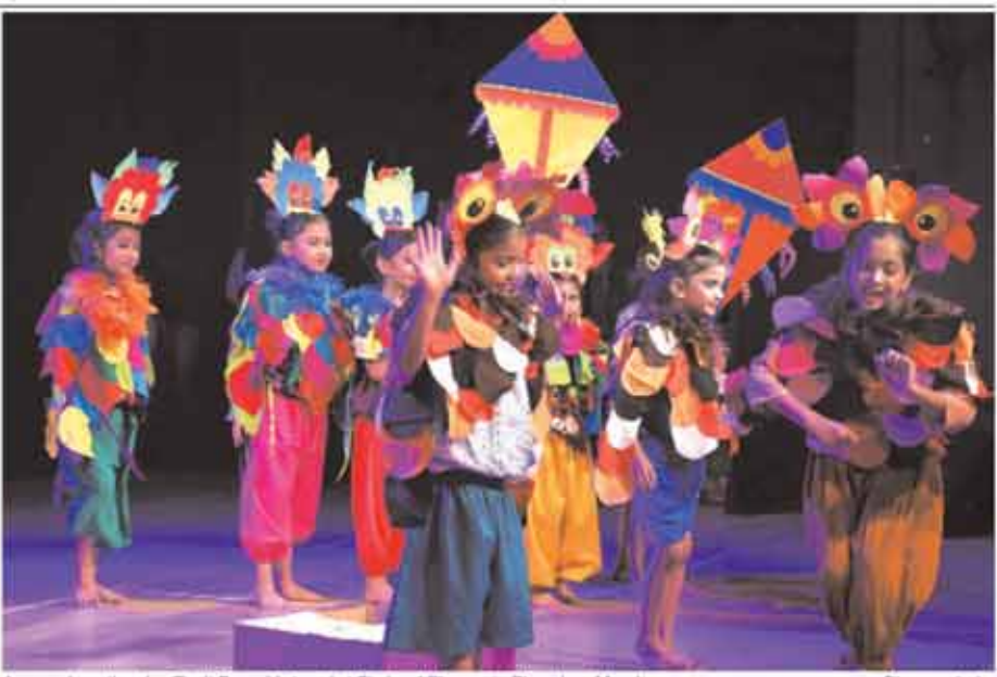
A scene from the play 'Peeli Poonchi' staged at Shaheed Bhawan in Bhopal on Monday.