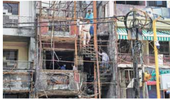
He declared that no culprit will be spared, irrespective of their status and announced stringent new safety regulations for nursing homes over nine metres tall, mandating water sprinklers