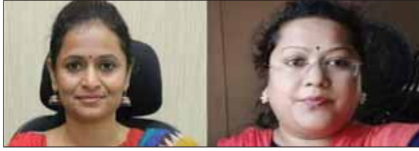
related to the alleged multi-crore coal scam based on a complaint by the Enforcement Directorate.

The two and eight others were jailed in the alleged scam. In January 2024, the ACB/EOW named 36 persons including two former cabinet ministers in a FIR