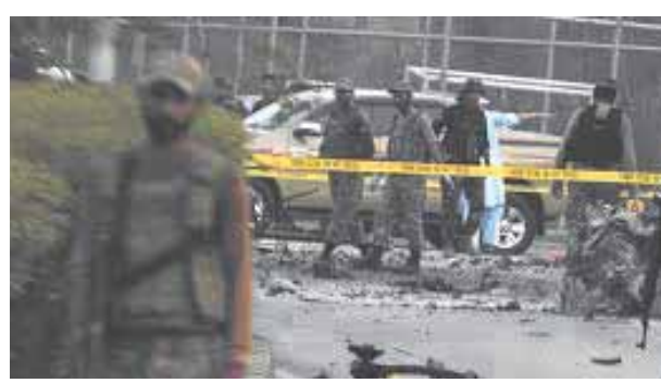
A scene of destruction in Khyber Pakhtunkhwa, showing damaged vehicles and debris.

The army stated that an intelligence-based operation was conducted on Sunday in the Hassan Khel area near Peshawar in which six terrorists were successfully neutralised by the security forces and multiple hideouts were busted. However, an officer and a soldier were killed in the