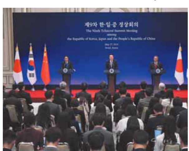
South Korean President Yoon Suk Yeol, center, speaks as Japanese Prime Minister Fumio Kishida, left, and Chinese Premier Li Qiang listen during a joint news conference in Seoul, South Korea Monday.

After meeting with Li, Kishida told reporters that he expressed serious concerns about the