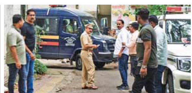
Two doctors of the Sassoon General Hospital being taken into police custody after their arrest for alleged manipulation of blood samples and destruction of evidence in the case of a car accident involving a 17-year-old boy in Pune

47.99 per cent in 1996 and 29.93 per cent voter turnout in 1989. Notably, Baramulla had witnessed 5.48 per cent polling in 1989; 46.65 per cent in 1996; 41.94 per cent in 1998 and 34.6 per cent in 2019. Anantnag witnessed voting at 8.98 per cent in 2019 and around 5 per cent in 1989. According to EC, more young people have asserted their faith and embraced democracy in a big way. Another interesting perspective is the electors in the age group of 18-59 years form the major part of electors in the UT, it underlined. As per data, Baramulla witnessed voter turnout (between age group of 18 and 39) at 56.02 per cent voting, Srinagar at 48.57 per cent; Anantnag-Rajouri at 54.41 per cent; Udhampur 53.57 per cent and Jammu at 47.66 per cent.