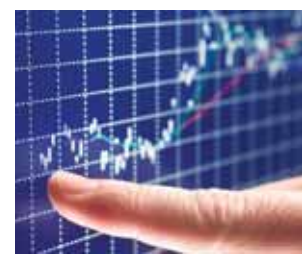
case, bid prices like Rs 49.85 or Rs 49.92 are not allowed, as

Tick size is the minimum price increment between consecutive bid (buy) and offer (sell) prices. A smaller tick size allows for finer price adjustments and potentially more precise price discovery. For instance, if a stock has a tick size of Rs 0.10 and the last traded price (LTP) was Rs 50, the next possible bid prices would be Rs 49.90, Rs 49.80, Rs 49.70 and so on. In this