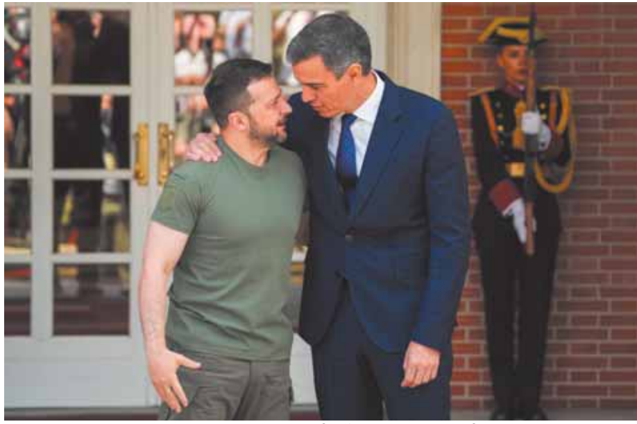
Ukrainian President Volodymyr Zelenskyy, left, is welcomed by Spain's Prime Minister Pedro Sanchez at the Moncloa palace in Madrid on Monday.

Spain's King Felipe VI met Zelenskyy at the capital's Barajas airport. The Ukrainian leader was due to hold talks with Prime Minister Pedro Sánchez about what local media reported as a planned 1.1 billion euros ($1.2 billion) agreement for Spain to supply Ukraine with more weapons. Zelenskyy had been due to visit Spain earlier this month but he postponed all his foreign trips after the Kremlin's forces launched a cross-border offensive in the northeastern Kharkiv region and left Ukrainian troops reeling. That push has further strained Ukraine's already depleted army, which in recent months has been fighting Russia's intense drive deeper into the partially occupied eastern