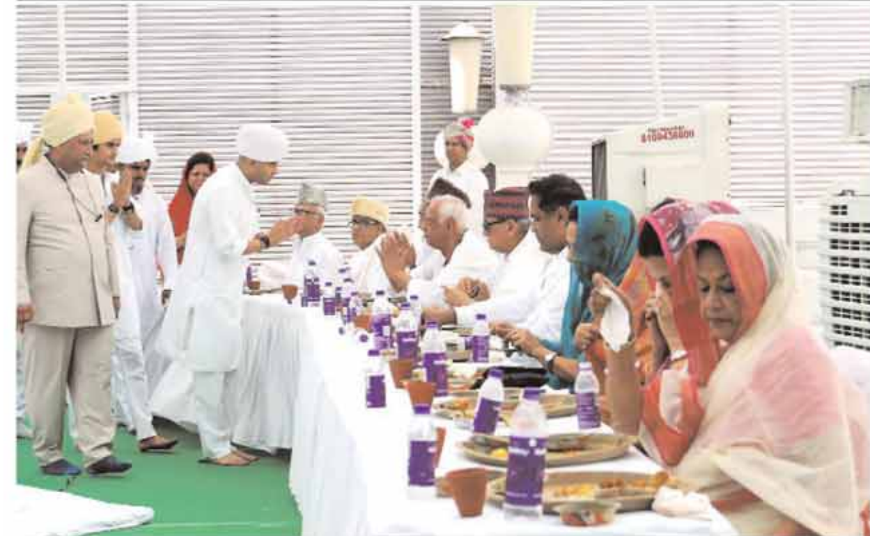
Union Minister Jyotiraditya Scindia attends the invited guests during the Terahvin programme of his mother Rajmata Madhavi Raju Scindia, at Jai Vilas Palace in Gwalior, Madhya Pradesh on Monday.

revealed. However, the postal ballot of Sehore Vis will be counted in Bhopal only. The officers and employees engaged in counting will reach the old jail at 6 in the morning. Counting of the first postal ballot will begin at 8 in the morning on the RO table. Observers will keep an eye on the count. They will mention everything related to counting in every report. Apart from EVMs, 9 tables will be installed for each postal ballot. The first round can be completed by 9 o'clock. After that there will be a round every half hour. The situation will be clear by 6 pm. Counting of votes from EVMs will start after 30 minutes from the scheduled time for counting i.e. from 8.30 am. The results of the first round can be known in 30 minutes.