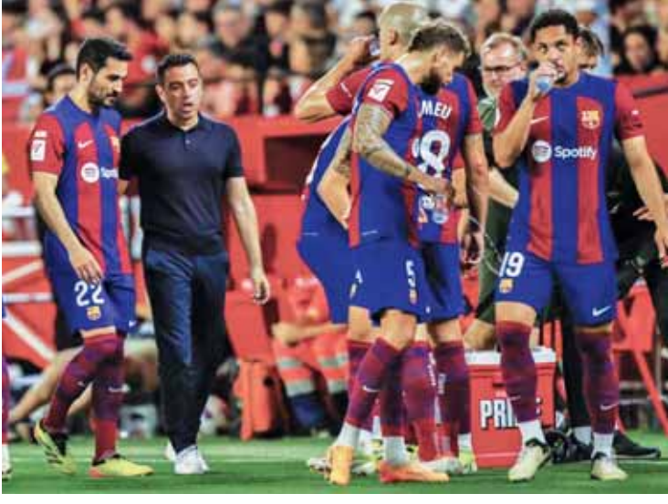
Madrid. "Those who made the decision need to explain it," said the 44-year-old Xavi, who plans to take a break from

Barcelona president Joan Laporta had publicly celebrated Xavi's commitment to stay at that time. But last week the president was reportedly unhappy when the head coach spoke openly about how the club's poor finances would impede it from competing with fierce rival Real