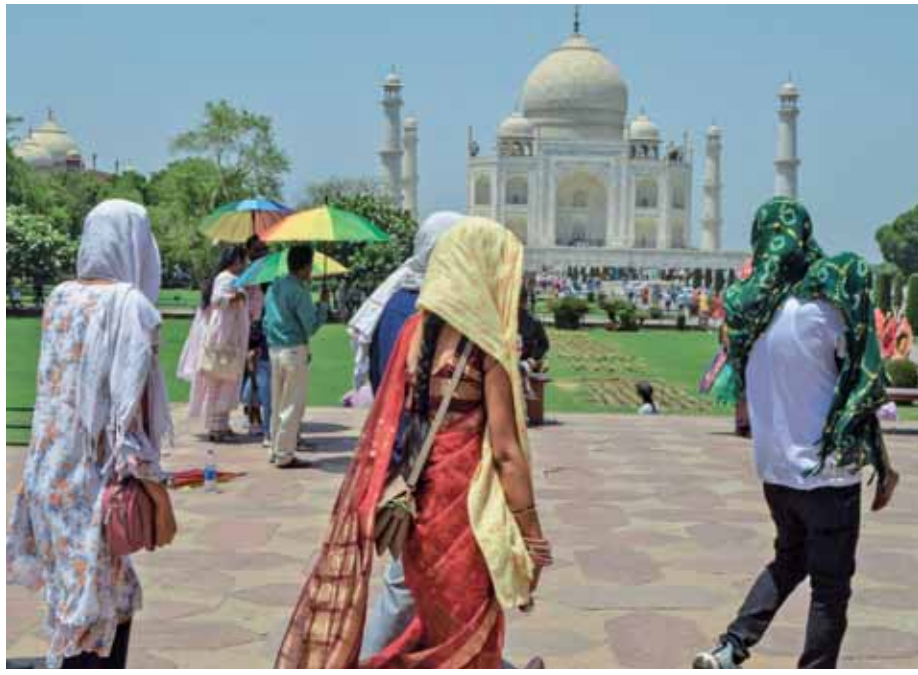
Tourists at the Taj Mahal on a hot summer day in Agra

With temperatures soaring as high as 47 degrees Celsius in some areas of the national Capital, Delhi, and in North West States like Rajasthan, Punjab, Chandigarh, and Haryana, as well as in Central parts of the country, people are grappling with intense heatwaves that have made outdoor activities nearly impossible. This challenging situation is expected to persist for at least the next three days, with the weather department issuing a red alert for heatwaves in several northern Indian cities, including Rajasthan. The Union Health Ministry has already advised employers to take essential heat safety measures at the workplace. "From providing hydration stations to scheduling outdoor tasks during cooler hours, let's ensure our workers stay cool, healthy, and productive," the Ministry said in a post on social media platform X. It also advised employers to train workers to recognise symptoms of heat-related illness. Relief from the blistering weather is anticipated from June 1, thanks to a fresh western disturbance, according to forecasts by the