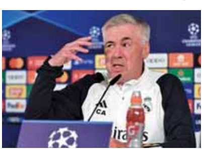
available for Saturday's final in London. The illness surely doesn't help Lunin's chances, though, and many had already expected Ancelotti to go with the more experienced Courtois despite his lack of minutes this season. Courtois ruptured a left-knee ligament in August, just two days before the start of the season. The 32-year-old Belgian then also ruptured the meniscus in his right knee in March, when he was close to making a comeback. He was sidelined until the beginning of this month, when he started in a 3-0 win

Lunin was nursing a fever and was the only Madrid player who didn't train on Monday as Madrid began its final week of preparations. But Ancelotti said the 25-year-old Ukrainian was expected to be