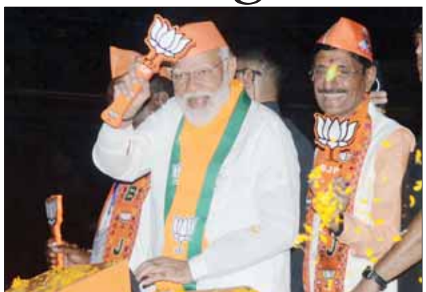
Prime Minister Narendra Modi during a road show for Lok Sabha elections, in Ranchi on Friday.

The Prime Minister was welcomed with traditional dance songs and drums at 15 places, while the people showered flowers on the Prime Minister competing with each other to take self-