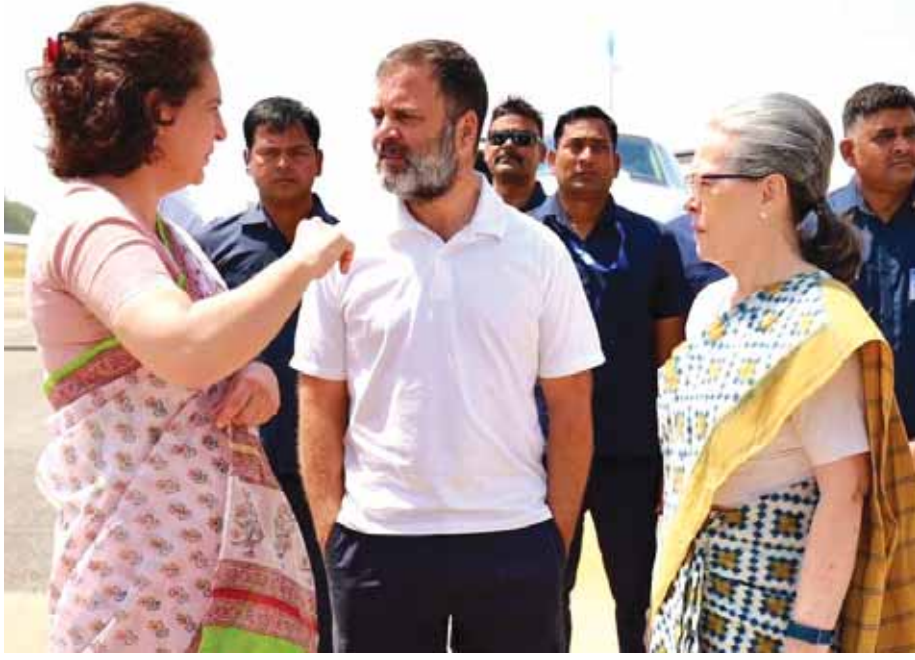
Congress leaders Rahul Gandhi, Sonia Gandhi and Priyanka Gandhi Vadra upon their arrival before the nomination filing of Rahul ahead of the third phase of the Lok Sabha elections, in Raebareli

On deciding to contest from Raebareli Lok Sabha constituency, former Congress president Rahul Gandhi apparently made a calculated risk to solve several anomalies within and outside the party and hence retaining the legacy of Gandhi-Nehru family.