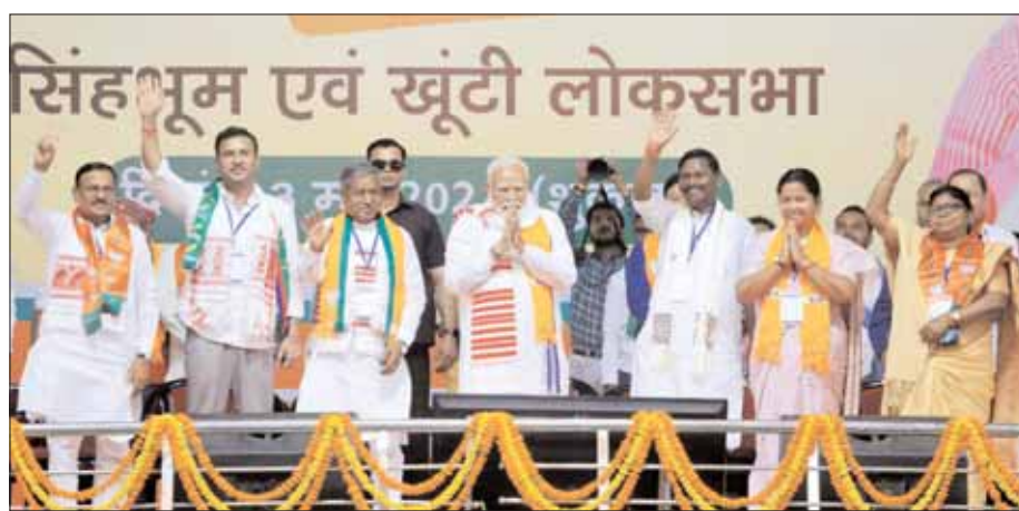
Prime Minister Narendra Modi, Jharkhand BJP Chief-cum former chief Minister Babulal Marandi, AJSU Party Chief Sudesh Kumar Mahto, Union Minister-cum Lok Sabha candidate for Khunti constituency Arjun Munda, Singhbhum Lok Sabha candidate Geta Koda along with others during an election campaign rally, in West Singhbhum on Friday.

big land scam has been done by JMM people. Congress and JMM together have hurt the honor and dignity of Jharkhand. Comparing Congress with BJP, PM Modi remarked, "Congress wanted to monopolize the credit for independence to one family. BJP has given a new identity to Bhagwan Birsa Munda's