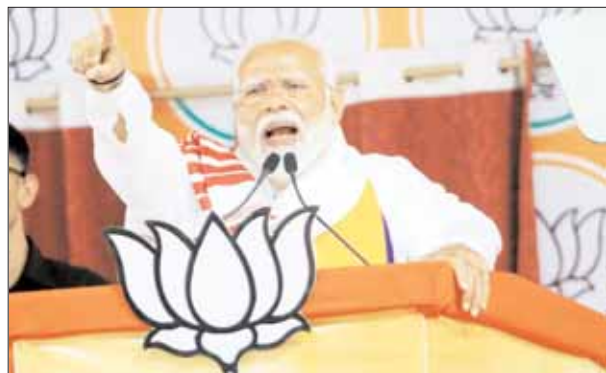
Prime Minister Narendra Modi addresses a gathering during an election campaign rally, in West Singhbhum on Friday.