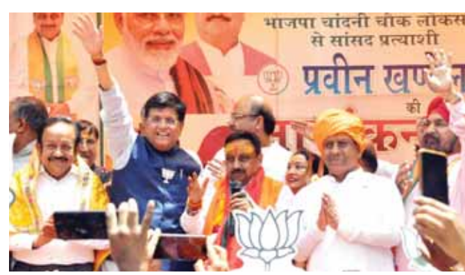
Union Minister Piyush Goyal, former Union Minister and BJP leader Harsh Vardhan with others during a 'Jansabha' in support of the party candidate from Chandni Chowk constituency Praveen Khandelwal, ahead of the third phase of Lok Sabha elections, at Chandni Chowk, in New Delhi, on Friday

works not for individuals but for organisational development, and each candidate is a symbol of the organisation. We will ensure the victory of BJP candidate Khandelwal by ensuring maximum voter turnout on election day." This support adds a stark contrast to the infighting between the Congress in the national Capital, which is now out in the open with the exit of former Delhi Congress Chief Arvinder Singh Lovely. Slamming the INDIA Bloc, Goyal said, "The Congress and the AAP abuse each other in Punjab while they have seat-sharing arrangements in other States. The people of Delhi are intelligent enough not to be misled by such tactics," adding that the grand old