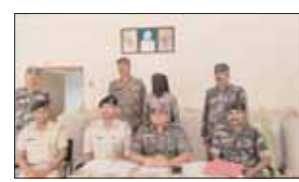
Police officers briefing mediapersons today

The 541 kgs of poppy straw were stuffed in 18 bags. One person identified as