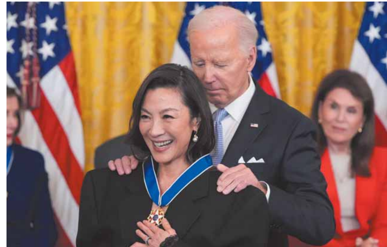
President Joe Biden awards the nation's highest civilian honor, the Presidential Medal of Freedom, to Michelle Yeoh during a ceremony in the East Room of the White House, on Friday in Washington.

Palestinian prisoners in Israeli jails. Hamas has said it will send a delegation to Cairo in the coming days for further discussions on the offer, though it has not specified when. Israel, and its allies, have sought to increase pressure on Hamas on the hostage negotiation. Signaling that Israel continues to move forward with its planning for a Rafah operation could be a tactic to nudge the militants to finalise the deal. Netanyahu said earlier this week that Israeli forces would enter Rafah, which Israel says is Hamas' last stronghold, regardless of whether a truce-for-hostages deal is struck. His comments appeared to be meant to appease his nationalist governing partners, and it was not clear whether they would have any bearing on any emerging deal with Hamas. US Secretary of State Antony Blinken visited the region, including Israel, this week and called the latest proposal "extraordinarily generous" and said "the time to act is now."