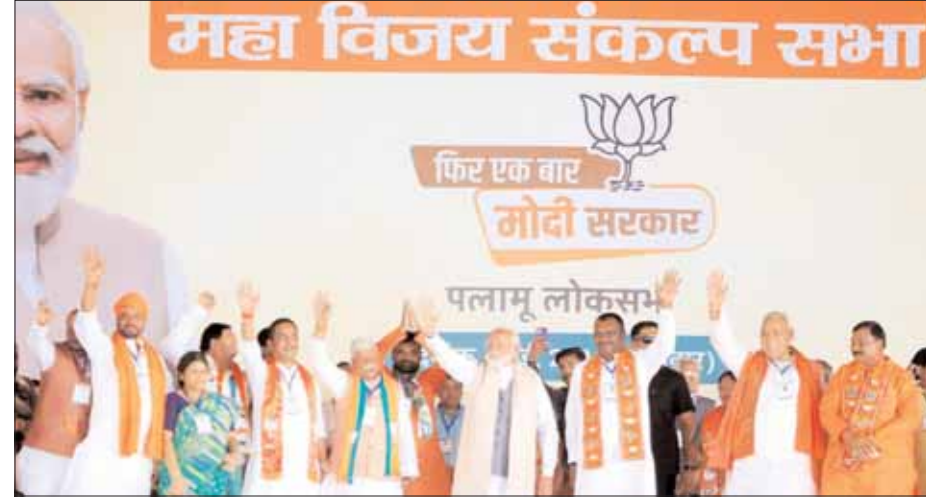
Prime Minister Narendra Modi waves a gathering during an election rally campaign in Sisai, Gumla district on Saturday.

ensuring national security. "This is new India. It enters the house and kills. Surgical strikes and air strikes shook Pakistan. Earlier it used to happen every month when the youth of Jharkhand used to get martyred. They used to come wrapped in the tricolour. Now