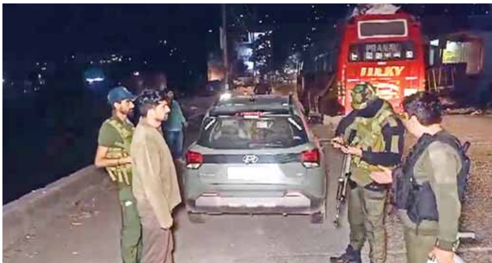
Security personnel stand guard after a militant attack on army vehicles, in Poonch district on Saturday. A search operation is going on in the woods amid inputs about the presence of the militants

Five Indian Army personnel including two officers were "killed in action" in the Kalakote forest area of Rajouri on November 22. Meanwhile, the audacious strike has once again raised question marks as none of the terrorists