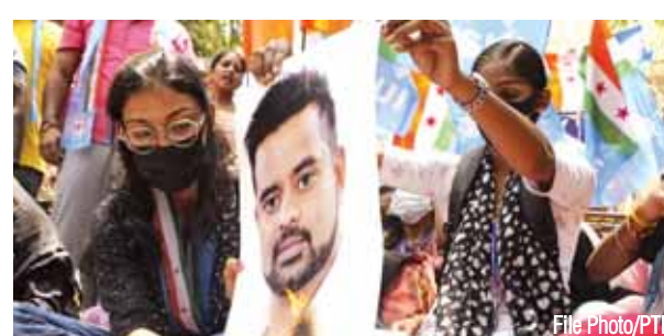
Gowda was also in the house even as high drama ensued outside the gates. Revanna has been taken to the SIT office, in the CID headquarters in the city. Revanna has been arrested in an abduction case booked against him in KR. Nagar Police Station, Mysuru

High drama ensued as SIT teams, who had intelligence that MLA Revanna was at Gowda's residence, reached former Prime Minister's residence. The gates were not opened for them and even as the team was contemplating breaking in when Revanna opened the door of the house and walked out and gave himself up. Deve