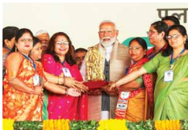
Prime Minister Narendra Modi being felicitated during a public meeting for Lok Sabha polls, in Palamu, on Saturday

The continuous jibe by Prime Minister Narendra Modi on Congress leader Rahul Gandhi by terming him "shehzada" (prince) reached a new zenith on Saturday with the latter's sibling and a general secretary in the grand old party, Priyanka Gandhi, calling the PM as "Shehanshah" (monarch). At the Lok Sabha poll rallies in Bihar and Jharkhand, Modi also used the term shehzada along with Rahul for the RJD leader and former Deputy Chief Minister Tejashwi Yadav.