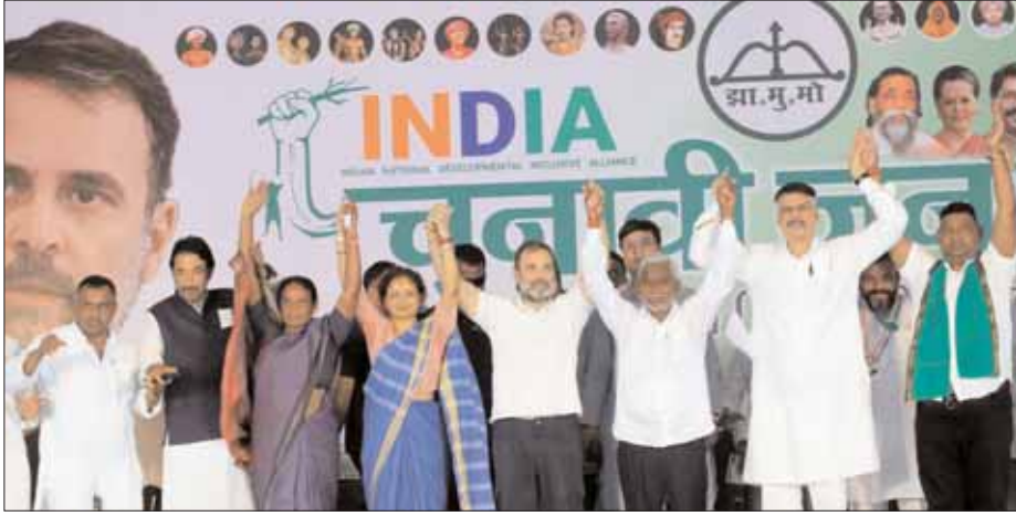
Congress leader Rahul Gandhi with Chief Minister Champai Soren, JMM leader Kalpana Soren, along with others during a public meeting for Lok Sabha election in Chaibasa, West Singhbhum on Tuesday.

The former Congress president while addressing a rally in Chaibasa said that this is the first election where the INDI Alliance is protecting the Constitution and BJP is attacking the Constitution. "BJP leaders openly say that we will change the Constitution. Modi's leaders often say this. No action will be taken against them. They talk about ending reservation. Whatever we have got till date, be it votes, land, water, forest, reservation, employment, education, it has been given by the Constitution. Without it, tribals, Dalits and backward people will not live anywhere. This is the most