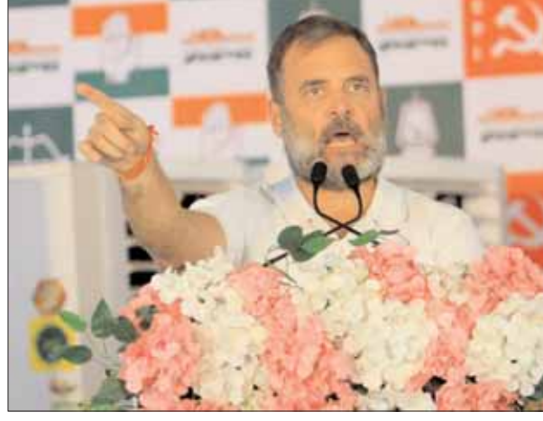
Congress leader Rahul Gandhi addressing a public meeting for Lok Sabha election in Chaibasa on Tuesday.

equal participation in education, health and government. But they are not tribals but Vanvasis. BJP said this because they don't want to give you rights. You are the first owner of India. You should get participation in