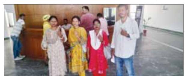
Three community health officers showing their inked index finger after exercising postal ballot voting today in Daltonganj.

The trio found postal ballot voting quite useful for personnel who will do poll duties having a feeling that they have cast their votes much ahead of the scheduled date of voting which for Palamu lok sabha seat is May 13.