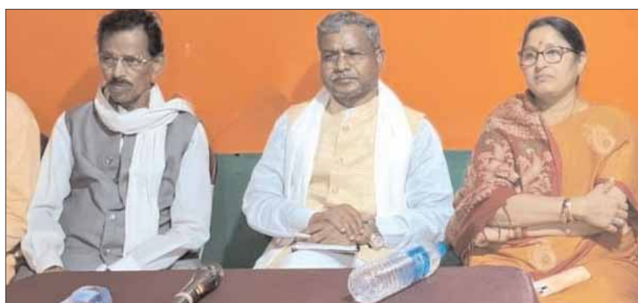
State BJP President Babul Marandi, Union Minister and BJP candidate Annapurna Devi along with others during a meeting in Giridih on Tuesday.