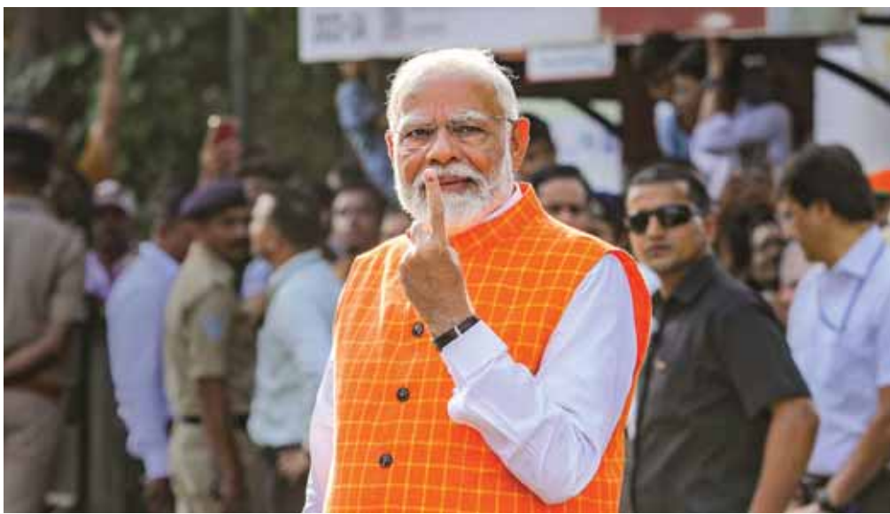
Prime Minister Narendra Modi shows his ink-marked finger after casting his vote for the third phase of Lok Sabha elections, in Ahmedabad, on Tuesday

Amidst the hostile weather conditions, the third phase of the Lok Sabha polls on Tuesday saw a further dip in the voting percentage which recorded 61.81 per cent voter turnout when compared to 66.14 per cent in the first phase followed by 66.71 per cent in the second. Comparatively, in the 2019 elections, these same 93 seats collectively recorded an overall turnout of 67.33 per cent. The third phase failed to buck the trend amid hot weather and heatwave in the polling States. Experts and political parties attributed the decline to heatwave and voters' apathy. The stakes are high for the BJP in this round as it had won an overwhelming majority of these seats, including all in Gujarat, Karnataka and Madhya Pradesh, in the last election. Fate of candidates for more than half of the 543 Lok Sabha has been sealed while four phases still remain for the counting to be done on June 4. Voting has been completed in 283 seats out of 543 seats so far. Except sporadic incidents of violence in four constituencies in West Bengal, the polling in 10 States and Union Territories has been peaceful. Five States — Assam, Chhattisgarh, Goa, Gujarat and Karnataka — have wrapped up