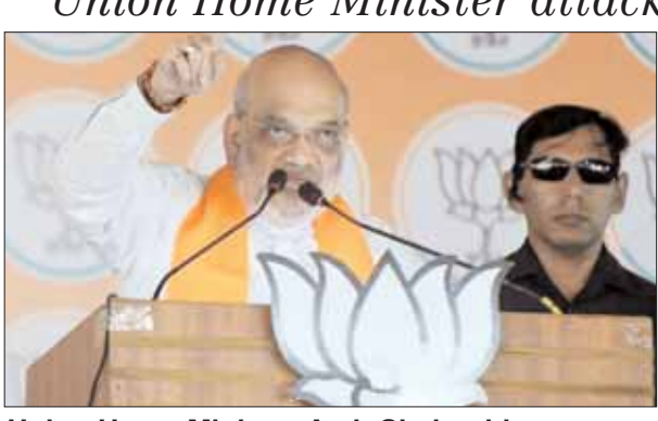
Union Home Minister Amit Shah addresses an election rally in support of BJP candidate Arjun Munda ahead of Lok Sabha elections, in Khunti on Friday.

Union Home Minister attacks INDI Alliance on Corruption