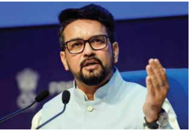
The Congress indulges in seeks Pakistan's support to get politics of appearement and votes, he alleged.

Congress leaders live in India but speak the language of Pakistan, Union Minister Anurag Thakur said on Friday and alleged that the grand old party seeks Pakistan's support to get votes. "Leaders of opposition parties, especially Congress, repeatedly make statements supporting Pakistan, crushing Dharma Sanatam and Hindu insulting community, besides pleading for more resources for people with more wives and children, Thakur told reporters in