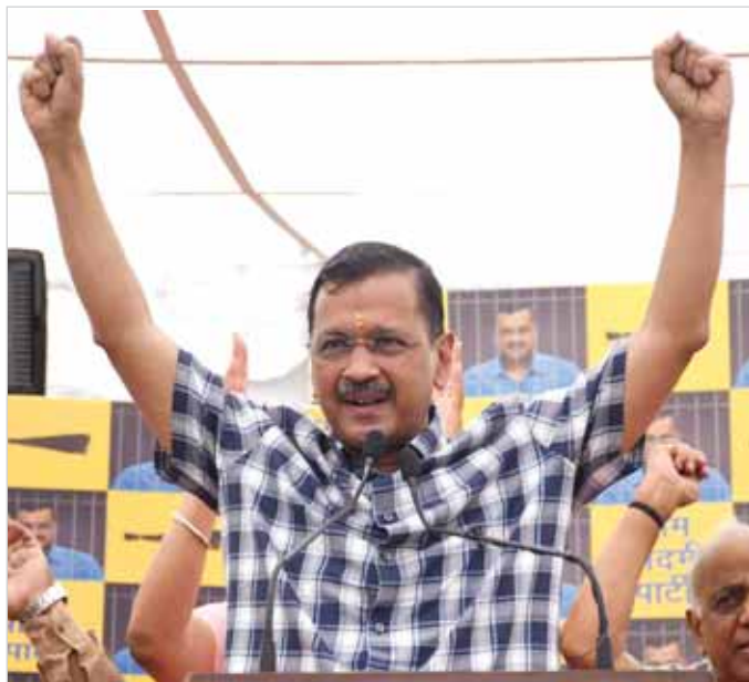
Delhi Chief Minister Arvind Kejriwal addresses a press conference

Filled with energy and high political spirit ever since he walked out from Tihar Jail on Saturday, Delhi Chief Minister Arvind Kejriwal while addressing his enthused party workers launched a scathing attack at the BJP and Prime Minister Narendra Modi, accusing him of crushing his and other Opposition parties. Kejriwal, who has launched his Lok Sabha campaign for the May 25 Delhi schedule, alleged that the BJP is on a mission to bring about dictatorship in the country. Besides the "one nation, one leader" jibe, the AAP convenor also accused the BJP of shielding corrupt leaders and asked them if they would live up to the rule of retirement at the age of 75 that was brought about by Prime Minister Narendra Modi. Kejriwal further claimed that the Prime Minister wants Amit Shah to succeed in his acknowledgement that the party is set to retain power for a third term. At the same time Kejriwal also asserted the BJP will not return to power and said the INDIA Bloc will form the Government on June 4. "In the last 20 hours after release from jail, I talked to poll experts and people and got to know the BJP is not going to form the Government. The AAP will be part of the Government at the Centre. We will get full Statehood for Delhi and it shall have a people's Governor, not a man from Gujarat," he said, while adding that according to his assessment that the BJP is not getting more than 220-230 seats.