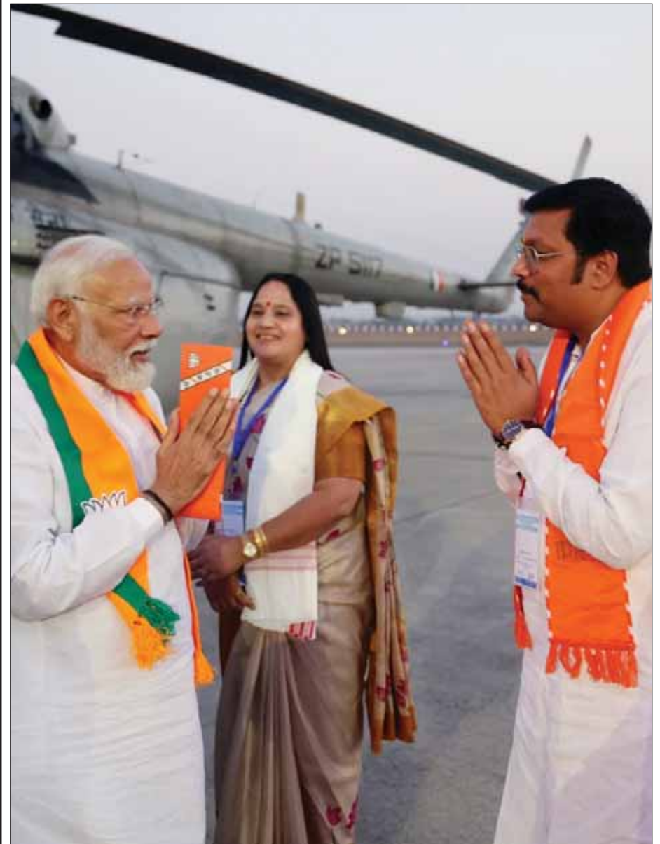
State BJP leader Yogendra Pratap Singh welcoming Prime Minister Narendra Modi at Birsu Munda Airport in Ranchi on Saturday.

According to the weather center, the weather patterns of the state will continue to change till May 15. During this period, it may rain intermittently at some places. Maximum and minimum temperatures may remain below normal. There may be light to moderate rain at many places in the state from May 12 to 15. There may be rain with thunder at some places. During this period the maximum temperature can be up to 35 degrees Celsius.