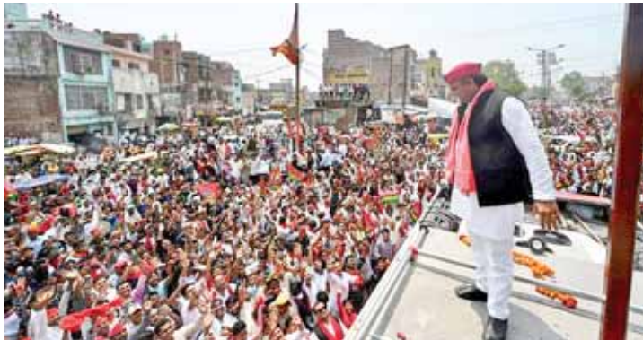
Samajwadi Party President Akhilesh Yadav during his campaign for Lok Sabha elections, in Kannauj district, on Saturday

In the heartland of Uttar Pradesh, the stage is set for a political spectacle as former Chief Minister Akhilesh Yadav braces himself for an electoral showdown in Kannauj. This battleground holds more than just electoral significance; it is a symbolic arena where familial legacies clash, and political destinies are determined. At the core of this unfolding drama lies a deeply personal quest for redemption. Akhilesh's decision to contest from Kannauj is not merely a strategic move but a poignant attempt to avenge his wife Dimple Yadav's defeat in the previous elections. The sting of that loss still resonates, propelling Akhilesh with a fervent resolve to reclaim Kannauj for the Samajwadi Party (SP), a stronghold nurtured by his father, Mulayam Singh Yadav. "The wounds of defeat run deep, but so does our determination," declares Akhilesh, his voice echoing with unwavering resolve. "Kannauj embodies our legacy, and we will not allow it to slip away." In the 1990s, Mulayam strategically expanded his influence in Kannauj, a constituency dominated by Yadavs and Muslims, transforming it into a bastion for the SP's first family. Over 16 elections held in Kannauj since 1967, Mulayam-affiliated candidates emerged victorious 10 times, while non-Yadav candidates