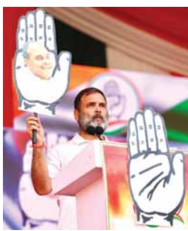
Congress leader Rahul Gandhi addressing an election rally in Andhra Pradesh on Saturday canvassing for Kadapa candidate Sharmila YSR, daughter of former Chief Minister late Y Rajashekhar Reddy

Lauding the initiative for a public debate on the Lok Sabha elections, former Congress president Rahul Gandhi on Saturday said he or party chief Mallikarjun Kharge would be pleased to participate in such a discussion and expressed hope that Prime Minister Narendra Modi would also take part. "It would be a positive initiative for the major parties to present their vision to the country from one platform for a healthy democracy," Rahul said in a social media post. He also added that the nation expects Modi to participate in the debate. There is yet any response on the subject from the BJP. The Congress leader shared on social media his reply to Justice (Retd) Madan B Lokur, Justice (Retd) Ajit P Shah and N Ram, who had written to him and the prime minister earlier this week, inviting them to a platform for a debate on the key election issues. In their letter addressed to the