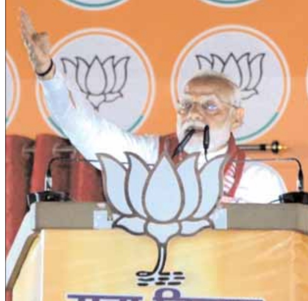
Prime Minister Narendra Modi speaks during a public meeting for Lok Sabha election in Chatra on Saturday.

poor family. I have seen poverty. I have come out after experiencing what hunger is. I do not want any child in the