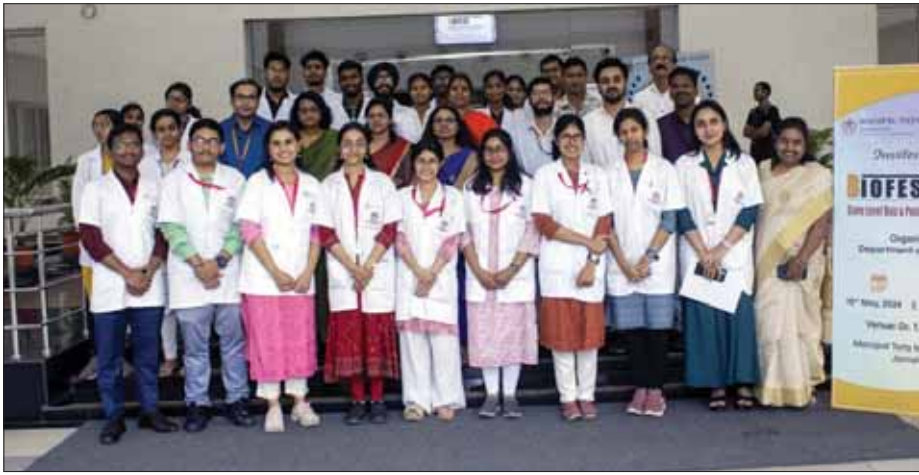
Chandravanshi Medical College Palamu, SBMCH Hazaribagh, and PJMCH Dumka, along with teams of MTMC Jamshedpur.

The event provided a platform for budding medical minds to display their prowess in medicine and artistic talents. After rigorous preliminary rounds, 28 finalists from seven teams emerged, representing esteemed institutions such as MGM Medical College Jamshedpur, Lakshmi