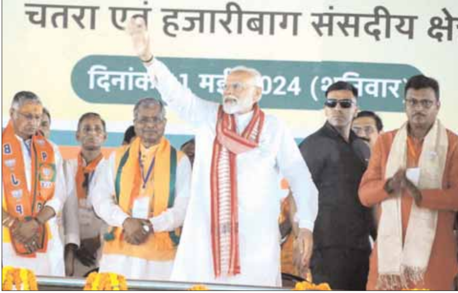
Prime Minister Narendra Modi waves to gathering during a public meeting for Lok Sabha election in Chatra on Saturday. Pix by Vinay Murmu

Prime Minister Narendra Modi today said that the JMM-Congress coalition in Jharkhand is engaged in deep rooted corruption and have set up only one industry in Jharkhand that is of Opium. He said that the coalition wants to ruin the future of the youth for their own interests. Addressing a rally at Simaria in Chatra, PM Modi said, "You remember, before the elections, JMM had promised to provide 5 lakh jobs every year. What jobs did you give? JMM Congress has established only one industry in Jharkhand, opium industry. What will opium do? It will destroy generations. Black business is running under the protection of the government. They want to throw your children into the quagmire of drugs. Congress and its allies do not care about your feelings at all." Modi further said that the JMM and Congress have the same agenda, neither will they work nor will they allow anyone to work.