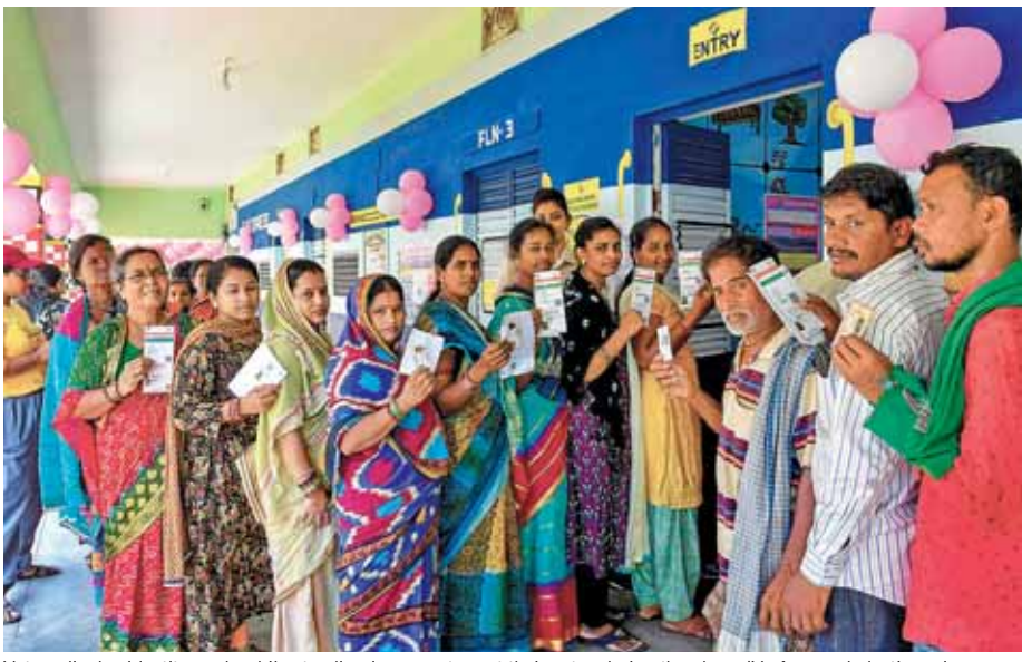
Voters display identity cards while standing in queue to cast their votes during the phase IV of general elections, in Berhampur, Odisha, on Monday

The intense voters' awareness programmes for increasing the turnout remained futile as the phase four general elections on Monday saw the average plummeting to over 63 per cent till 8.30 pm on Monday. The voter turnout in the first three phases was 66.14 per cent, 66.71 per cent and 65.68 per cent, respectively. Interestingly the good news came in from Jammu and Kashmir which saw voting after abrogation of Article 370. Srinagar recorded 36.88 per cent voter average. This figure is higher than Srinagar's turnout in 2019 when it saw a turnout of 14.43 per cent. The figures for 2014, 2009, 2004 and 1999 are 25.86 per cent, 25.55 per cent, 18.57 per cent and 11.93 per cent respectively. Elections were held in 96 constituencies spread over 10 States and UTs amid incidents of violence between Trinamool Congress and BJP workers in West Bengal, while YSRCP and TDP cadres came to blows at multiple locations in Andhra Pradesh as well as reports of poll boycott in some Uttar Pradesh villages. Besides, there were also