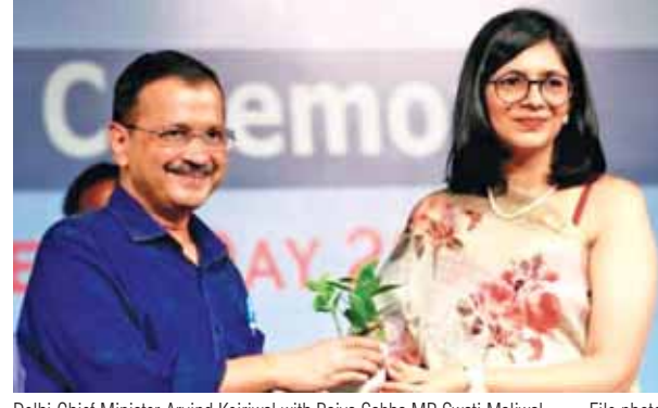
Delhi Chief Minister Arvind Kejriwal with Rajya Sabha MP Swati Maliwal