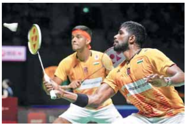
His win over Indonesia's Anthony Ginting was a confidence booster but the loss against China's Shi Yuqi will trouble him as he needs to close out such narrow games to