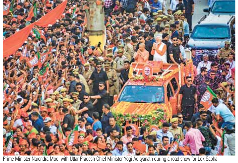
Prime Minister Narendra Modi with Uttar Pradesh Chief Minister Yogi Adityanath during a road show for Lok Sabha elections, in Varanasi, on Monday