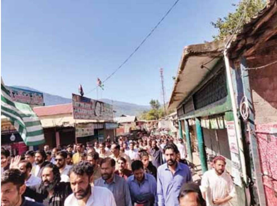
The situation remained tense as strike in PoK entered fourth day

left for Muzaffarabad, the capital of Pakistan-occupied Kashmir, on Monday as the wheel-jam strike entered its fourth day.